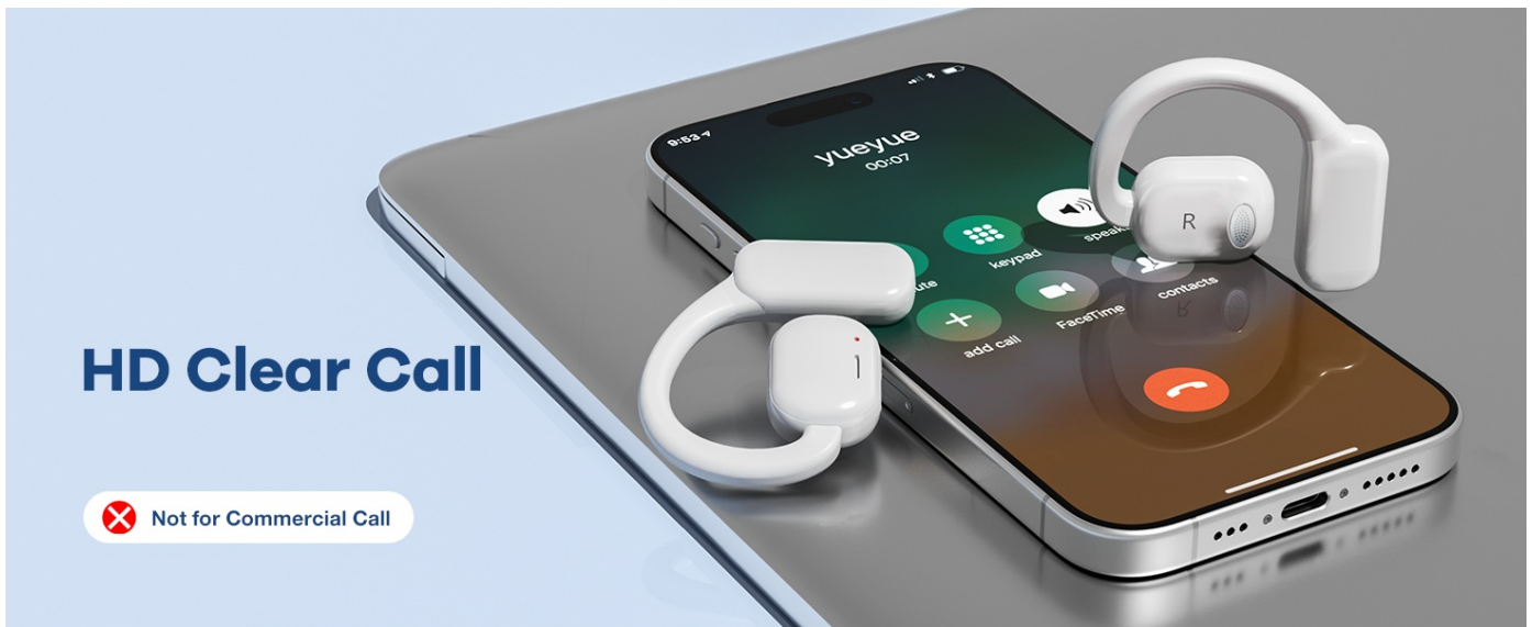
Image: ROPASOMIC i27 earbuds shown with a phone call interface, illustrating HD Clear Call capability.