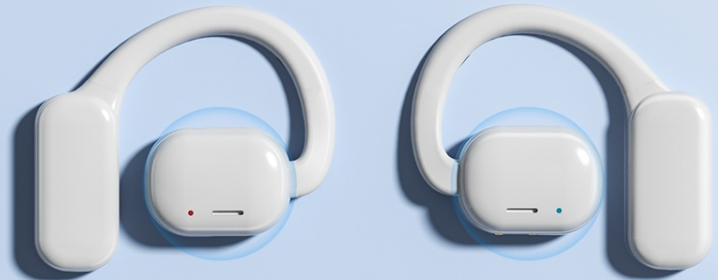
Image: Detailed touch control guide for the ROPASOMIC i27 earbuds.