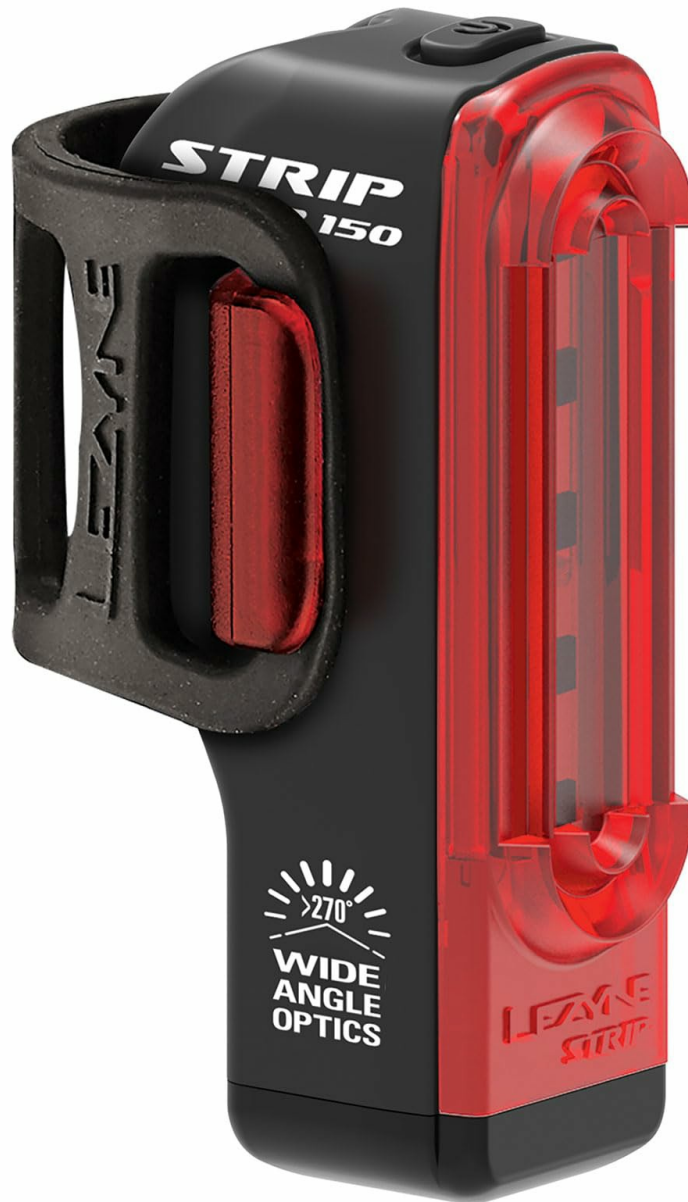
Figure 1: LEZYNE Strip Drive 150 Lumens Rear Bicycle Light