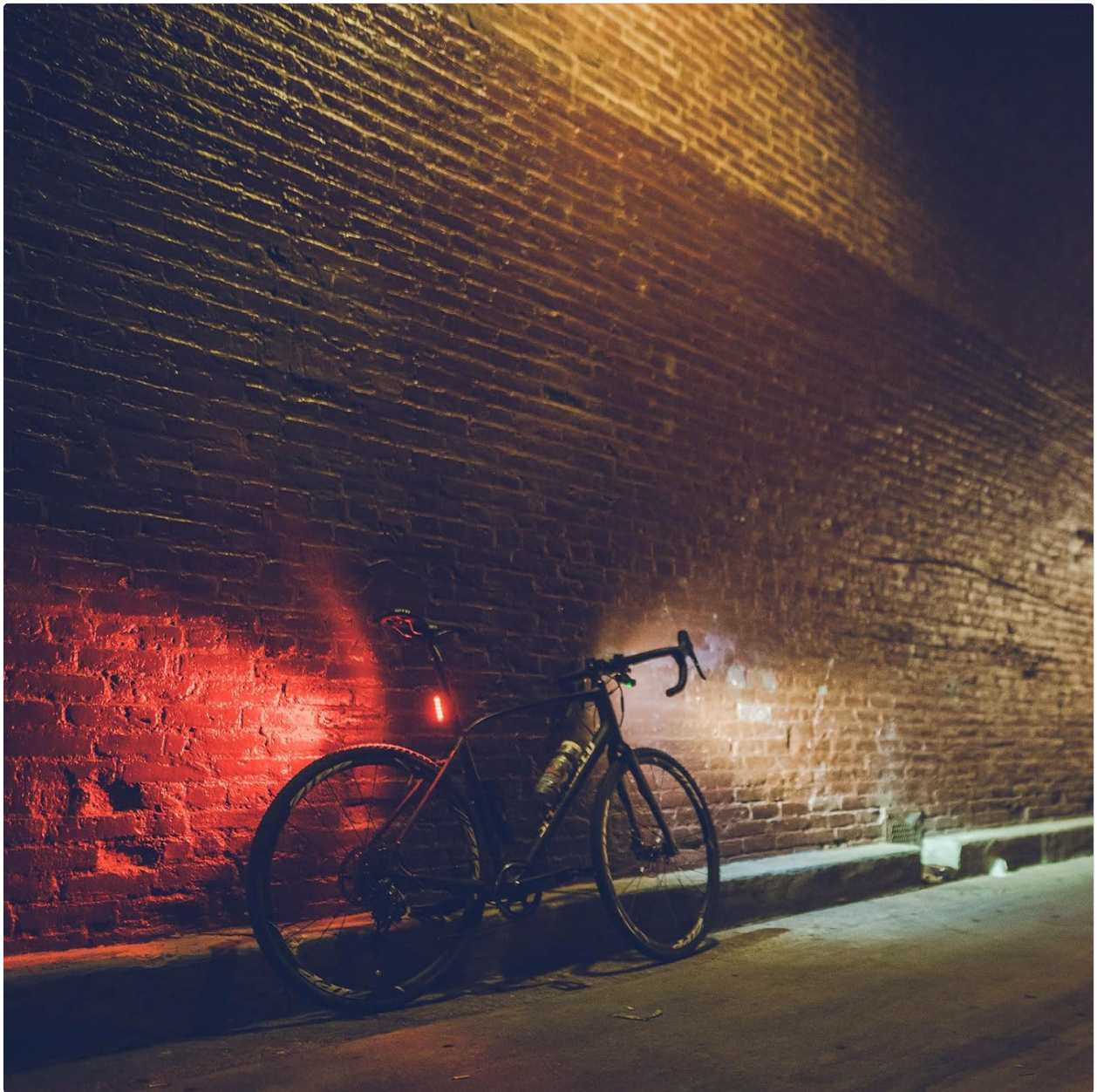
Figure 7: Enhanced visibility with the light at night