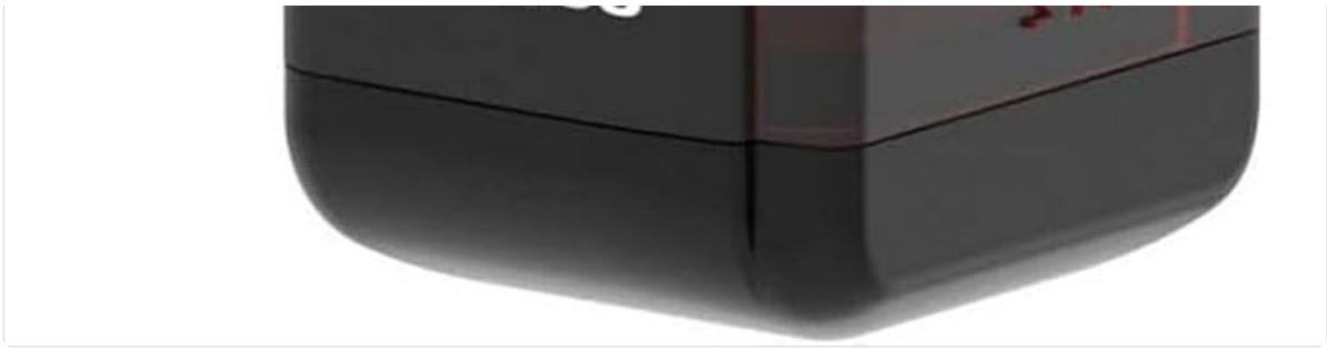
Figure 5: Rear view of the light