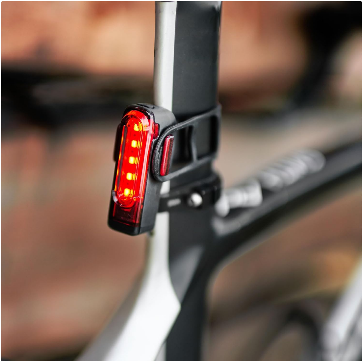
Figure 3: Side view of light on a bicycle