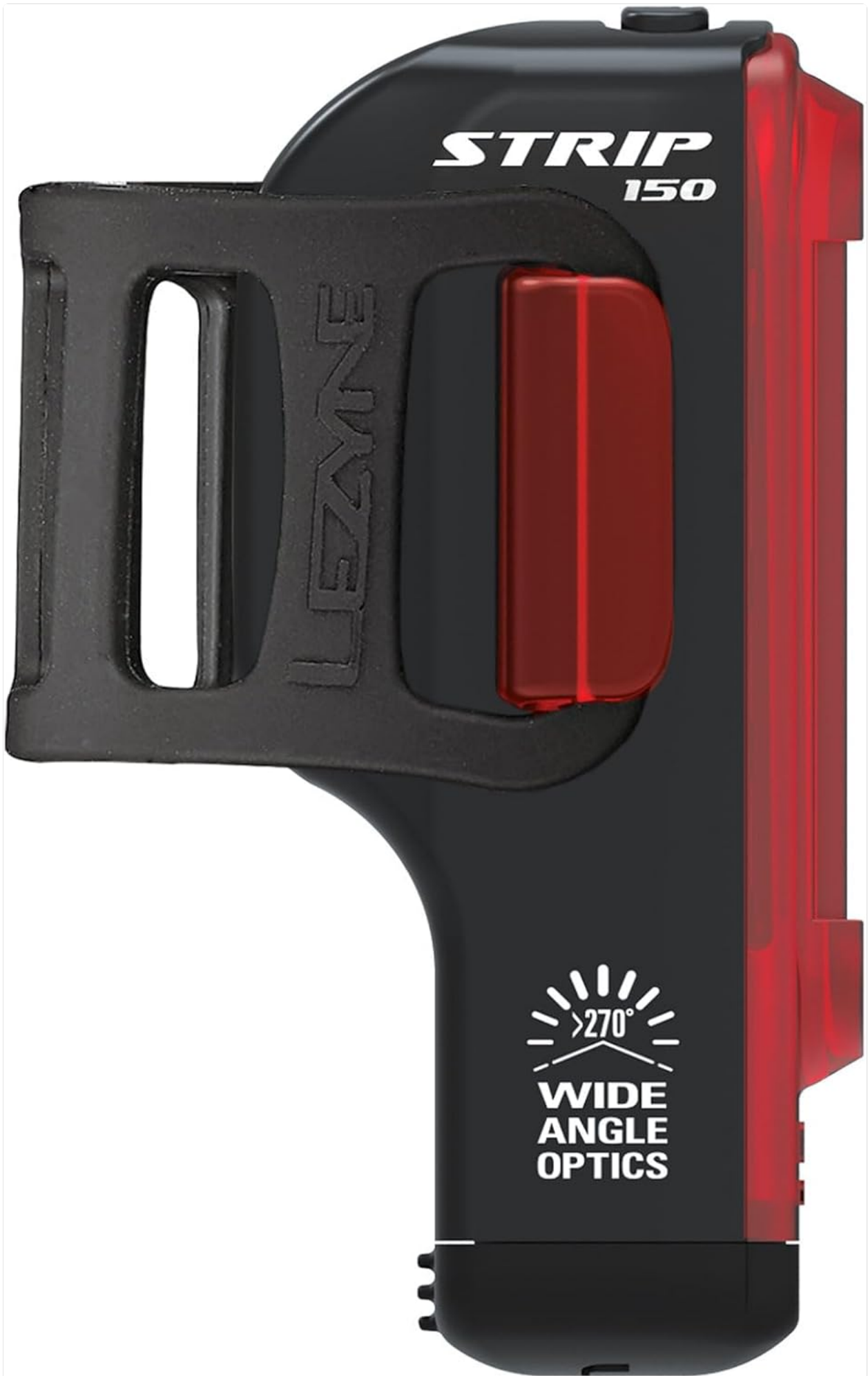
Figure 4: Front view of the light