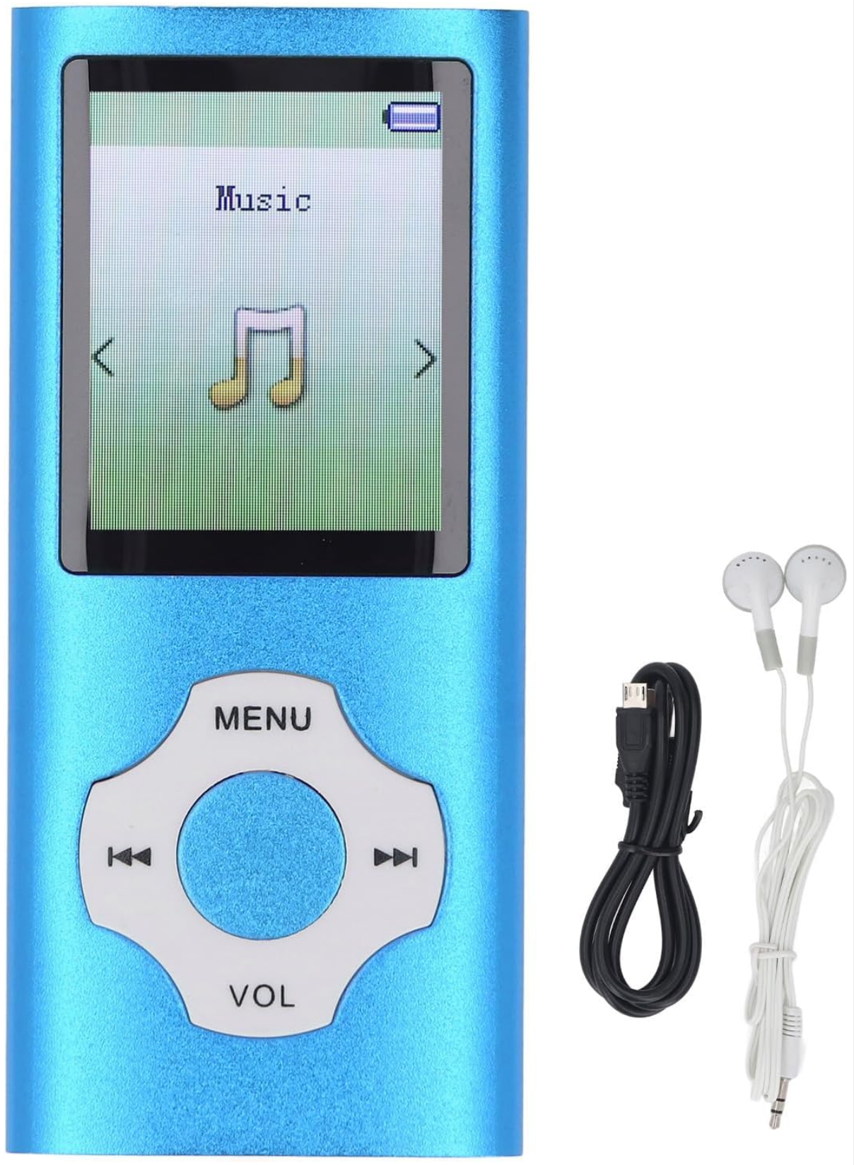
Image: The MP3/MP4 player shown alongside its USB data cable and a pair of white earphones, representing the typical package contents.

Your browser does not support the video tag.