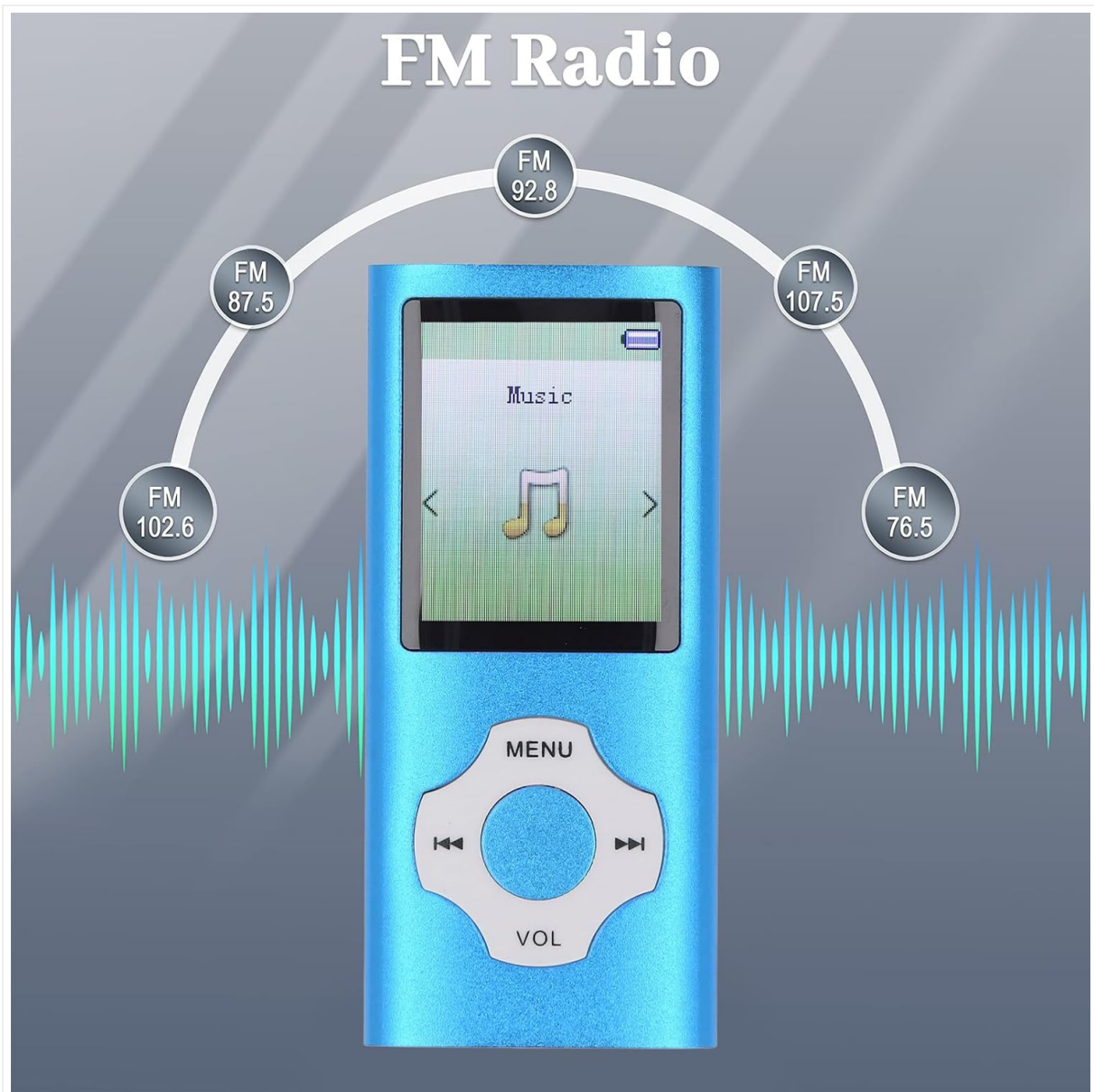
Image: The MP3 player's screen showing an FM radio interface with various frequencies (e.g., FM 87.5, FM 92.8, FM 102.6, FM 107.5, FM 76.5) indicated around the device.