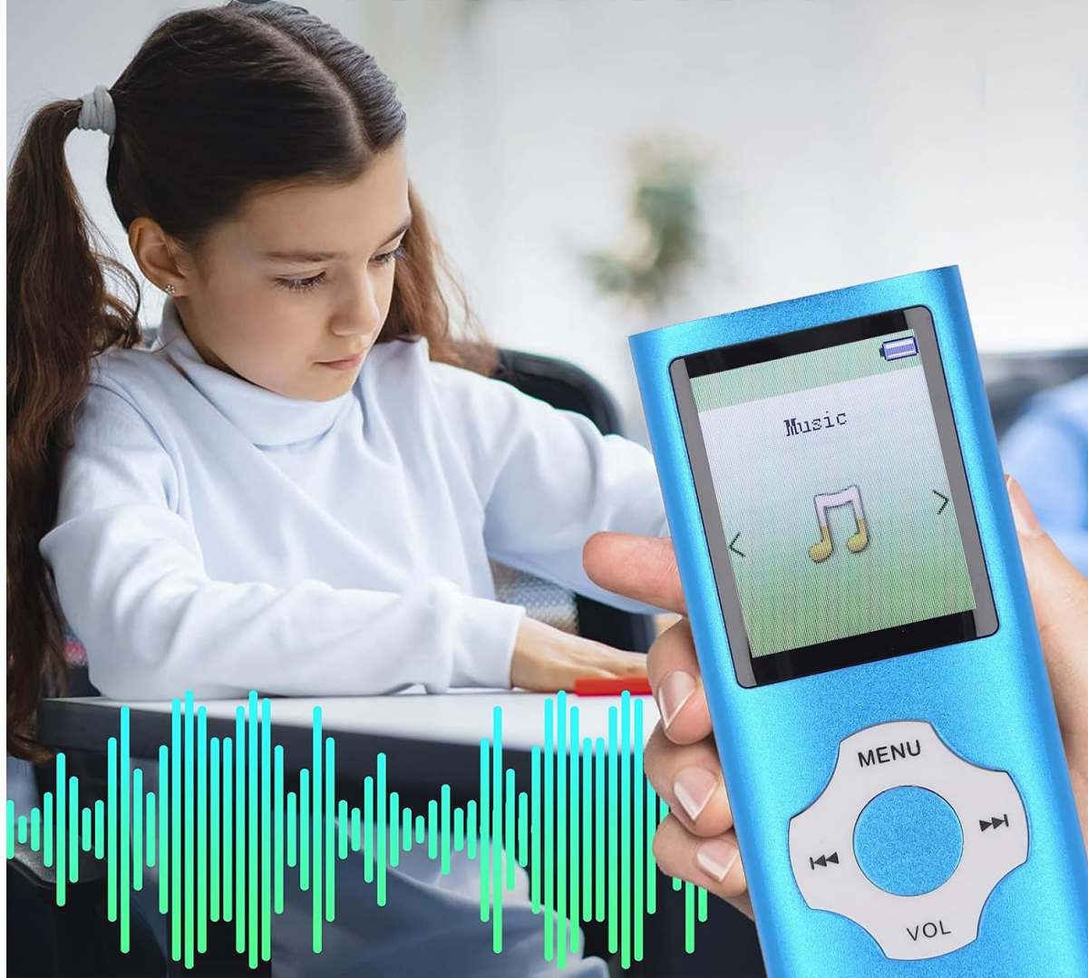
Image: A close-up of the MP3 player held by a child, with the screen showing a voice recording function and visual sound waves.