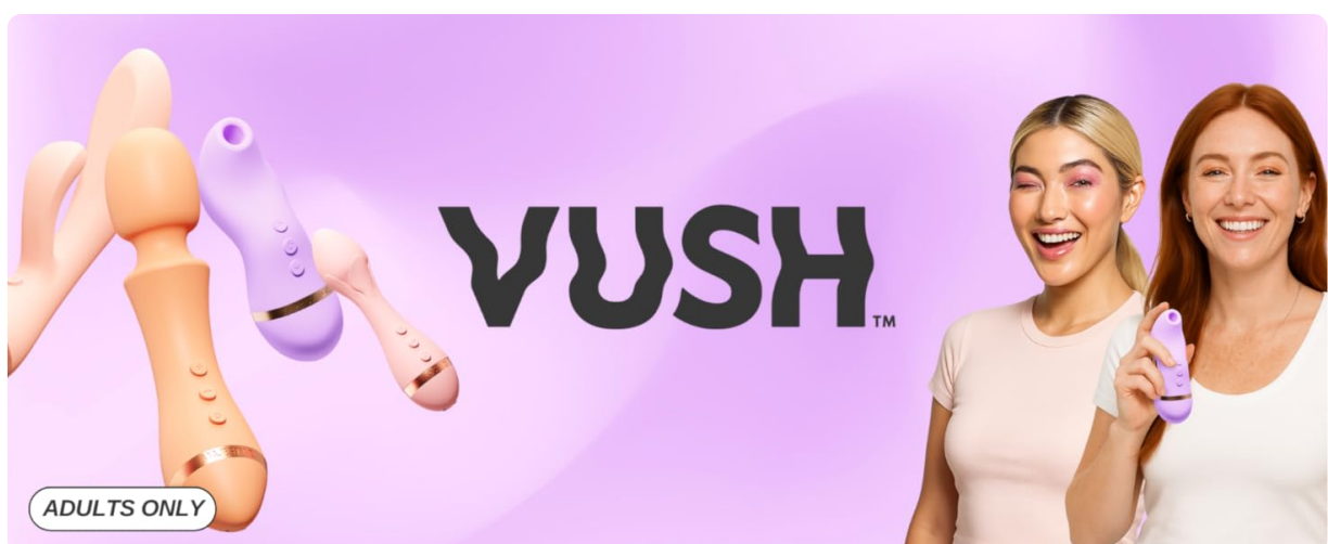
Figure 2: Overview of VUSH Empress Tidal key features and benefits.