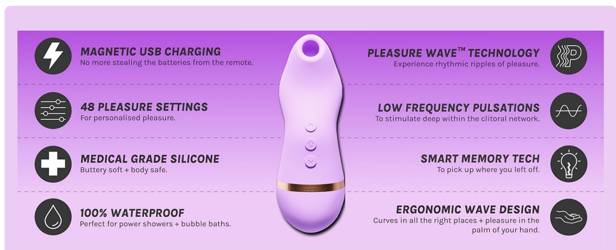
Figure 4: Benefits of magnetic USB charging.