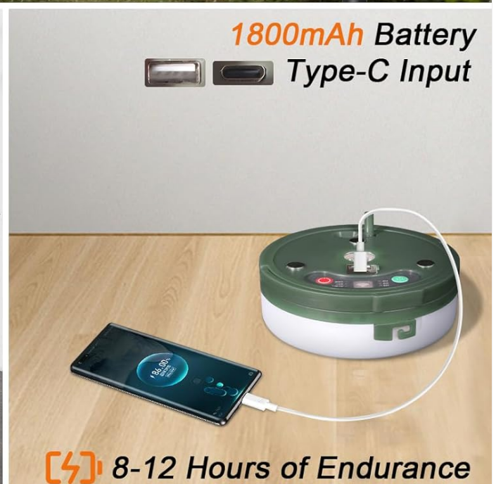
Image: The camping light connected for charging and demonstrating its power bank capability.