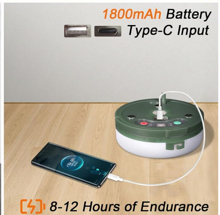
Image: Charging the HELESIN camping light and using it as a power bank.