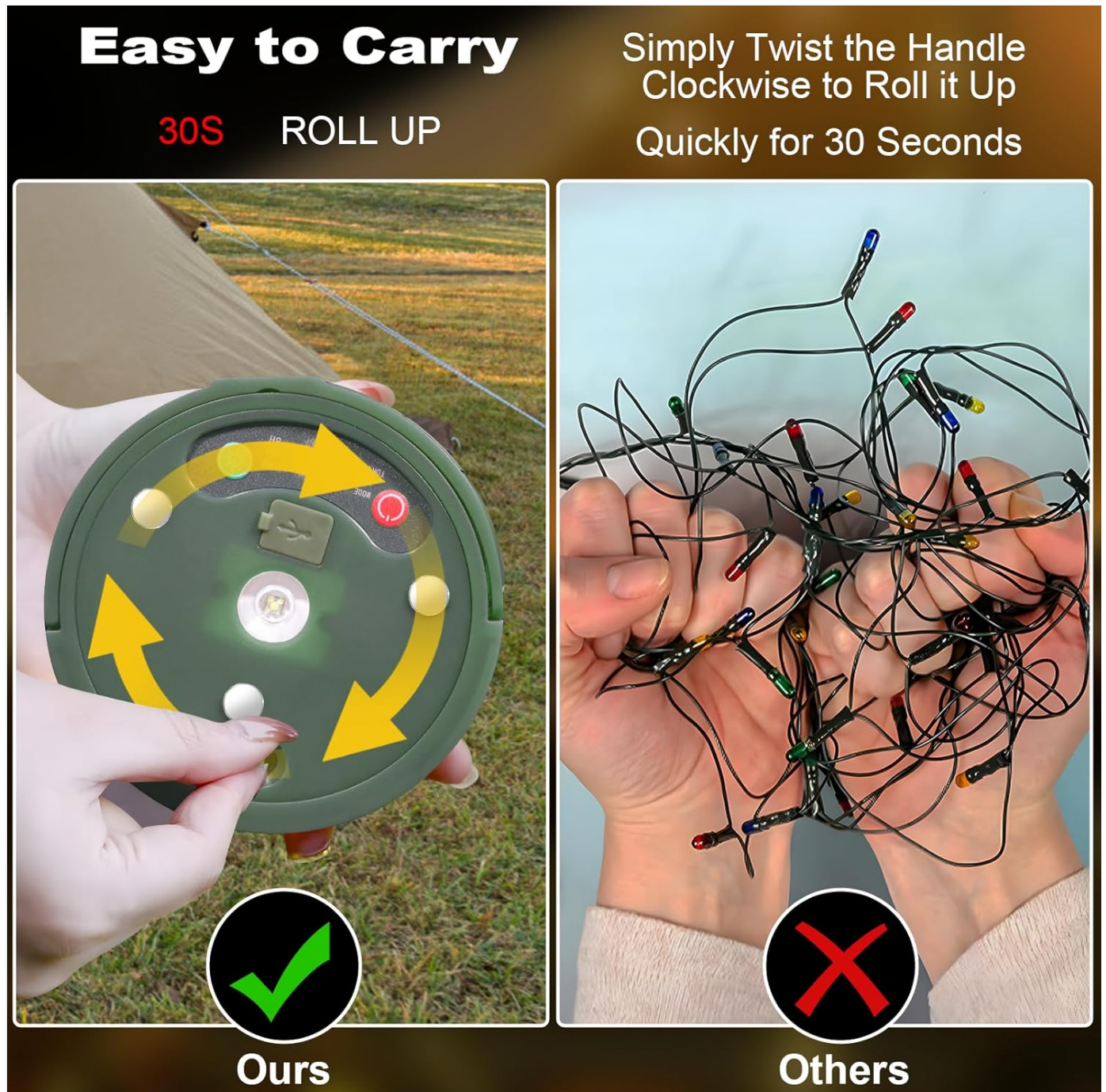
Image: The easy retraction mechanism for the string lights, preventing tangles.

To store the string lights, gently rotate the joystick in the rotation area clockwise. This mechanism allows for quick and tangle-free retraction of the string lights into the main unit. This process takes approximately 30 seconds.