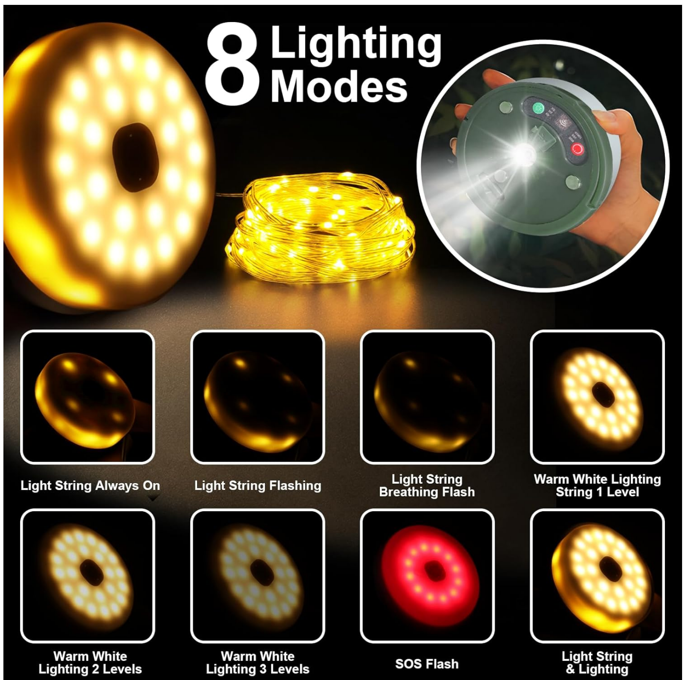
Image: The 8 distinct lighting modes of the HELESIN camping light.