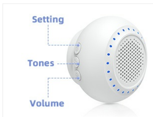
Image: The control buttons on the side of the receiver for adjusting settings, tones, and volume.