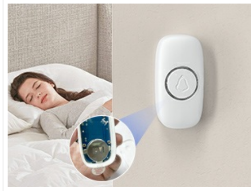
Image: The internal battery compartment of the wireless push-button transmitter.