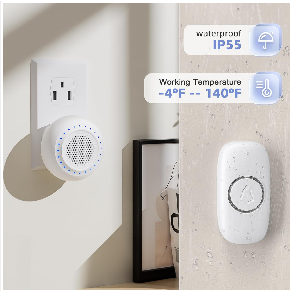
Image: The weatherproof transmitter installed on an exterior wall, highlighting its durability.