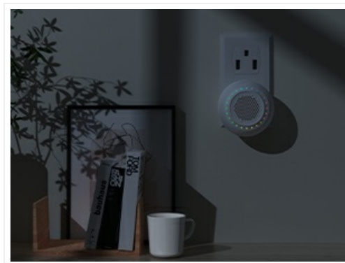
Image: The plug-in receiver connected to a wall socket, demonstrating its compact design.

Plug the receiver into any standard electrical outlet indoors. For optimal range, avoid plugging it into an outlet near large metal objects or other electronic devices that may cause interference.