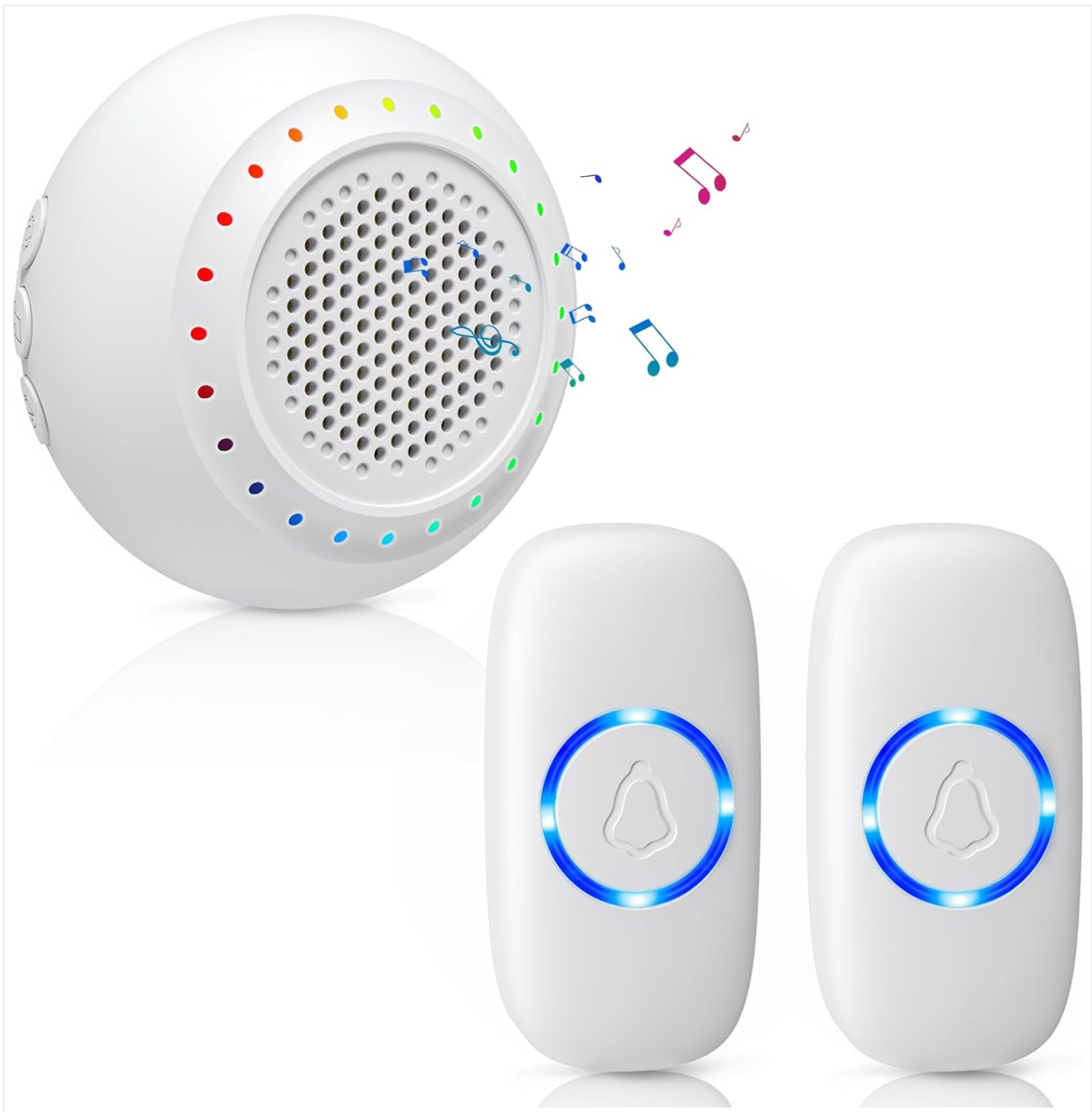
Image: The PHYSEN Wireless Doorbell System, including one plug-in receiver and two wireless push-button transmitters.