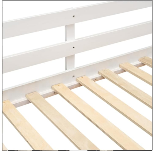
Image: A composite image showing a stack of pine wood logs and a close-up of the bed's wooden slats, emphasizing the strong and durable wood construction of the bed.