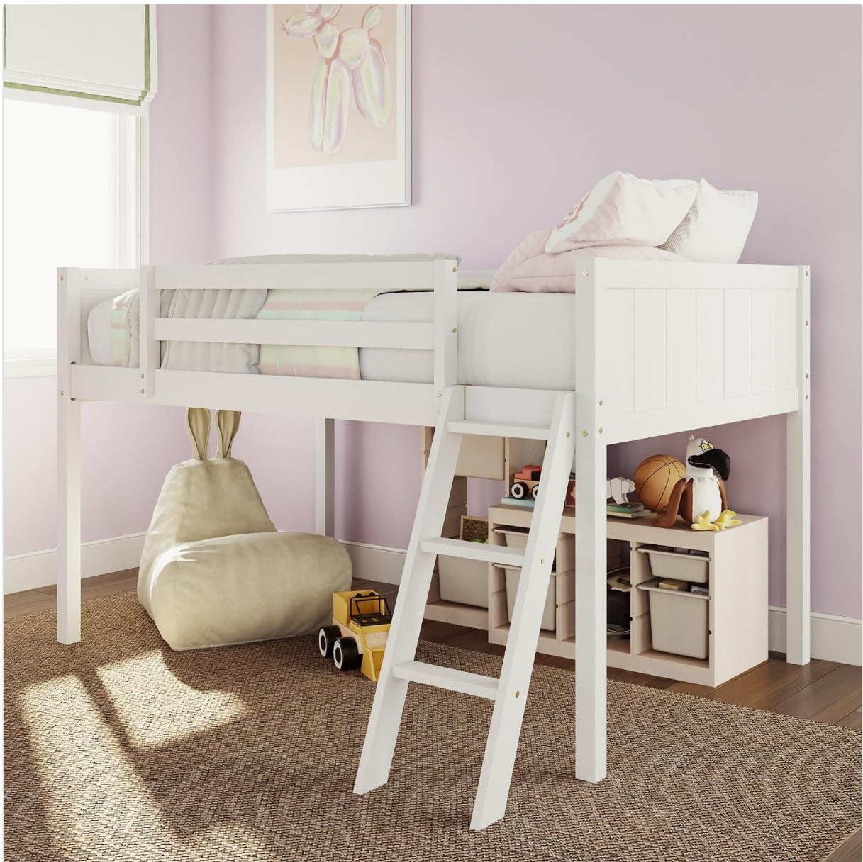
Image: A fully assembled Merax Wood Low Loft Bed in white, featuring the ladder and guardrails, positioned in a child's room with under-bed storage.