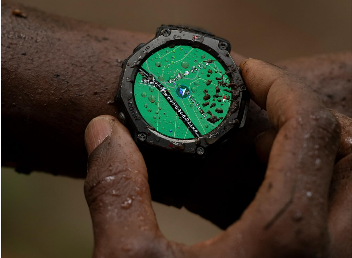
Image: The Amazfit T-Rex 3 displaying an offline map on a user's wrist, showing advanced navigation features.

GPS a doppia banda e 6 sistemi satellitari Mappe offline gratuite con indicazioni di svolta