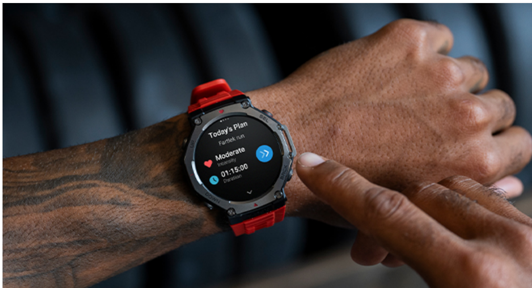
Image: The Amazfit T-Rex 3 displaying a personalized training plan for a Fartlek run.