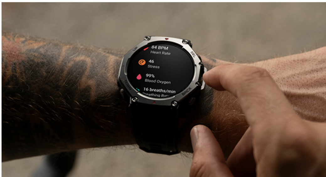
Image: The Amazfit T-Rex 3 displaying current heart rate, stress level, and blood oxygen saturation.