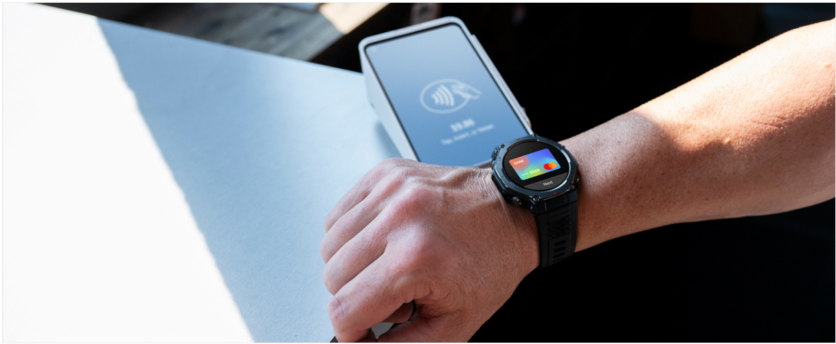
Image: A user making a contactless payment using the Amazfit T-Rex 3 Smartwatch.