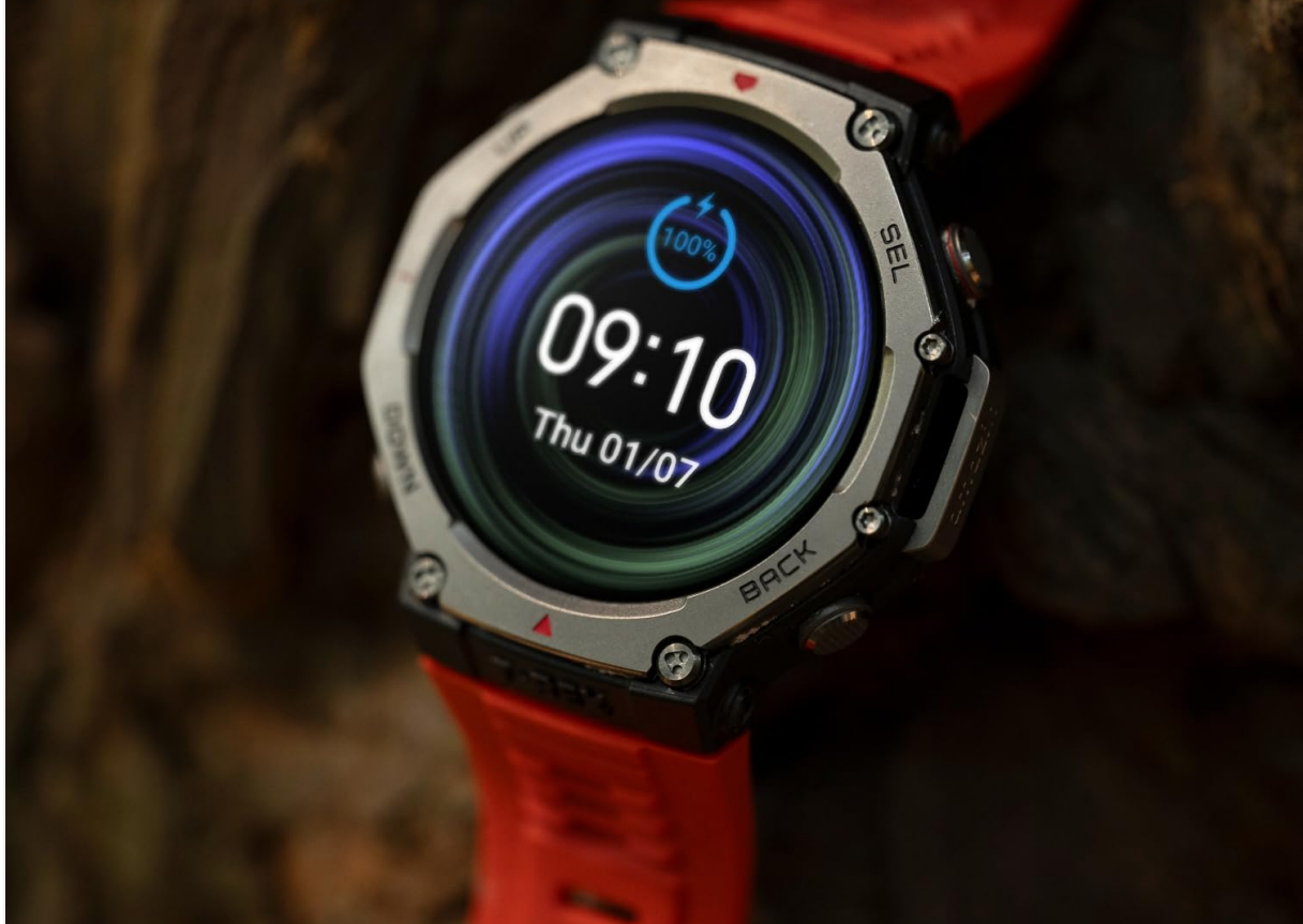
Image: The Amazfit T-Rex 3 displaying its impressive battery life statistics under various usage scenarios.