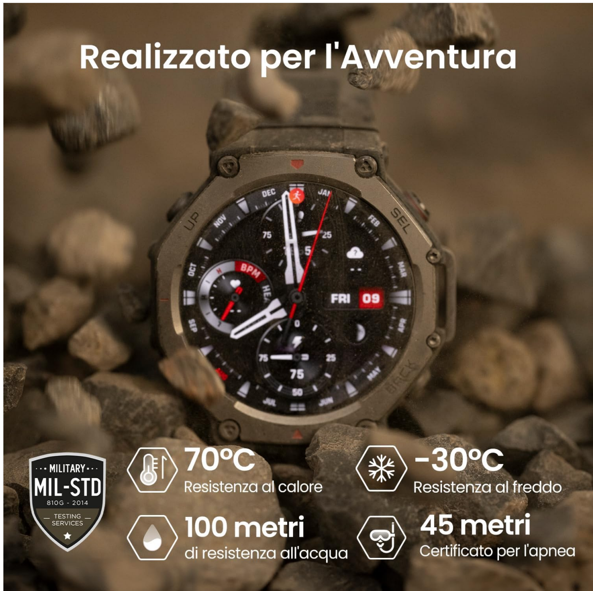
Image: The Amazfit T-Rex 3 highlighting its military-grade durability, extreme temperature resistance, and water resistance ratings.