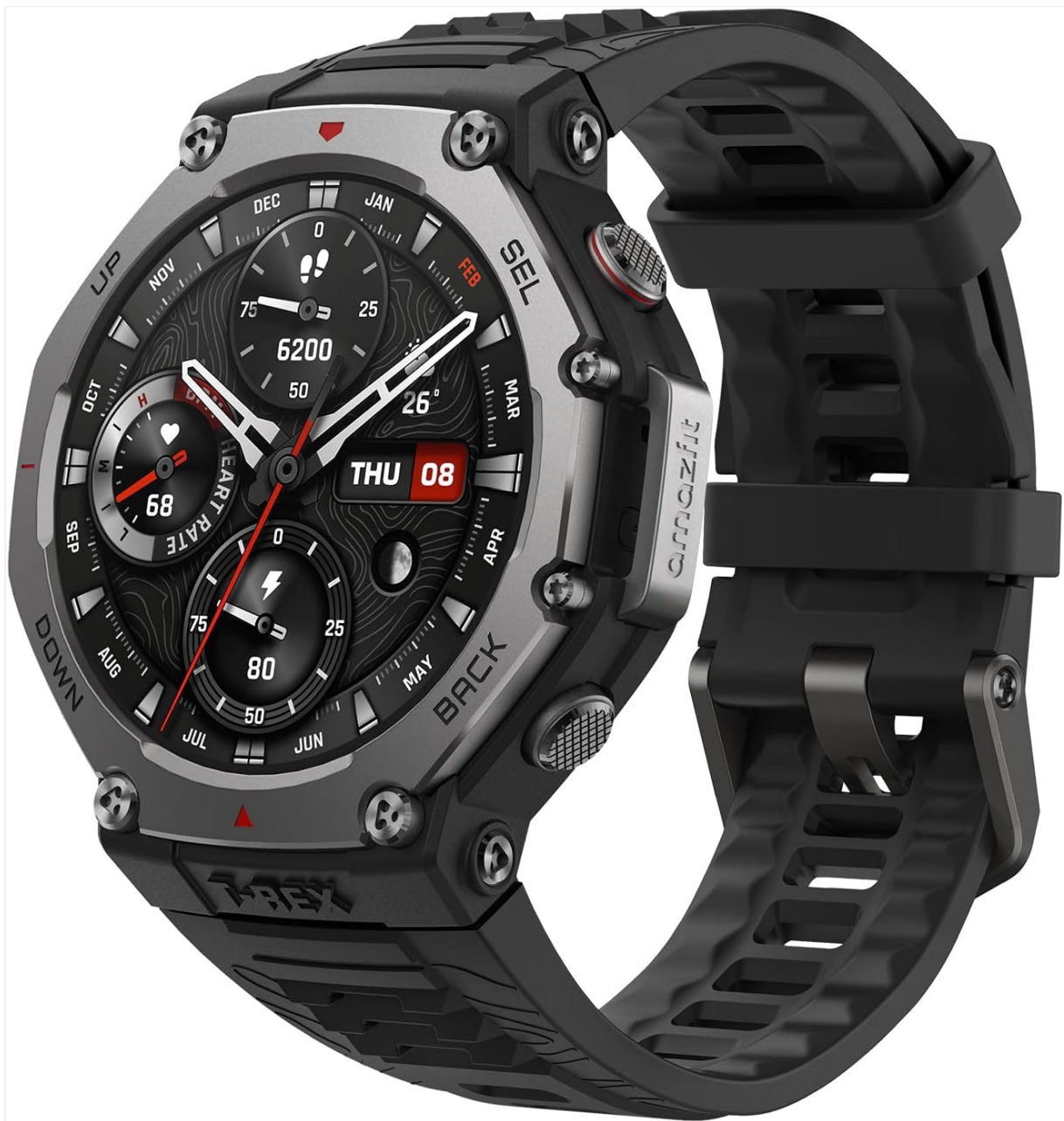
Image: Angled view of the Amazfit T-Rex 3 Smartwatch, highlighting its robust construction and display.