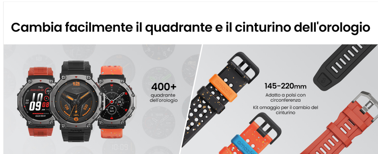
Image: Various Amazfit T-Rex 3 watches showcasing different watch faces and interchangeable strap designs.