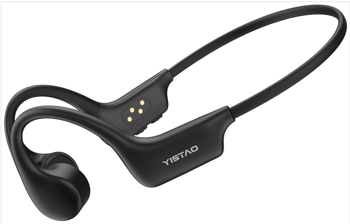
Image: Yistao X6 Bone Conduction Headphones, black color, showing the overall design with the band connecting the two ear pieces.