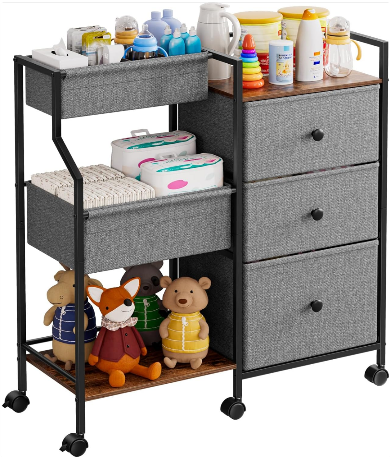
Image 1.1: The Modanais 3-Tier Rolling Diaper Caddy Organizer and Storage Cart in Grey, showcasing its multi-level storage, fabric drawers, and mobile design.