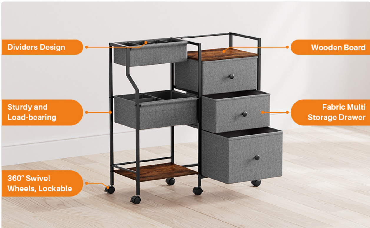
Image 3.1: Visual representation of key components including dividers, wooden board, fabric drawers, and swivel wheels, aiding in assembly.