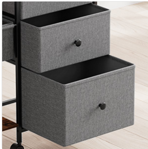
Image 4.2: A close-up view of the fabric drawers, highlighting their capacity for various items.