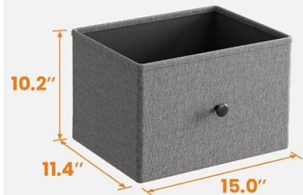
Image 7.1: Detailed product dimensions for the Modanais Rolling Cart and its individual storage components.