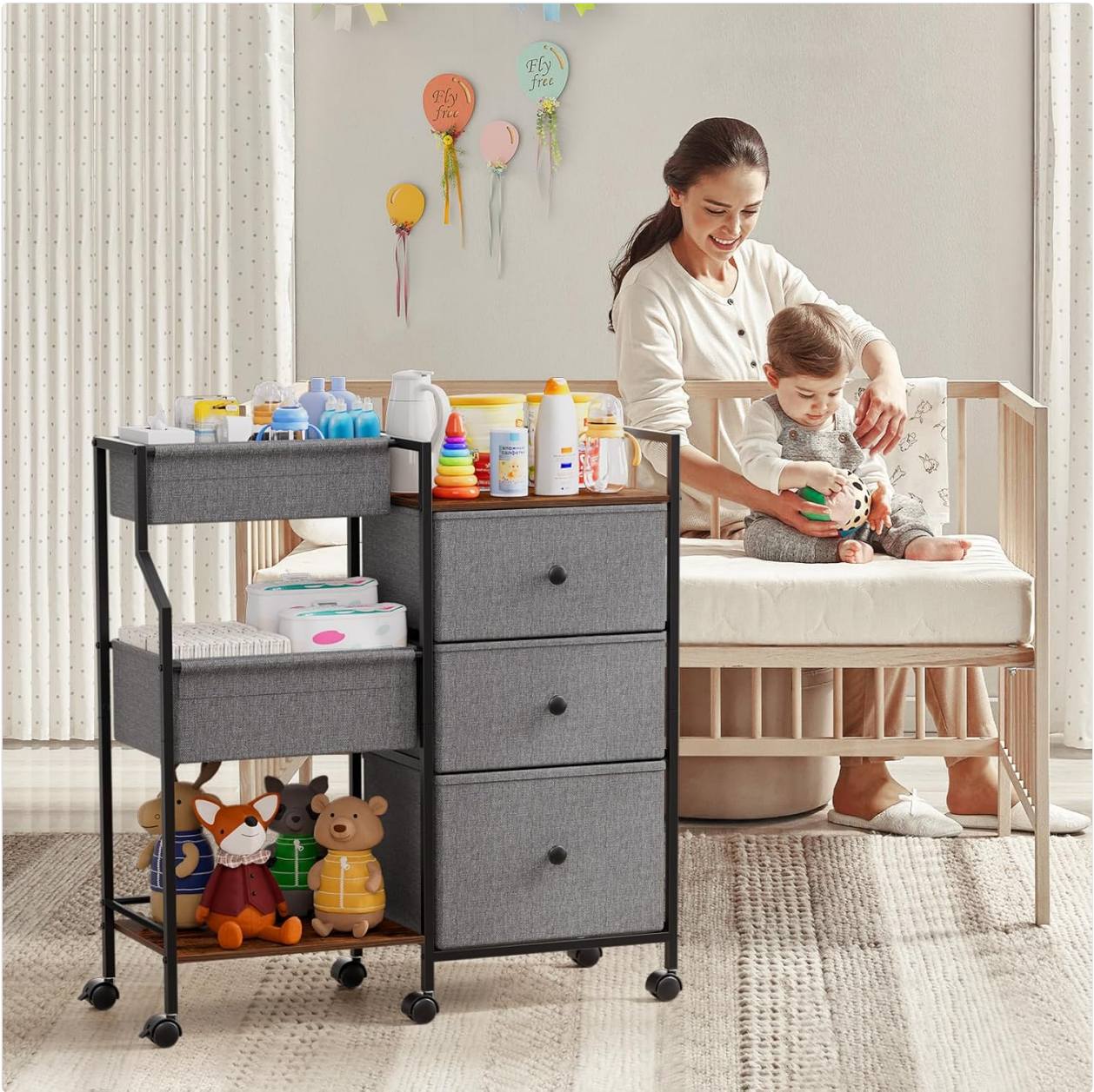
Image 4.1: The rolling cart positioned in a nursery, demonstrating its utility for storing baby items near a crib.