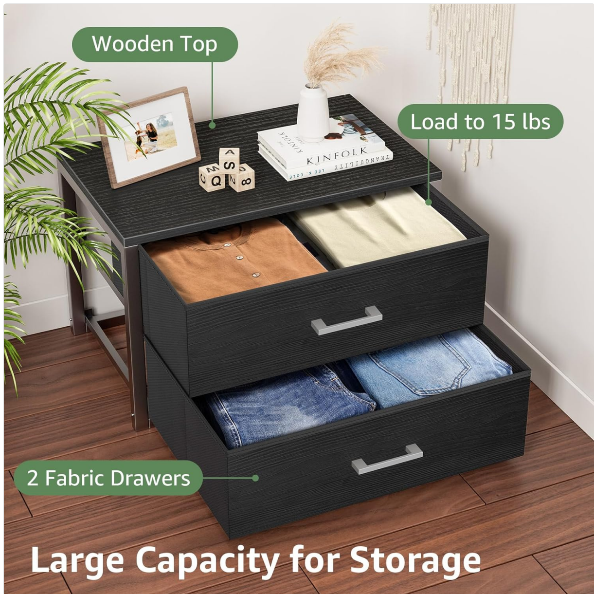
Figure 4.4: Large Capacity for Storage