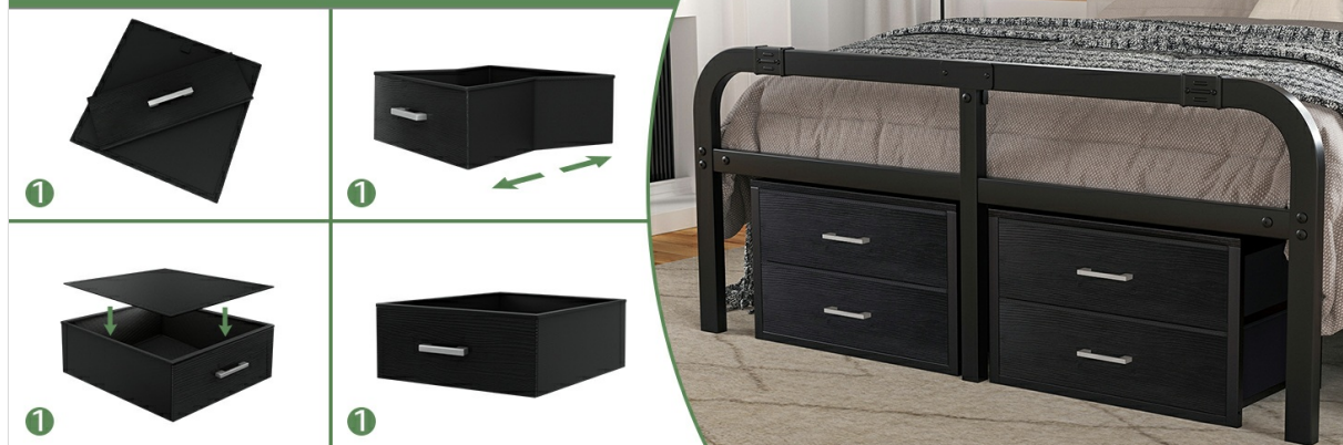
Figure 2.1: Product Components and Dimensions