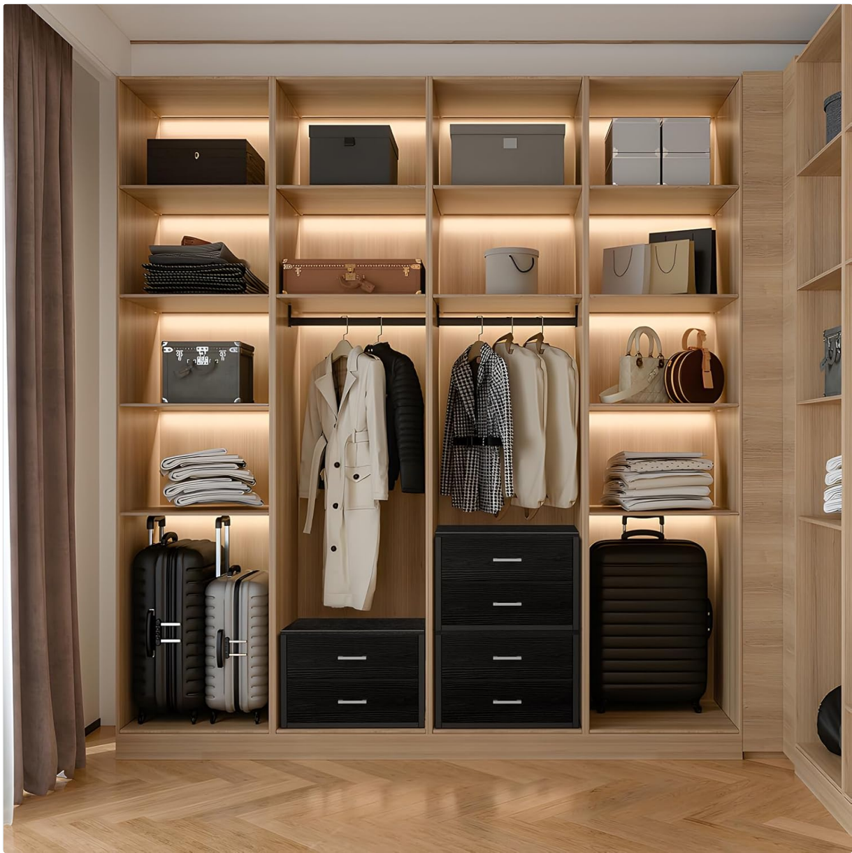
Figure 3.3: Wooden Top Board