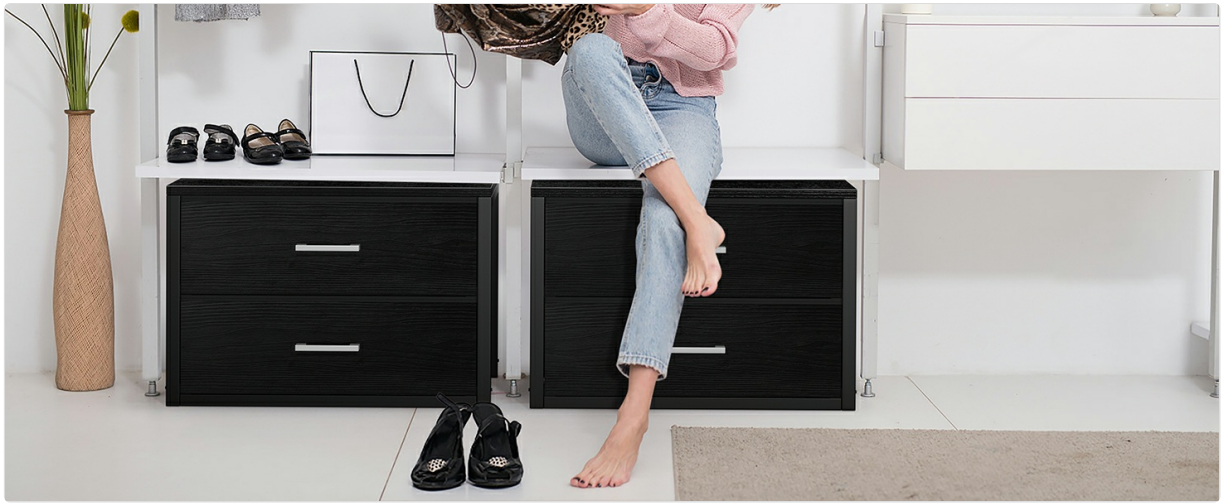
Figure 4.2: Stackable Design with Rubber Pads