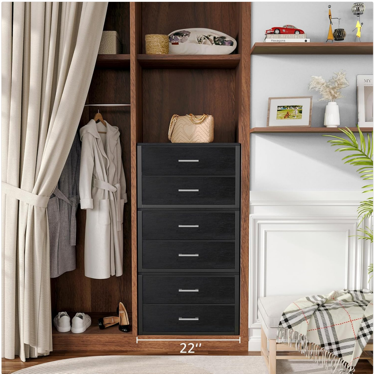
Figure 4.1: Units Used Side-by-Side