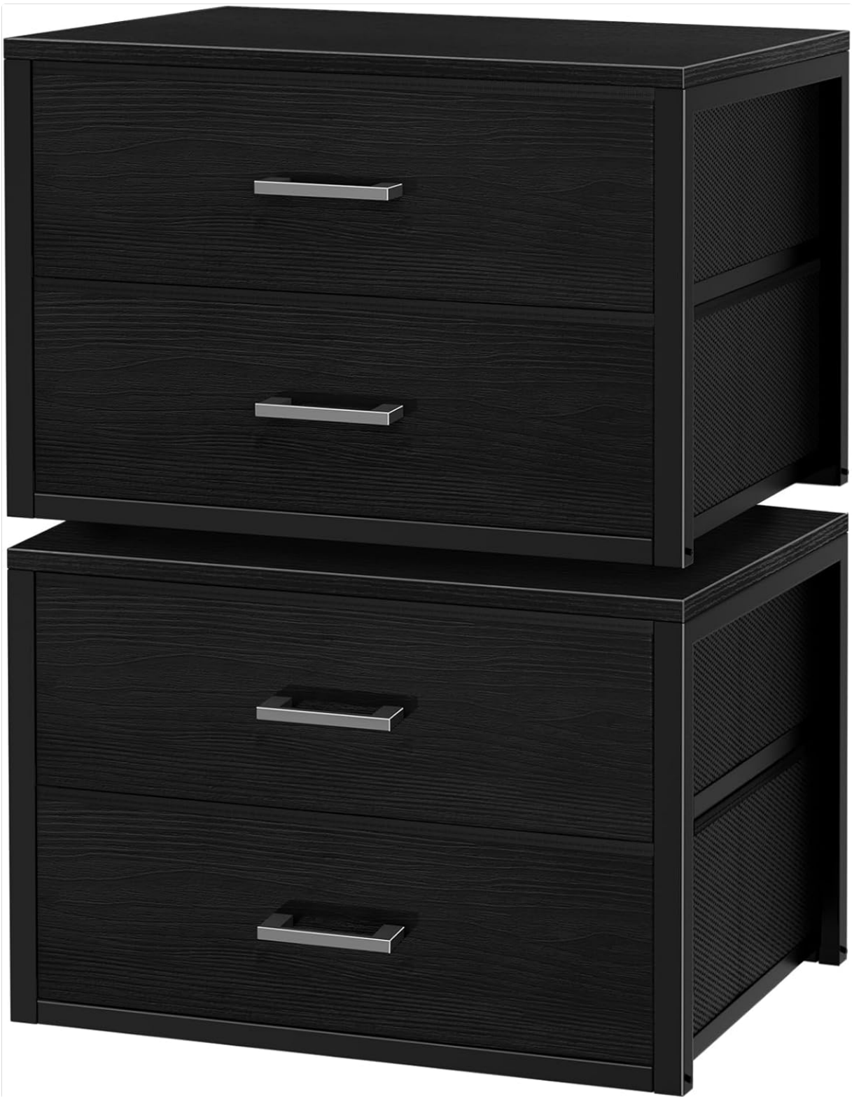
Figure 4.3: Stacked Storage Drawers