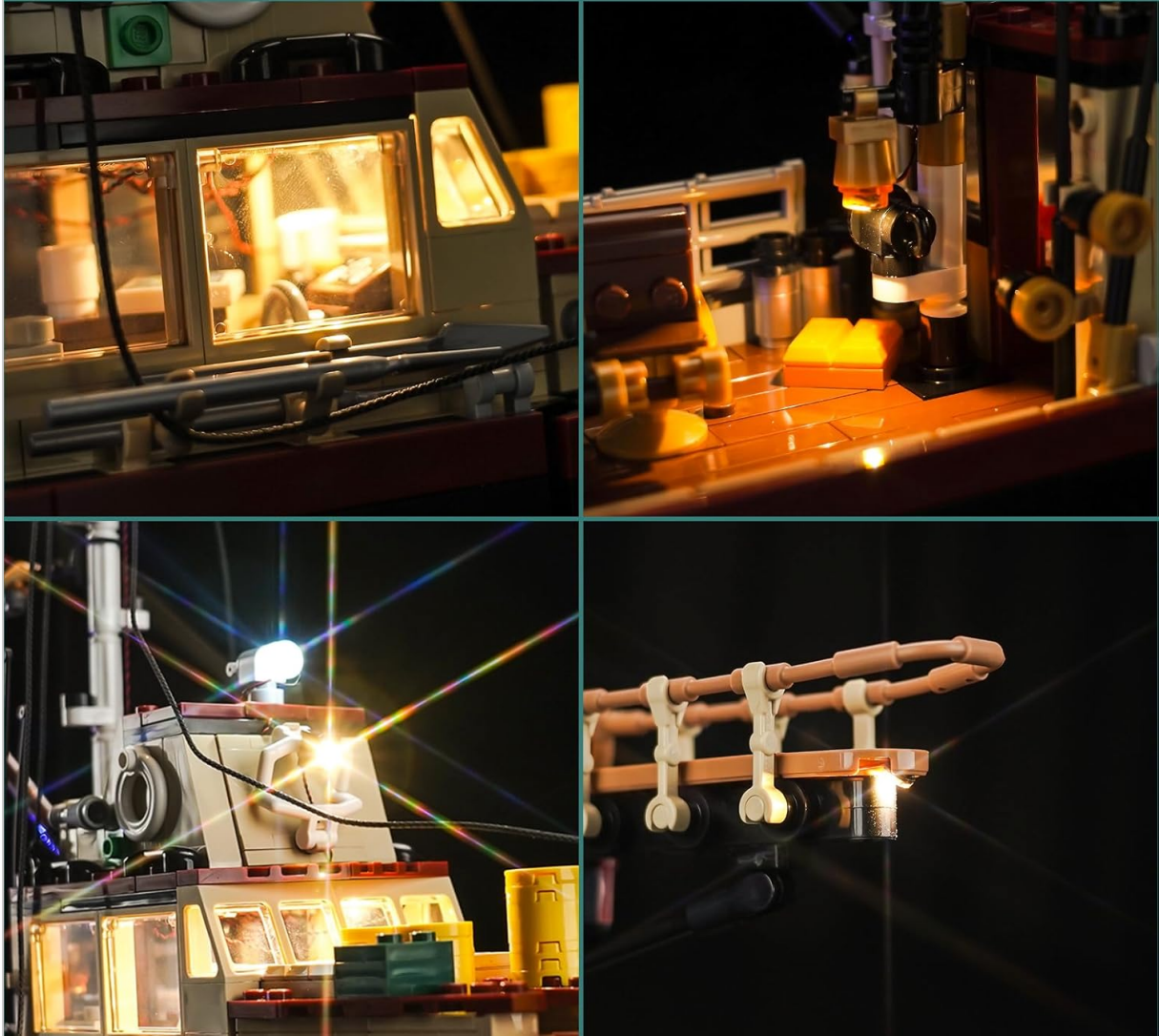
Image: Detailed views of various sections of the LEGO Jaws model, highlighting the specific areas illuminated by the LED lights, such as the cabin interior and exterior fixtures.