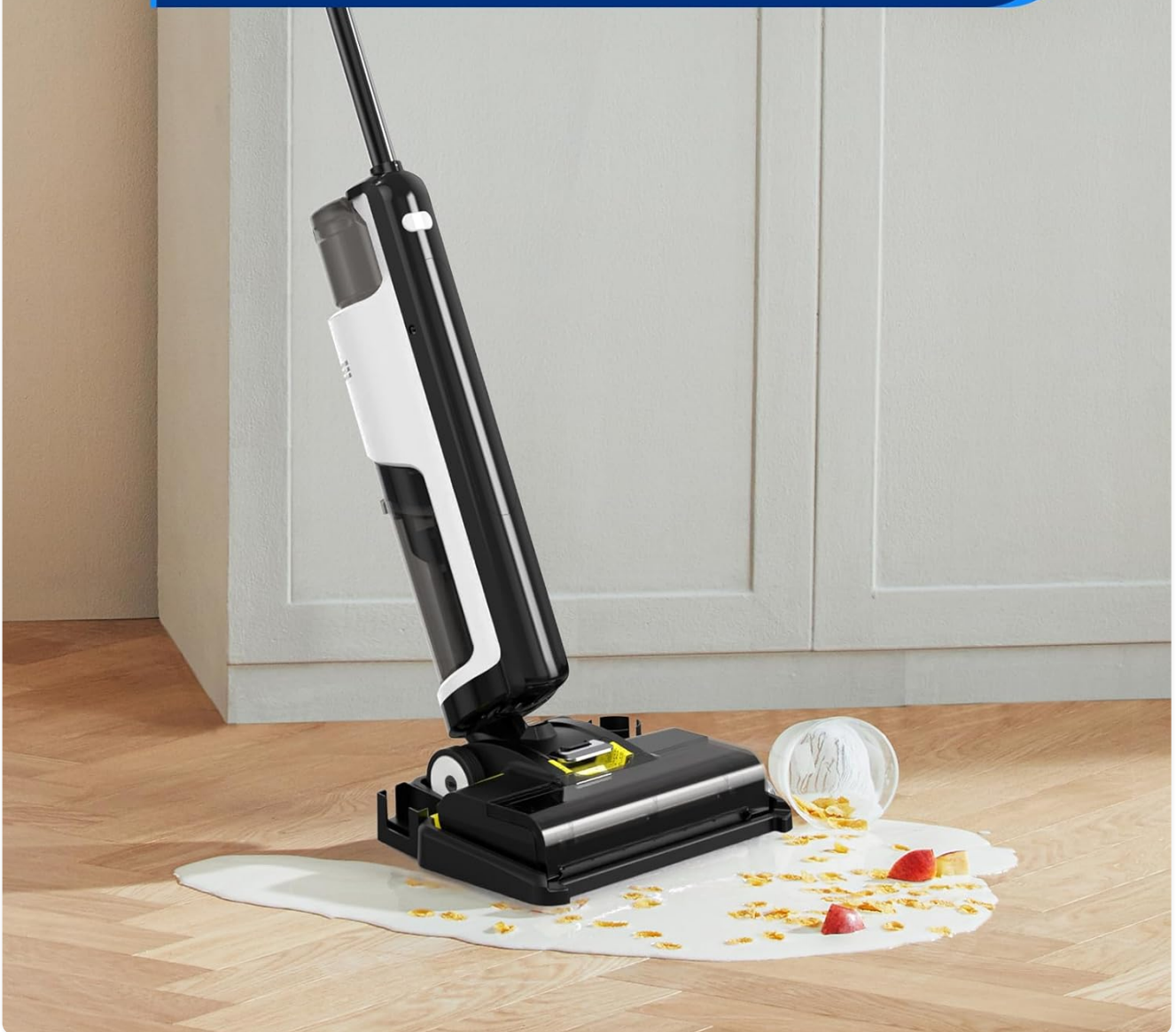
Image Description: The Redkey W12SE in action, cleaning a kitchen floor with spilled liquid and cereal. This image demonstrates its ability to vacuum and wash simultaneously.