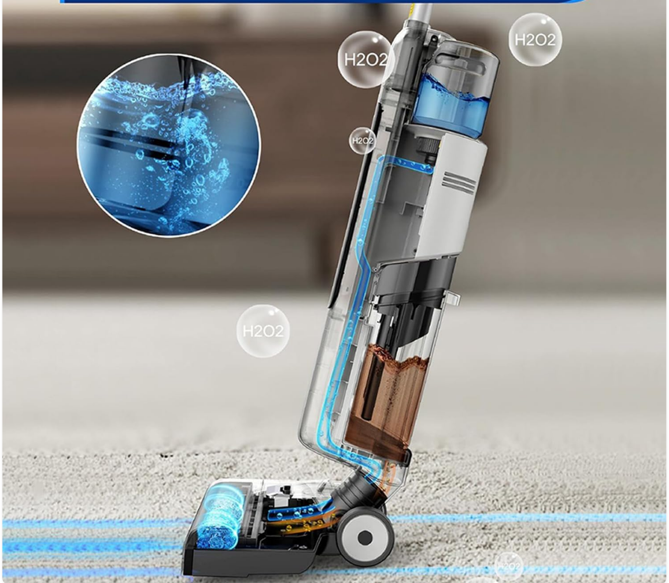
Image Description: A cutaway diagram of the Redkey W12SE illustrating the electrolytic disinfection process. Water from the clean tank passes through an electrolysis unit, generating H 2 O 2 (hydrogen peroxide) for 99.9% effective sterilization during cleaning. When activated, the appliance rapidly produces disinfected water, ensuring a high rate of germ reduction during cleaning. This feature helps maintain a hygienic environment.