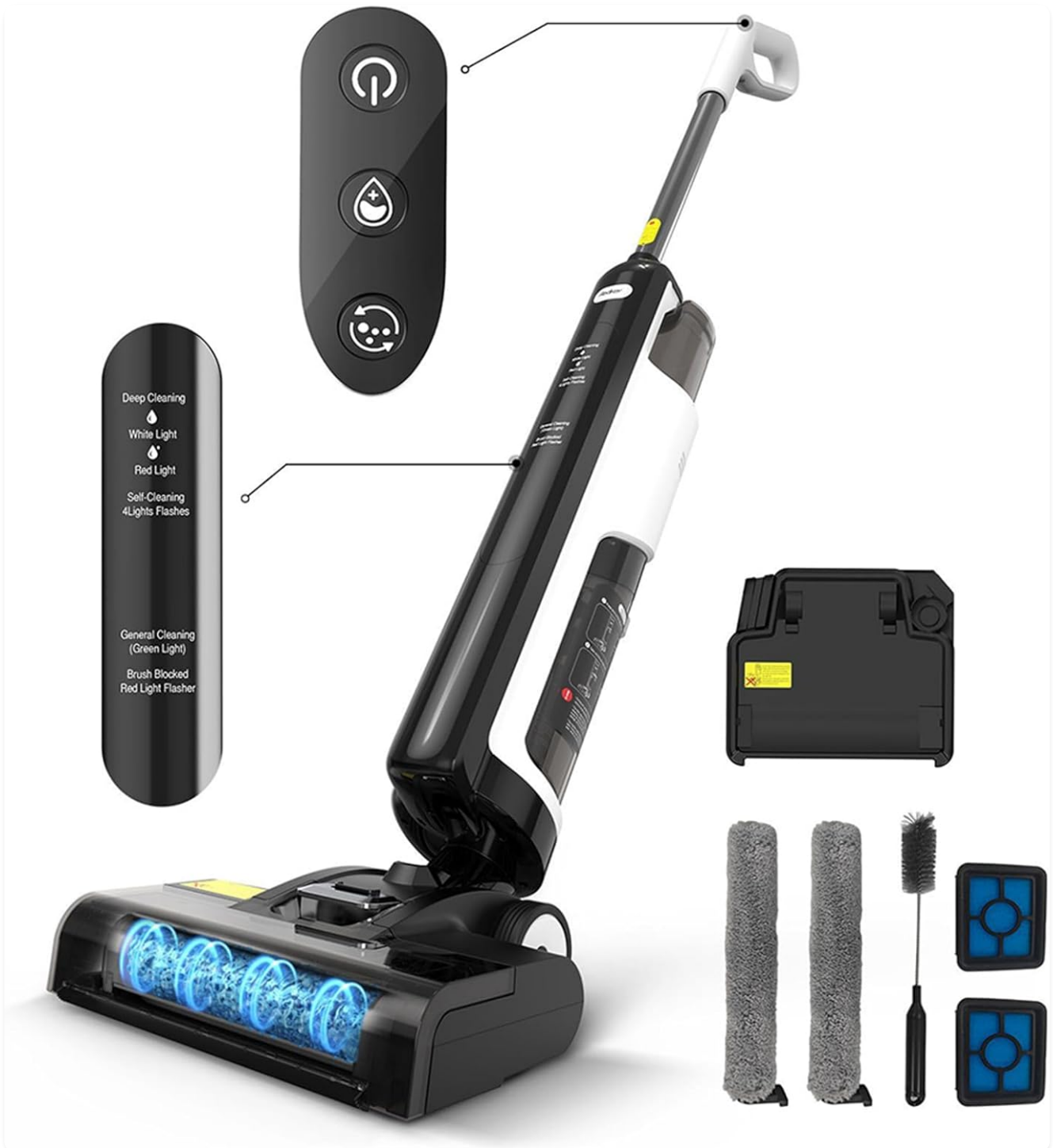
Image Description: A detailed diagram of the Redkey W12SE vacuum cleaner, highlighting its main parts: the handle with control buttons (power, water spray, self-clean), the clean water tank, the dirty water tank, and the brush head with visible roller brushes. Indicators for deep cleaning and general cleaning are also shown.

Familiarize yourself with the components of your Redkey W12SE.