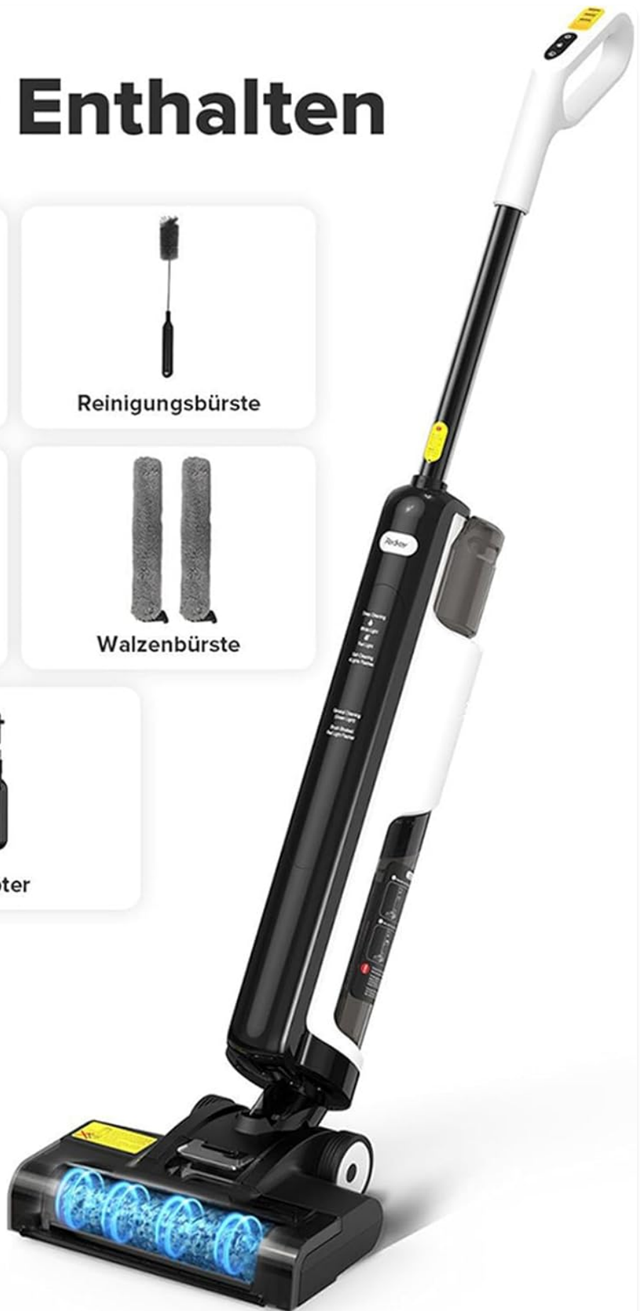
Image Description: An overhead view displaying the Redkey W12SE wet dry vacuum cleaner along with its accessories. These include the main vacuum unit, a charging base, two replacement HEPA filters, a cleaning brush, two roller brushes, and a power adapter.