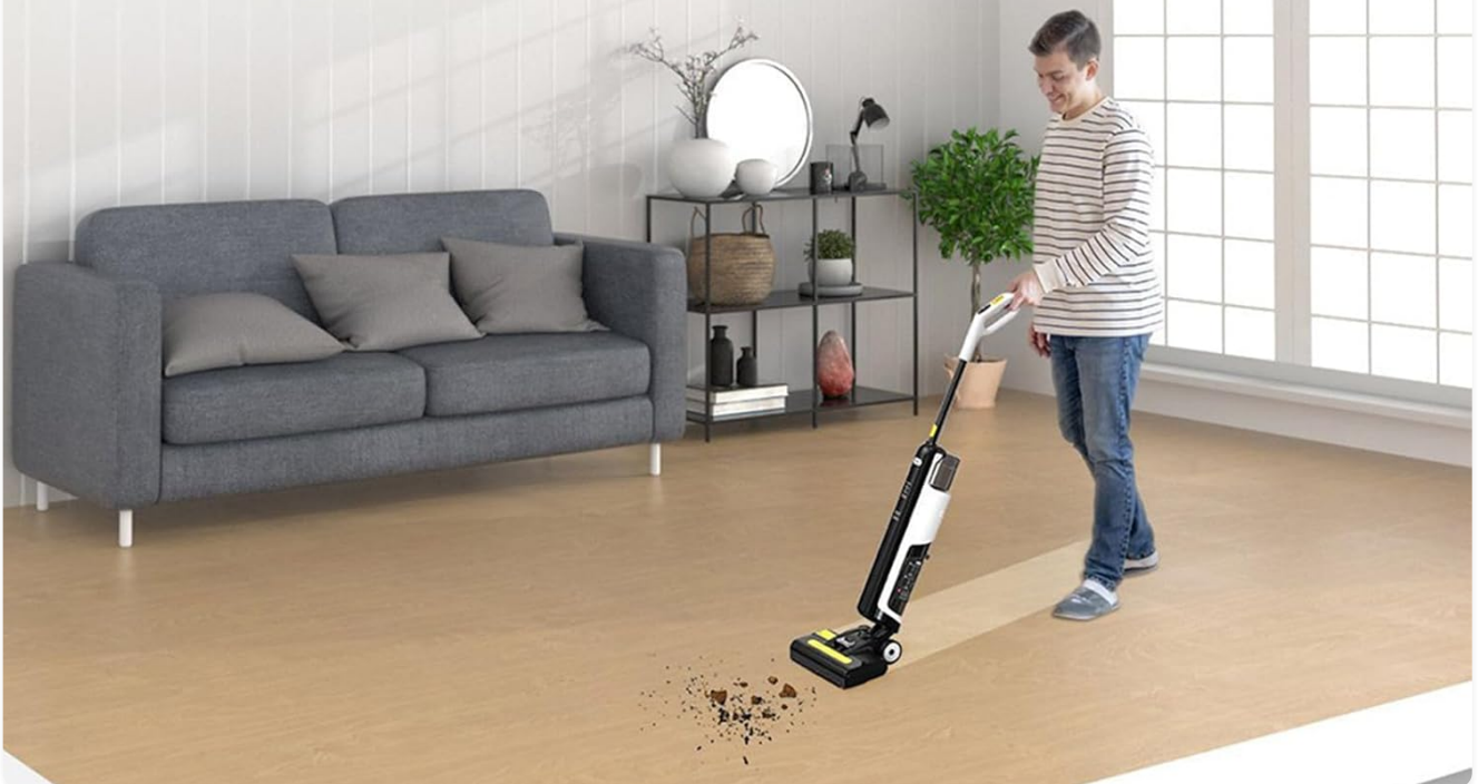
Image Description: A person is shown operating the Redkey W12SE in a modern living room, demonstrating its cordless operation and ease of use for cleaning large areas. The image also highlights the 2600mAh battery capacity and 45-minute runtime.