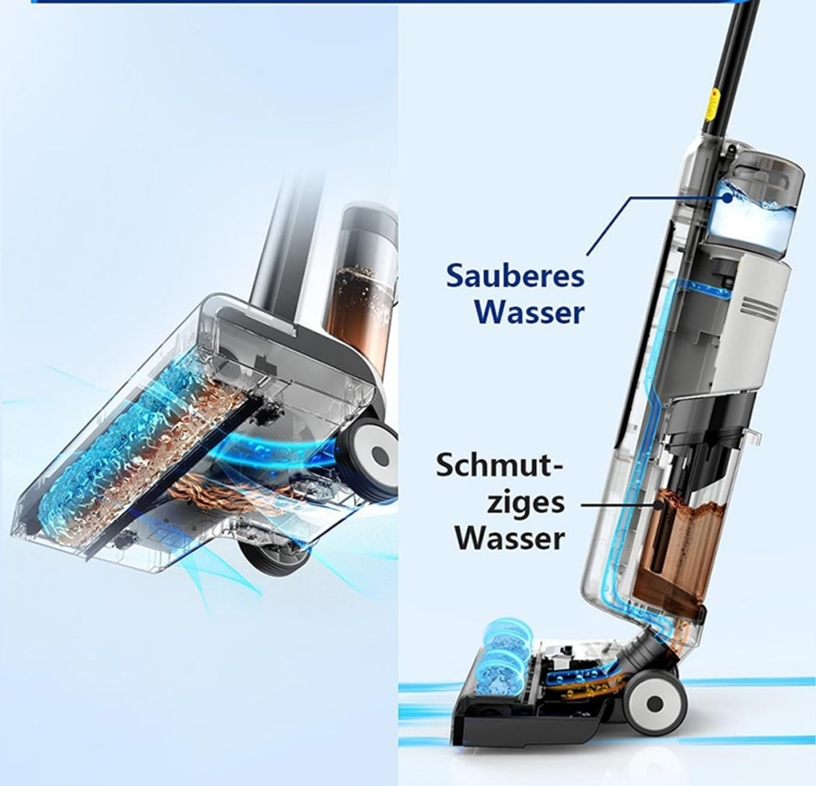
Image Description: A transparent view of the Redkey W12SE, clearly showing the upper clean water tank (600ml) and the lower dirty water tank (550ml), illustrating the separation of water.