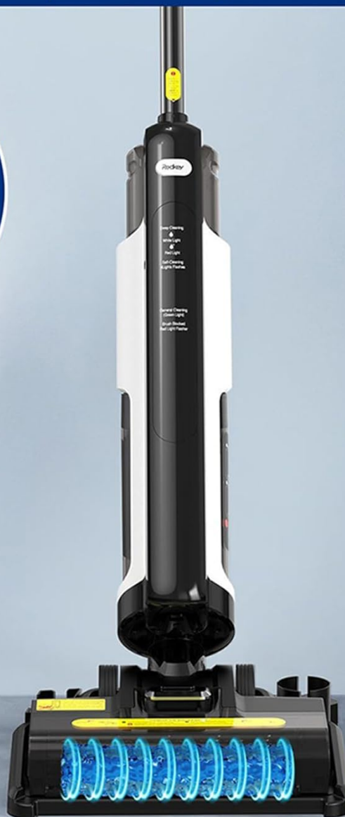
Image Description: The Redkey W12SE positioned on its charging base, with an animated representation of water flowing through the brush head, indicating the automatic self-cleaning cycle. The control panel shows the self-cleaning indicator.