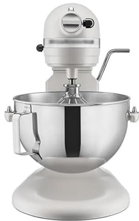
5 Plus Professional 5 Plus Series