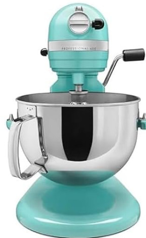
6 Qt Professional 600 Series