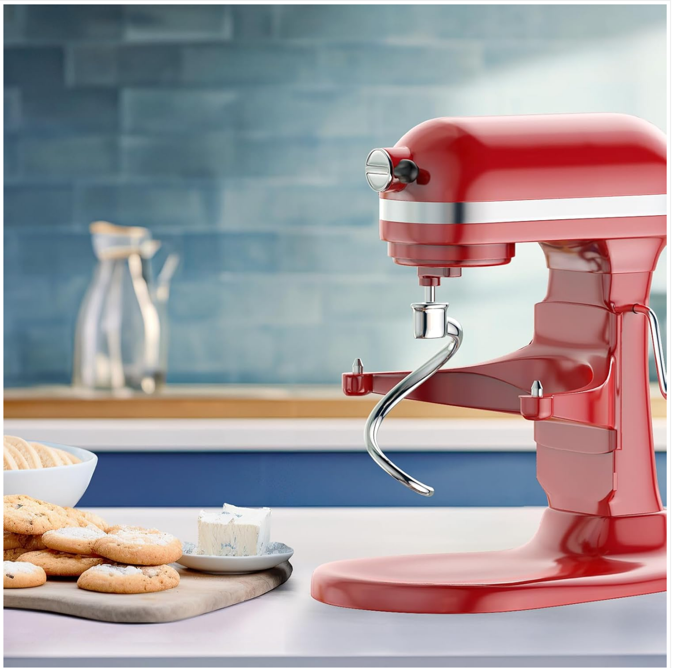
Image: A red KitchenAid stand mixer with the spiral dough hook attached, positioned on a kitchen counter with cookies and baking ingredients, demonstrating its use in a baking environment.