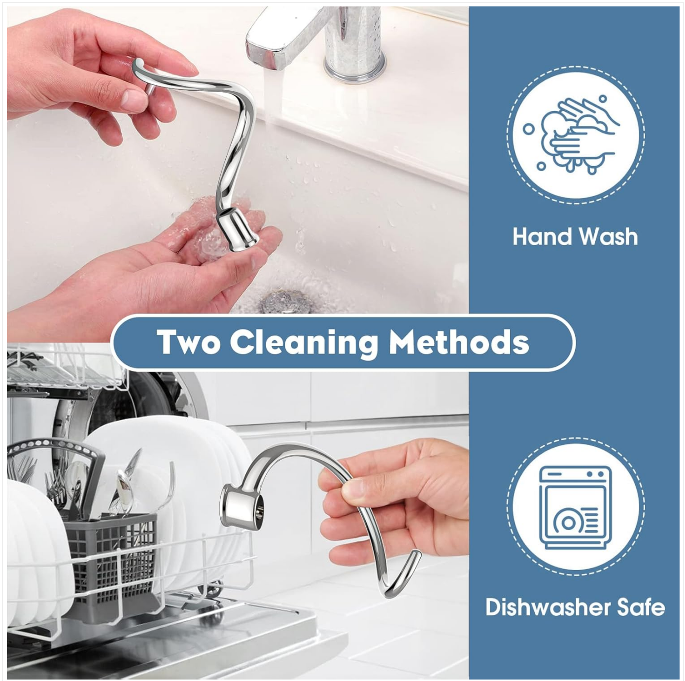
Image: A split image demonstrating two cleaning methods: one showing hands washing the dough hook under running water, and the other showing the dough hook placed in a dishwasher rack.