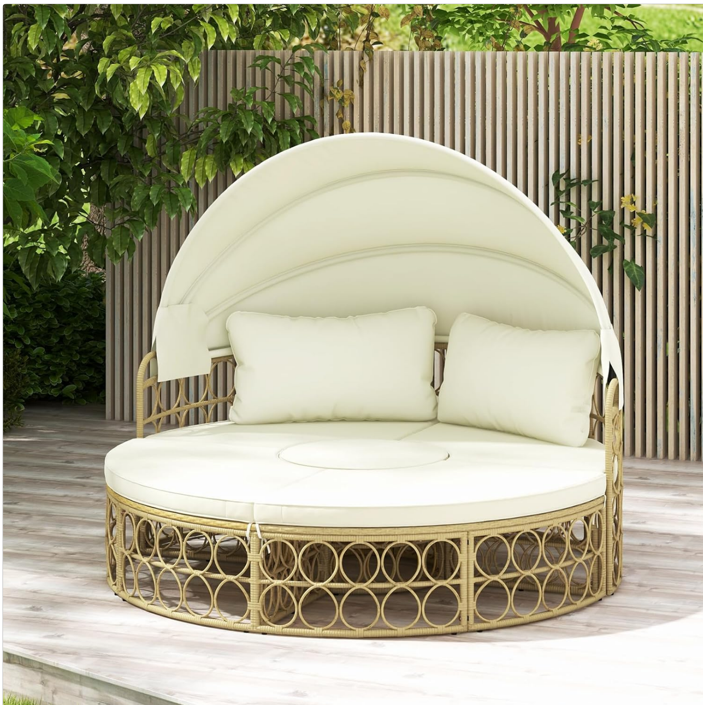
Image 1: Fully assembled RELAX4LIFE Round Outdoor Daybed with Canopy. This image shows the complete daybed with cushions and canopy extended, ready for use.