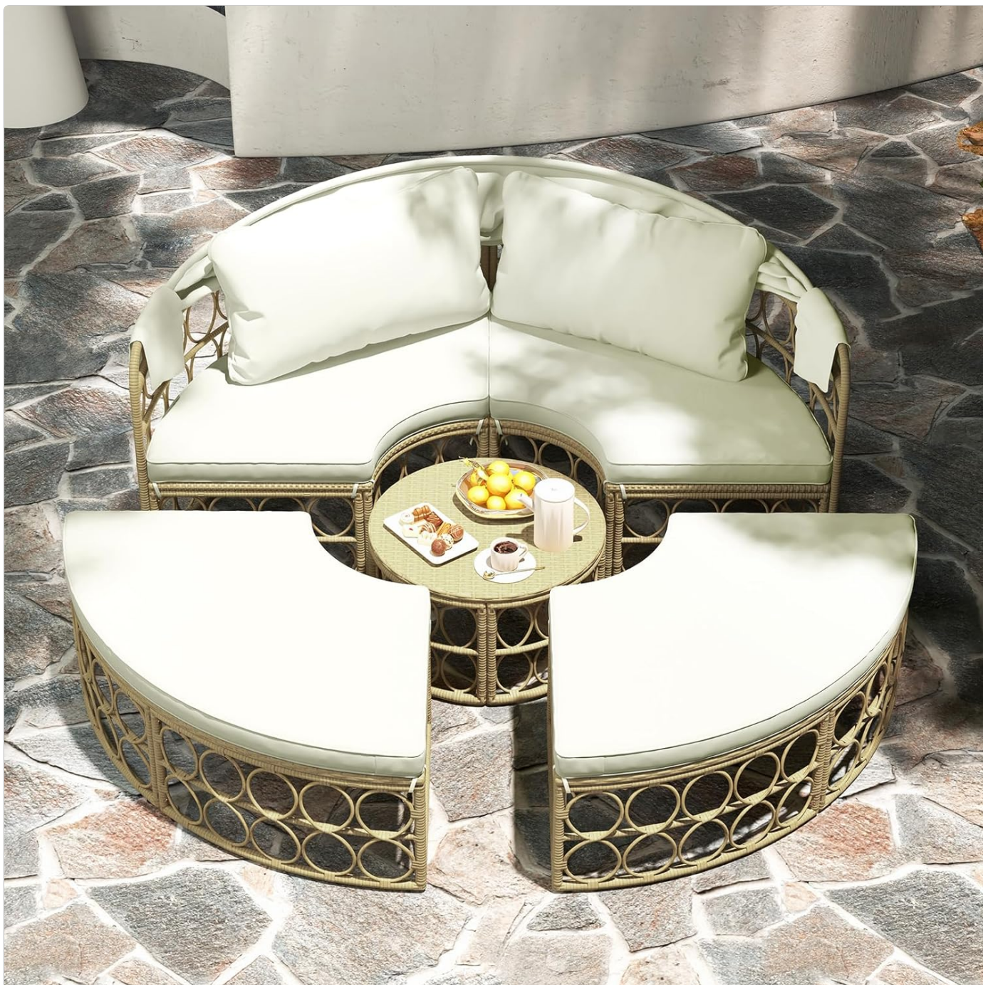
Image 3: The daybed reconfigured into a conversation set. This image demonstrates the modularity, showing the central ottoman used as a table and the other sections arranged for seating.