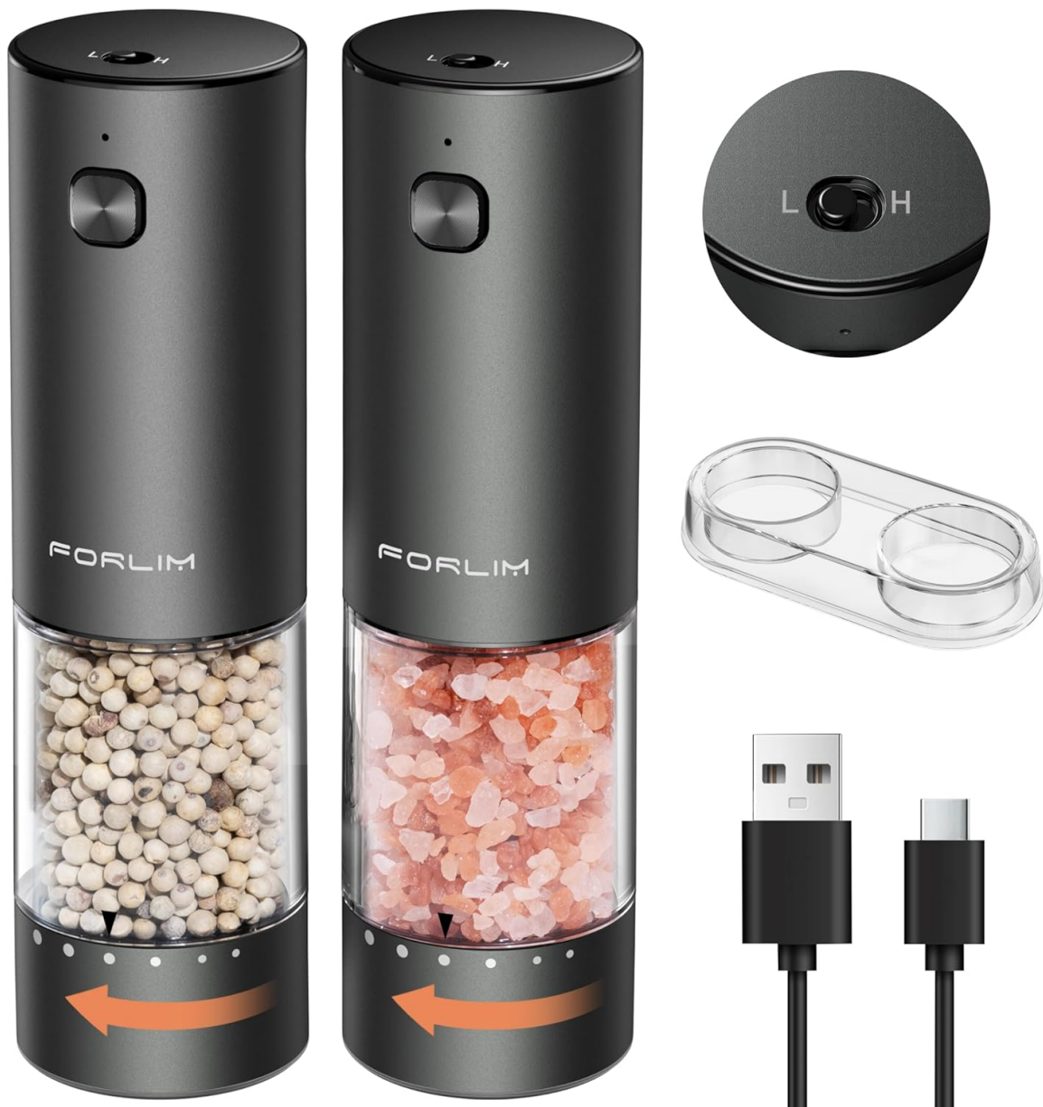
Figure 1: The FORLIM 2-Speed Electric Salt and Pepper Grinder Set, including two grinders, a transparent base, and USB-C charging cables.