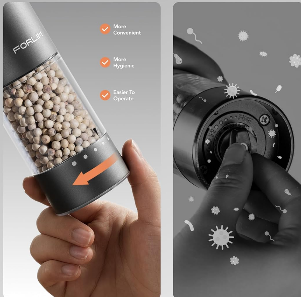
Figure 5: Adjusting the external coarseness of the grinder.