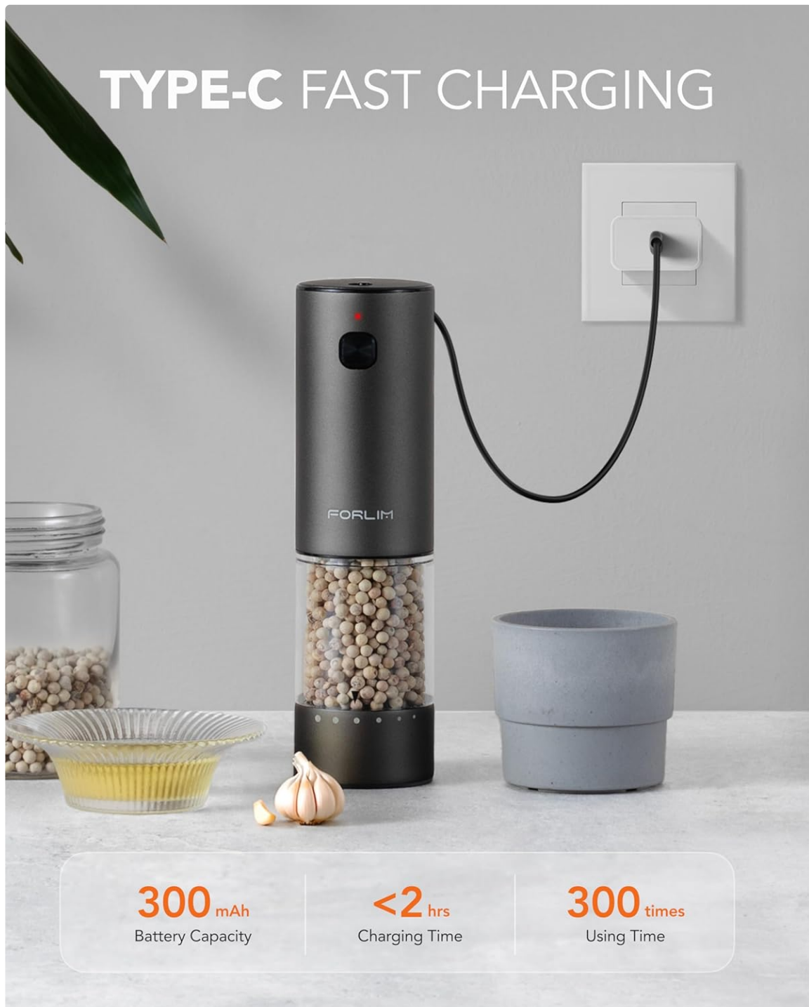
Figure 3: Charging the FORLIM electric grinder via USB-C.