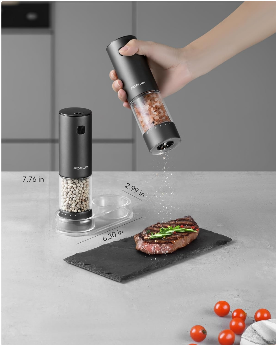
Figure 8: Product dimensions and usage example.