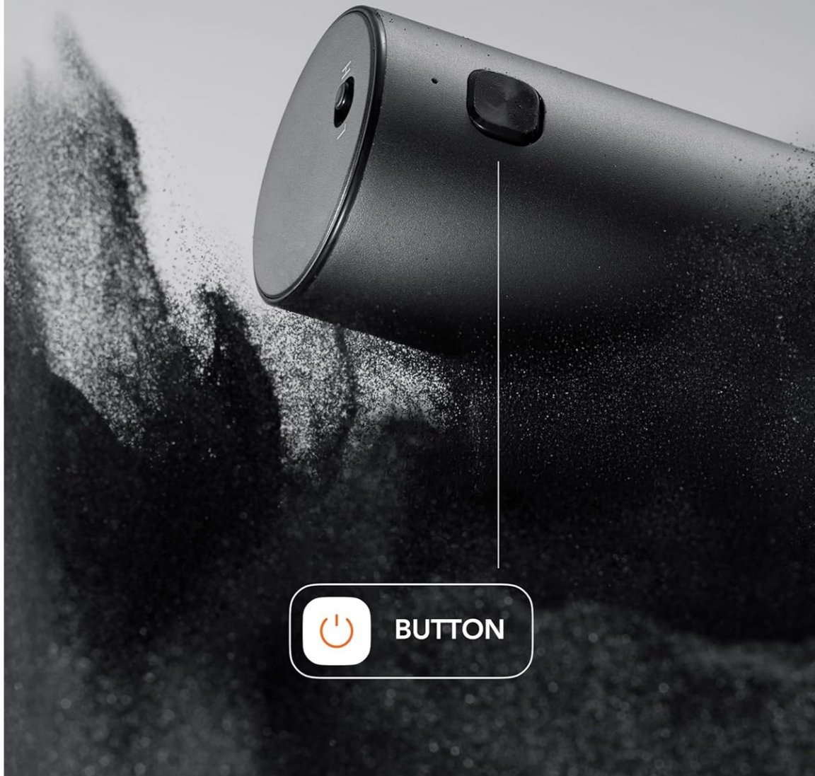
Figure 4: The power button on the FORLIM electric grinder.

Aluminum Alloy Material, Lightweight and Upscale