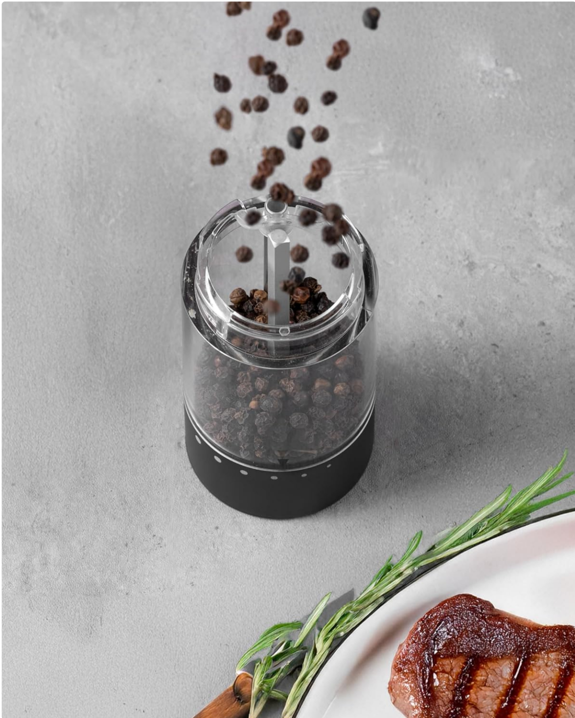
Figure 2: Filling the grinder with spices using the provided funnel.