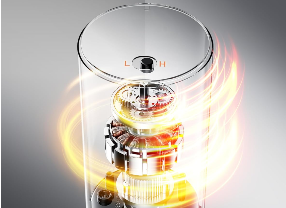
Figure 6: Dual-speed settings for optimal grinding control.