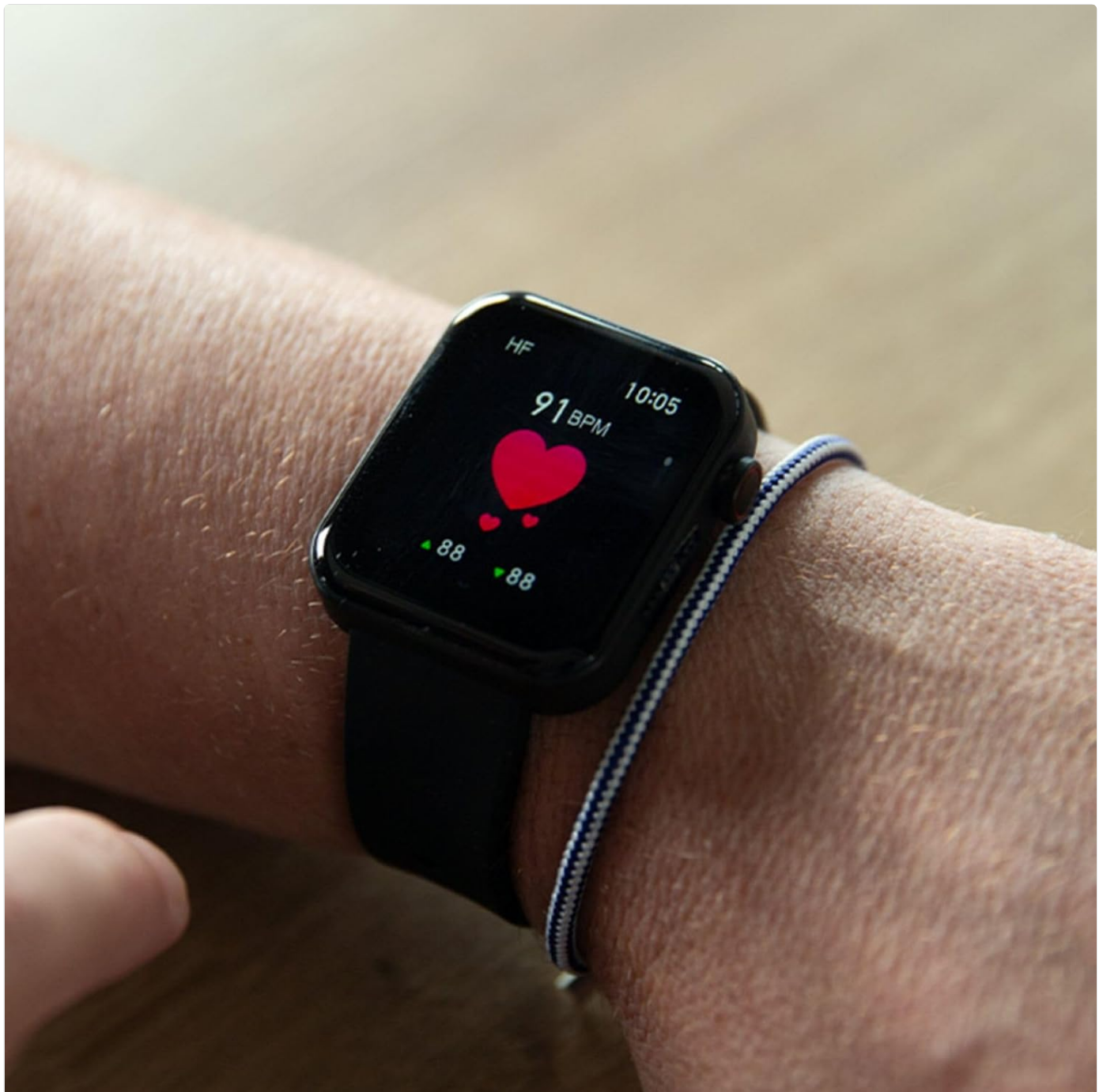
Image: A close-up of the smartwatch on a wrist, showing a heart icon and a heart rate reading of 91 BPM.