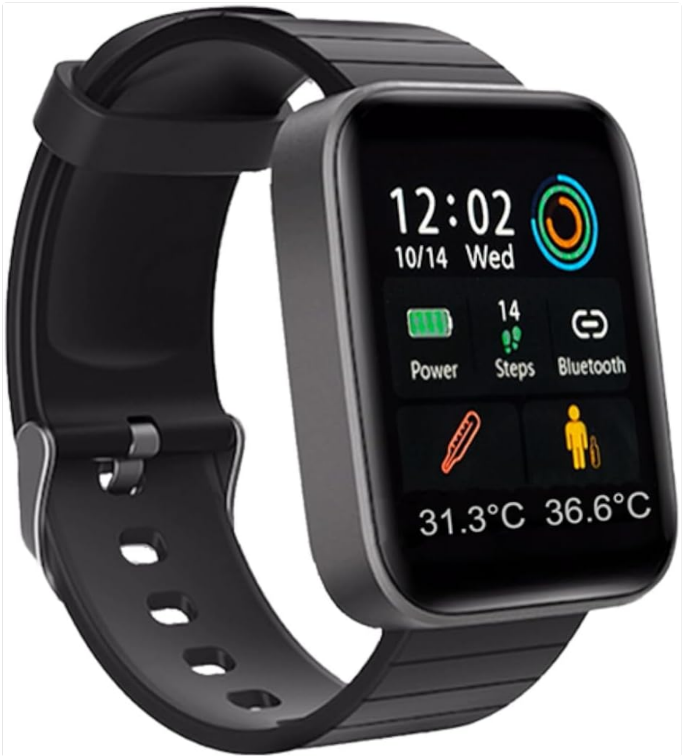
Image: The Kendox Life Tracker Smartwatch, featuring a sleek black design with a digital display showing time, date, battery, steps, and vital signs like temperature.