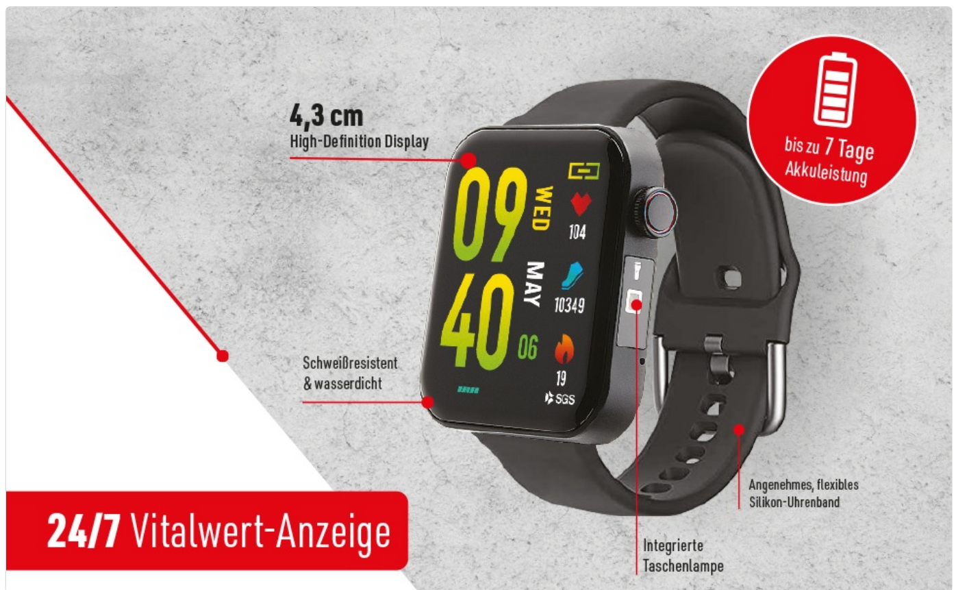
Image: An infographic highlighting key specifications such as the 4.3 cm High-Definition Display, up to 7 days battery life, sweat resistance, waterproofing, flexible silicone band, and integrated flashlight.