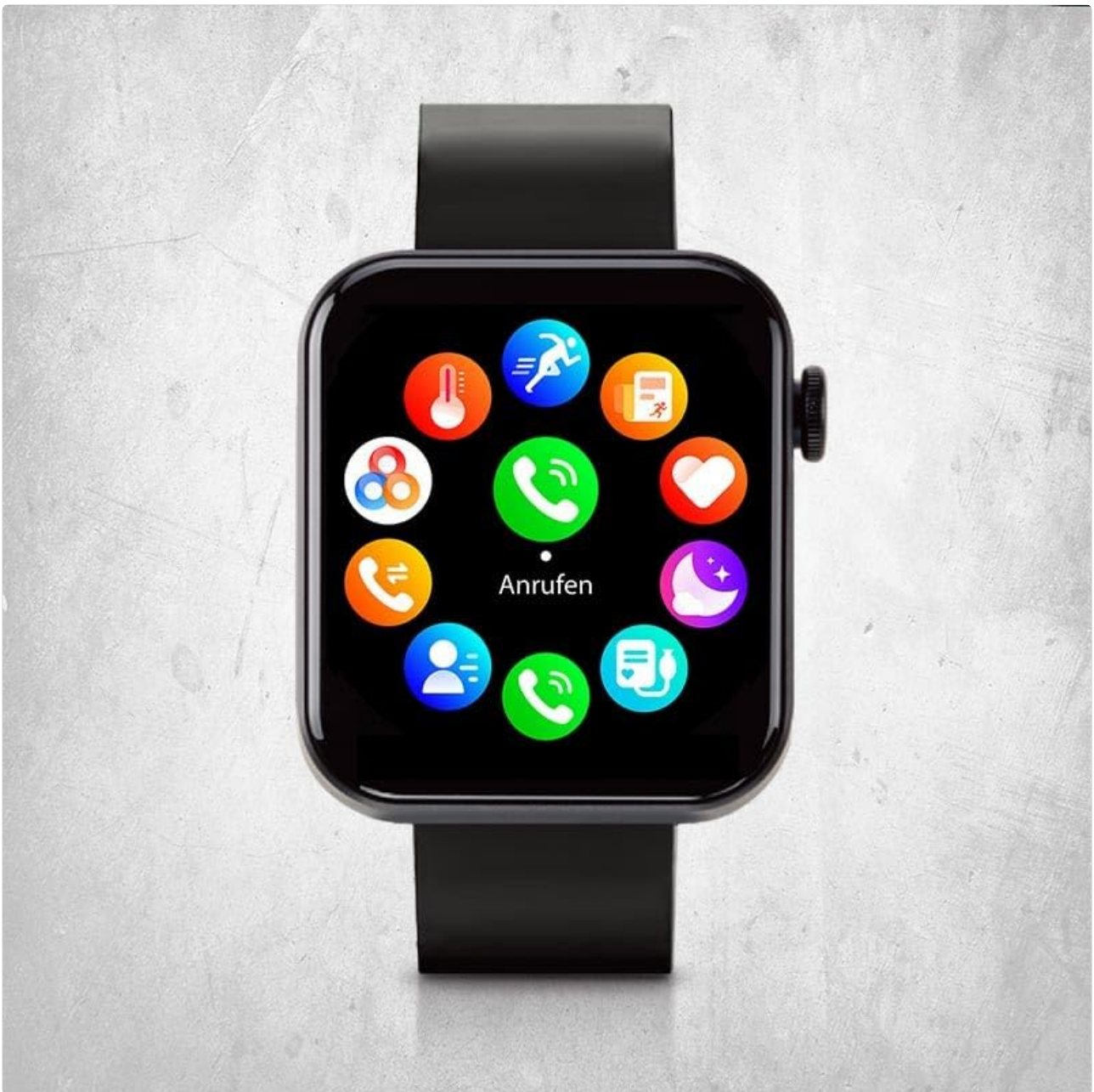
Image: The smartwatch display showing a circular menu of various app icons, including calls, messages, and health tracking.