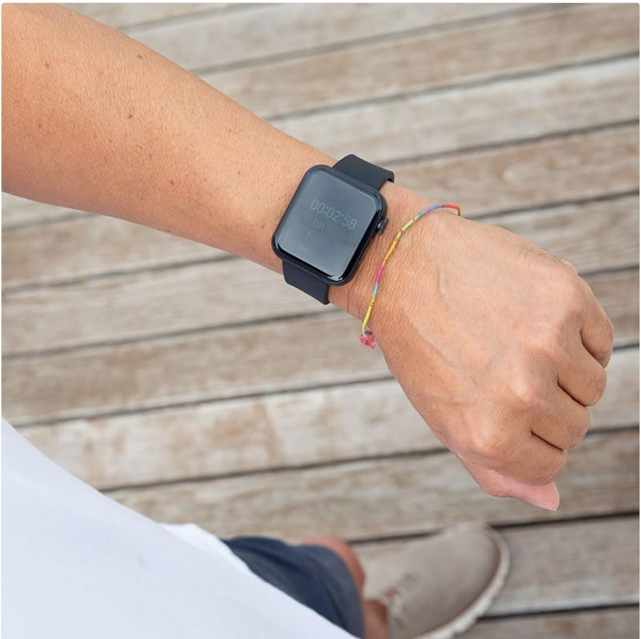
Image: The smartwatch on a person's wrist, displaying a timer during a workout, indicating active sport mode tracking.