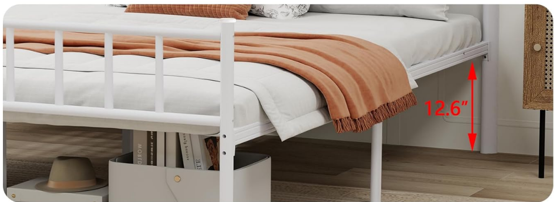
Image: This image clearly shows the 12.6-inch under-bed clearance, indicating ample space for storing various items such as boxes, bins, or luggage.

Platform bed frame leaves approximately 12.6" of space for easy storage and cleaning. Allows you to fully utilize your bedroom space and make it neater.