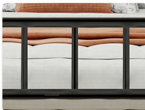
Image: A detailed view of the metal slats that form the bed base, demonstrating the robust support structure for your mattress.

Image: This image highlights the design of the headboard and footboard, which are specifically engineered to keep the mattress securely in place and prevent it from sliding.