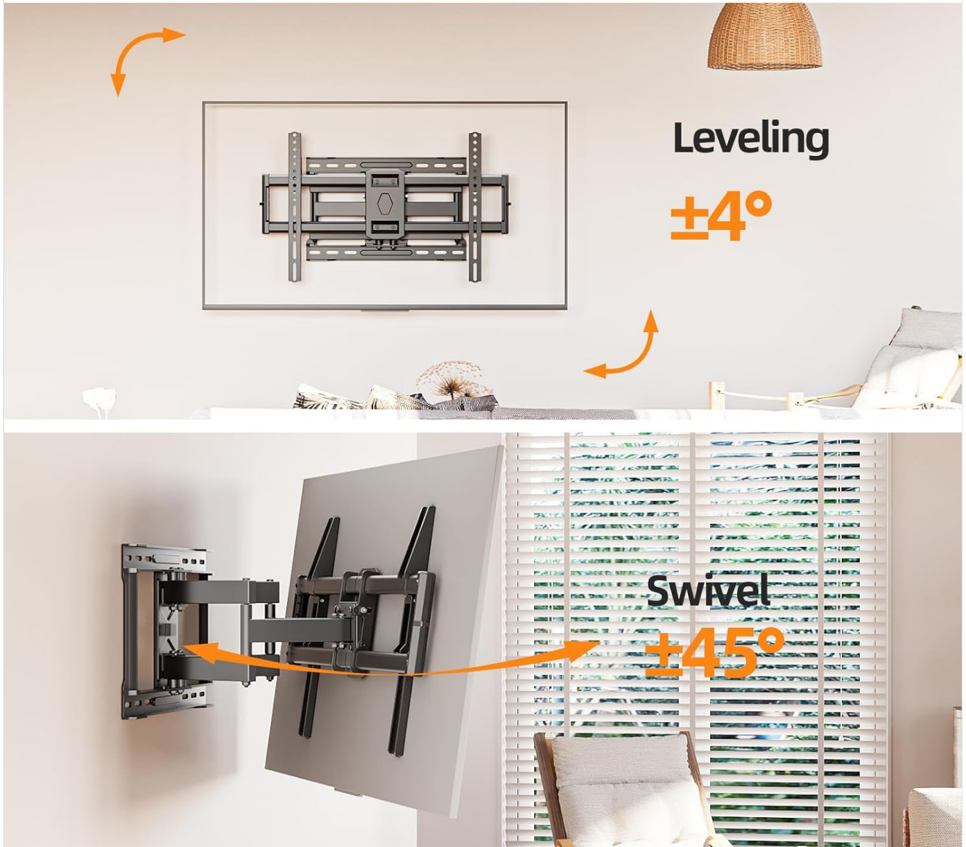
Image: Illustrates the swivel capability of the mount, allowing the TV to be angled up to 45 degrees left or right for flexible viewing.