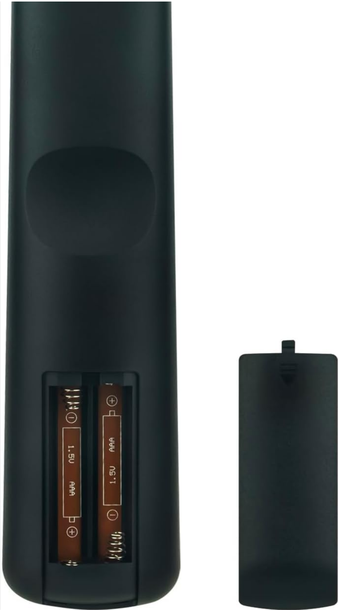
Image: Rear view of the remote control with the battery cover removed, illustrating the correct orientation for AAA battery insertion.