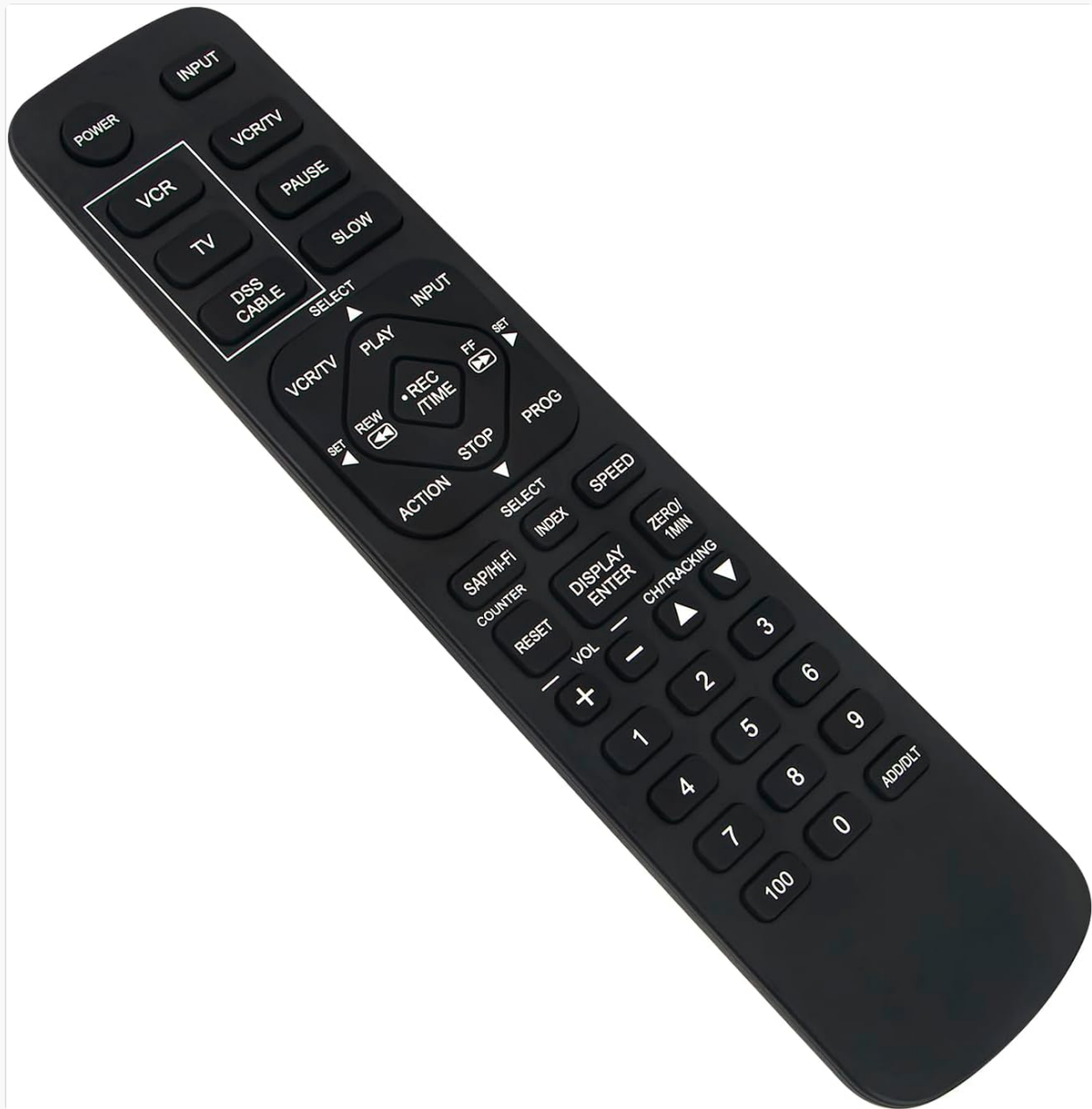
Image: Front view of the WINFLIKE VSQS1559 remote control, highlighting the button layout.

The VSQS1559 remote control provides all essential functions for your compatible Panasonic VCR. The ergonomic design ensures comfortable handling and easy access to all buttons.