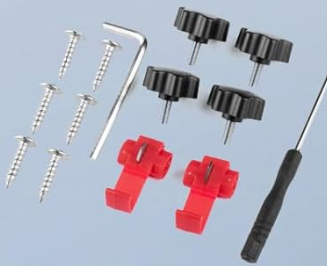
1* Screw Set