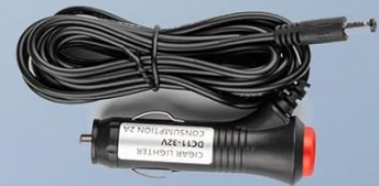
1* Cigarette Lighter Adapter

Image: This image displays all components included in the VASTEND VS-7A package: 1 Monitor, 1 Camera, 1 Sunshade, 1 U-bracket, 1 Power Cable, 1 USB Type-C Cable, 3 Antennas, 1 Instruction Manual, 1 Screw Set, and 1 Cigarette Lighter Adapter.