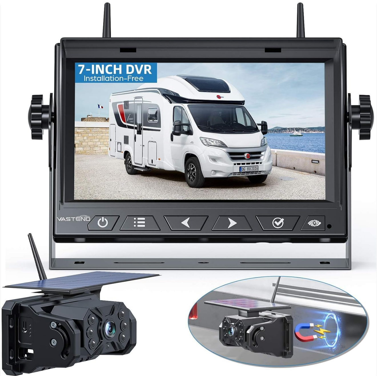
Image: The VASTEND VS-7A Wireless Solar Backup Camera System, showing the 7-inch monitor and the solar-powered magnetic camera.