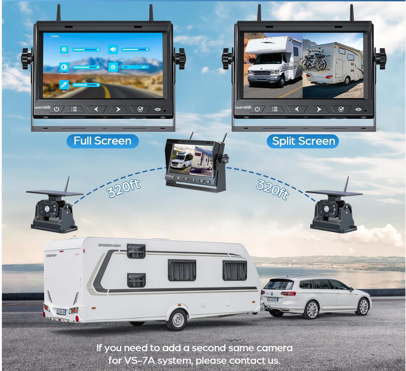
Image: This image shows the 7-inch monitor displaying both full-screen and split-screen views. It also indicates the wireless transmission range of 320ft between the camera and monitor, and suggests contacting support for adding a second camera.