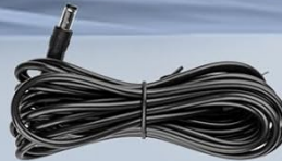
1* Power Cable