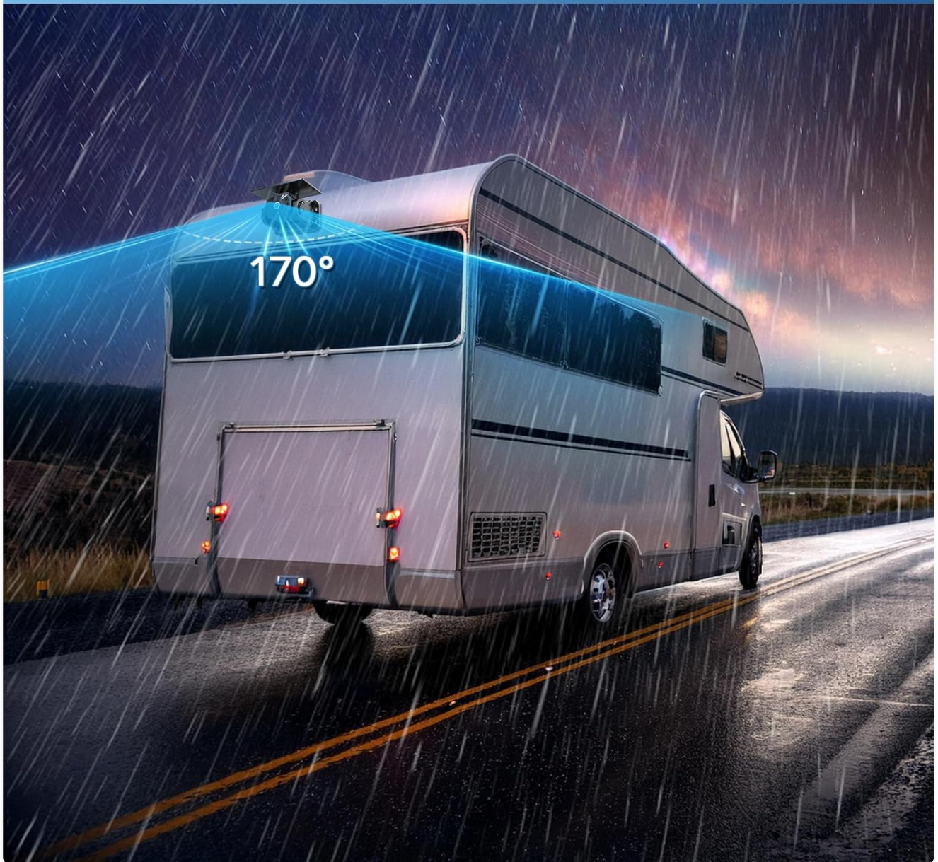
Image: This image depicts the VASTEND VS-7A camera mounted on the rear of an RV in rainy conditions, highlighting its IP69 waterproof rating and 170-degree wide-angle view. Infrared LEDs are visible, indicating night vision capability. Additionally, it is equipped with infrared night vision LEDs that provide clear images even in complete darkness, ensuring safety during nighttime maneuvers.