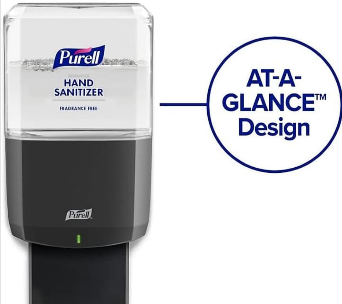
Figure 2: Dispenser and compatible refill (sold separately).