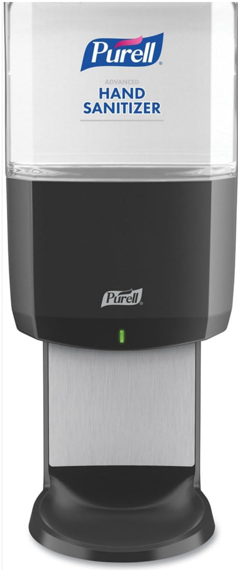
Figure 4: Factory-sealed nozzle for hygienic dispensing.