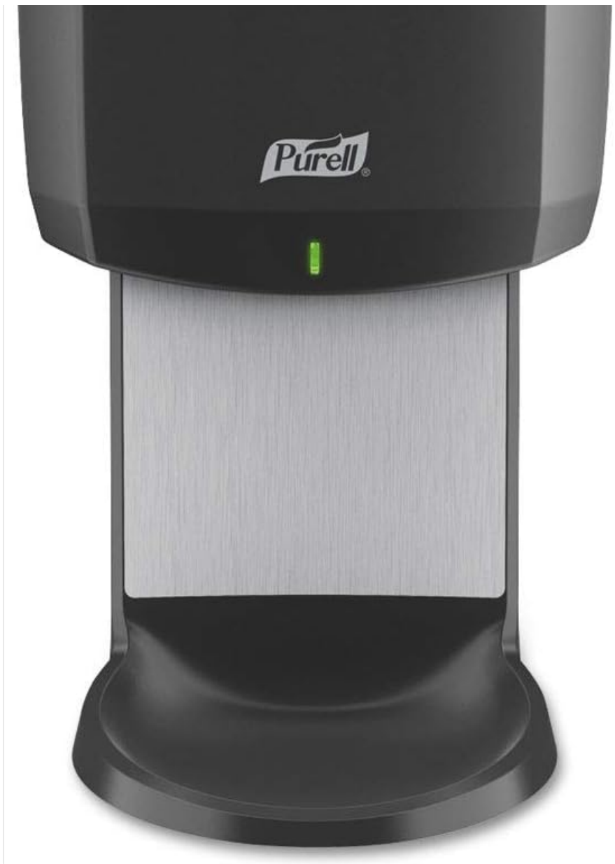
Figure 1: PURELL ES6 Automatic Hand Sanitizer Dispenser, Graphite.