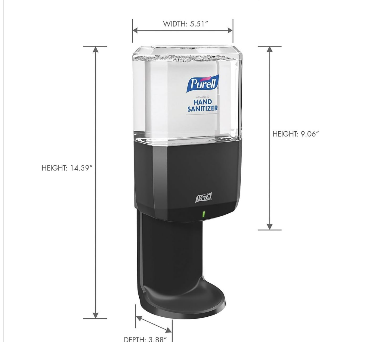
Figure 3: Matching the ES6 refill to the dispenser.