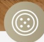
Single Wall Baskets