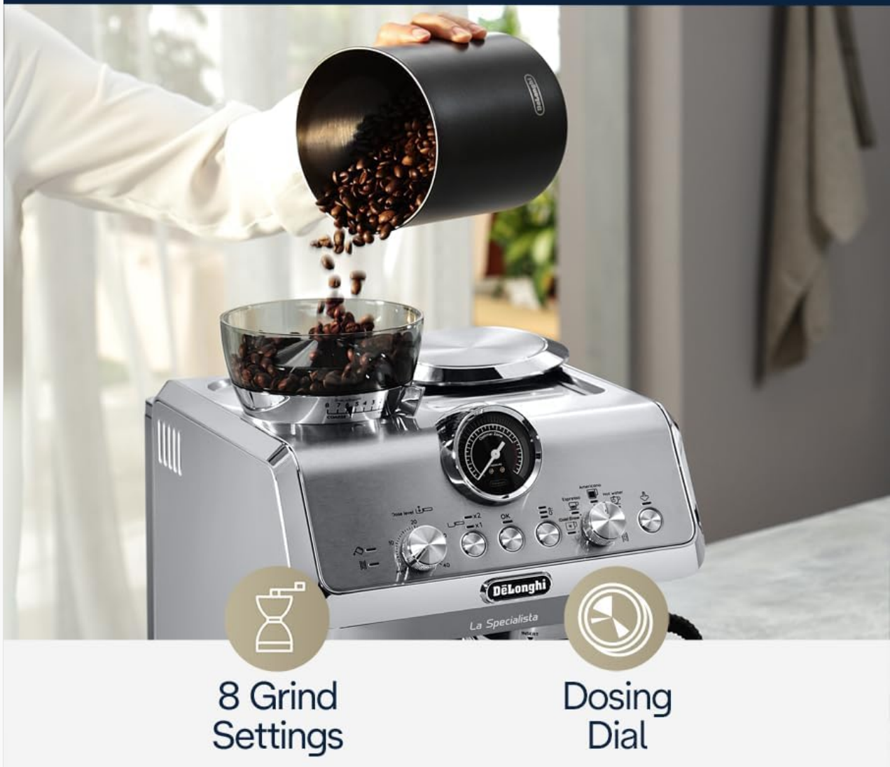
Image 3.1: The integrated conical burr grinder, featuring 8 grind settings and a dosing dial for precise coffee preparation.