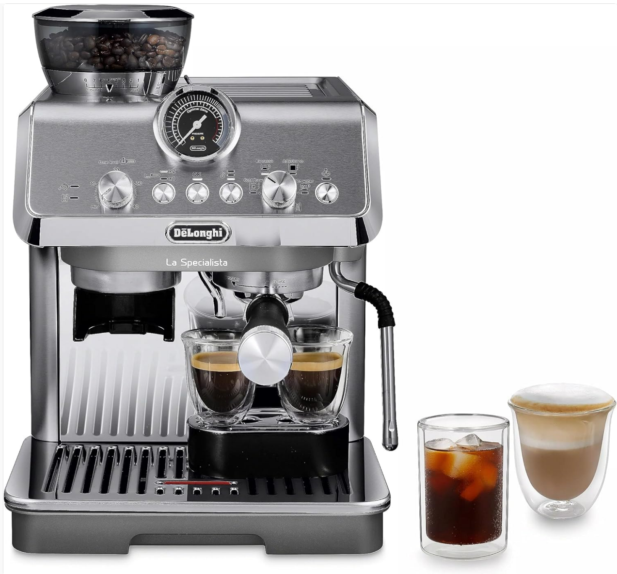
Image 1.1: The De'Longhi La Specialista Arte Evo EC9255M Espresso Machine, showcasing its sleek design and capabilities for hot and cold beverages.