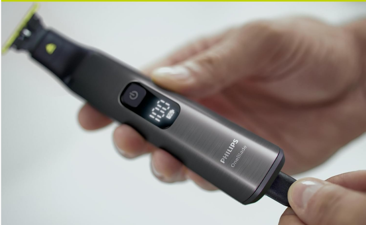
Image 4.1: Connecting the Philips OneBlade Pro 360 to its charging cable. The LED display shows battery percentage.