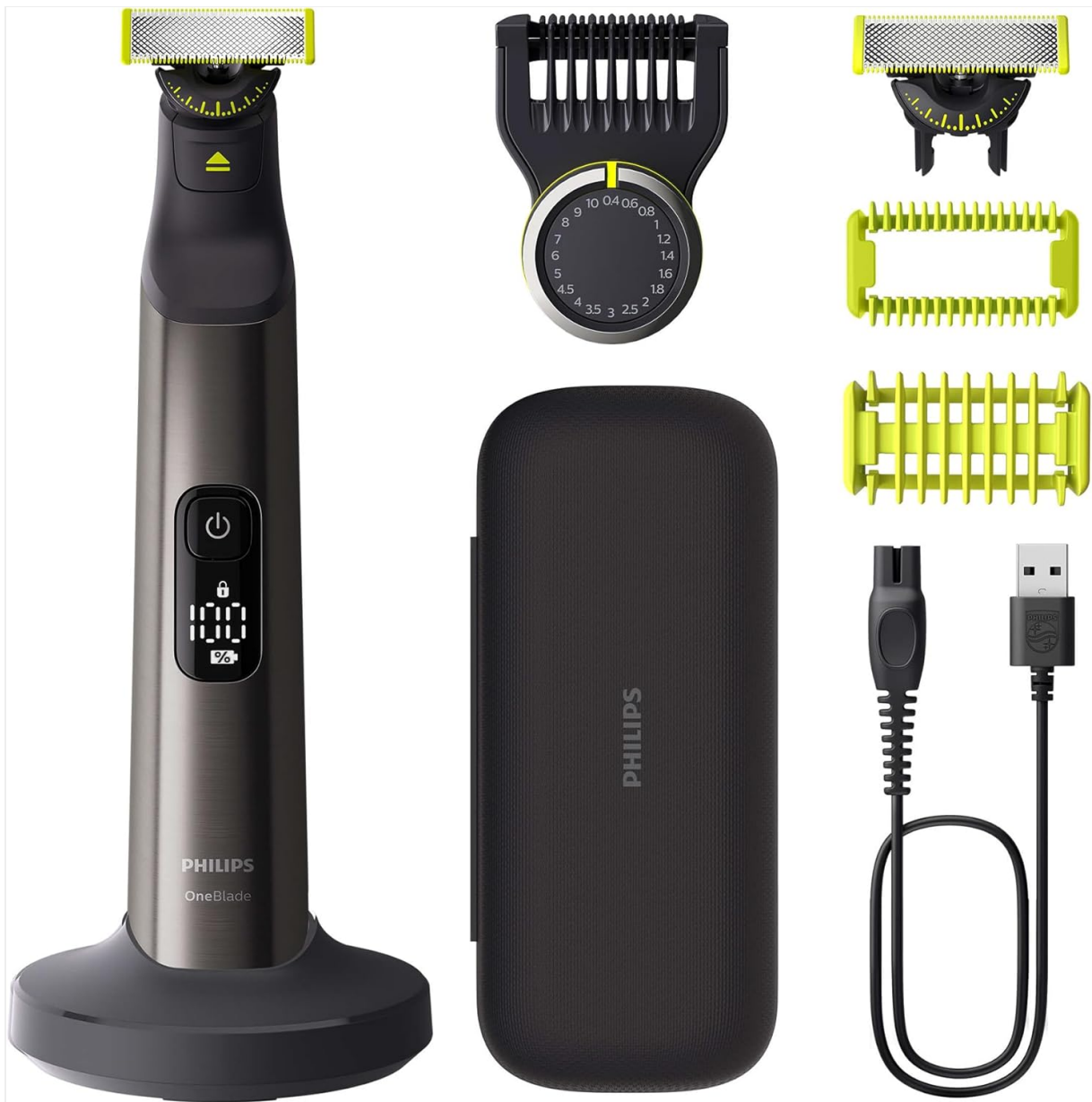
Image 1.1: Philips OneBlade Pro 360 Face + Body with its complete set of accessories, including the device, blades, combs, charging stand, and travel case.