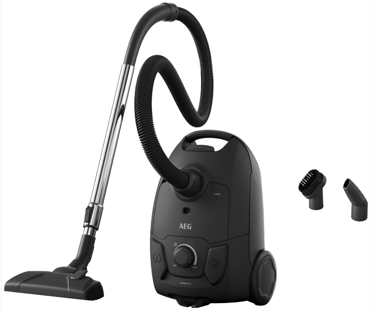
Figure 2.1: The AEG AB31C1GG vacuum cleaner with its main components including the flexible hose, telescopic tube, floor nozzle, and additional cleaning tools.