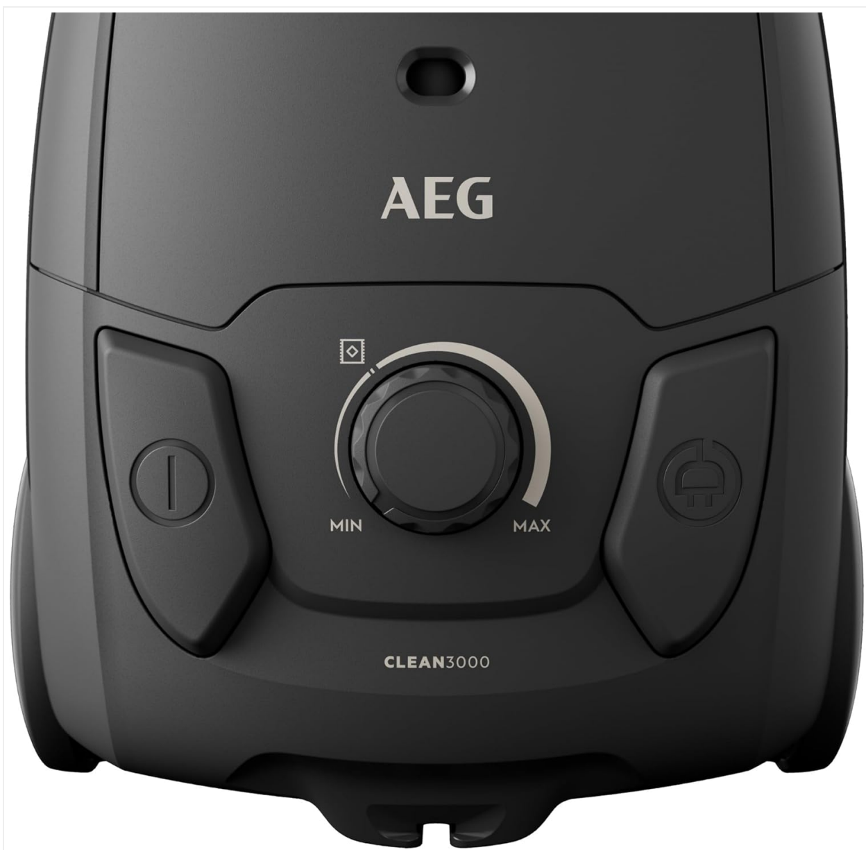
Figure 2.2: Detailed view of the control panel, showing the power button, cord rewind button, and the rotary dial for adjusting suction power from minimum (MIN) to maximum (MAX).