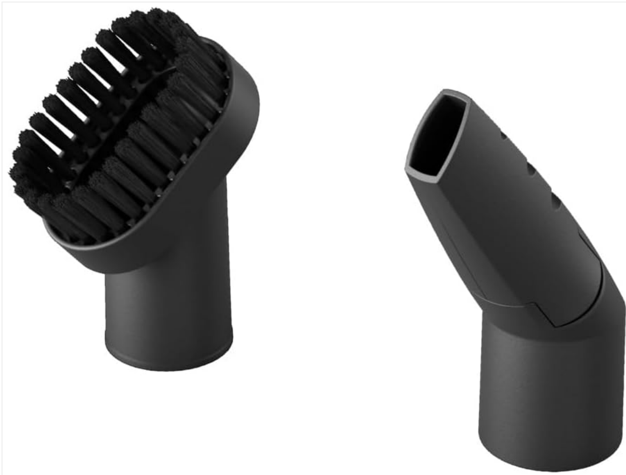
Figure 2.3: The included crevice tool (right) for narrow spaces and the brush tool (left) for delicate surfaces or upholstery.