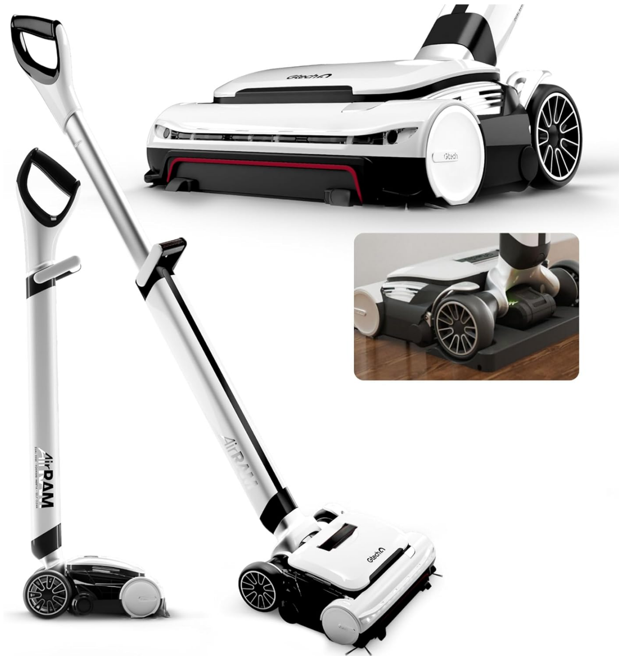
Figure 1: Gtech AirRAM 3 main components.

Carefully remove all components from the packaging. The Gtech AirRAM 3 is designed for simple assembly, typically involving connecting a few main parts. Ensure all packaging materials are removed before use.