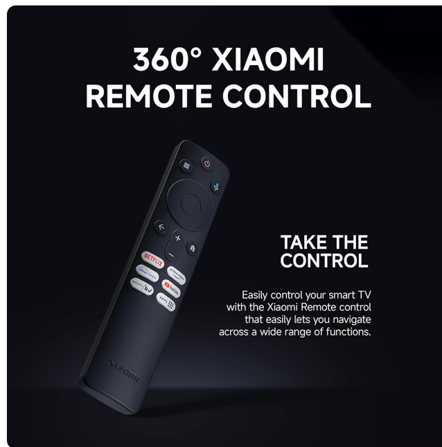
Image 3.1: Close-up of the Xiaomi 360 Remote Control, showing its ergonomic design and dedicated buttons for streaming services and Google Assistant.