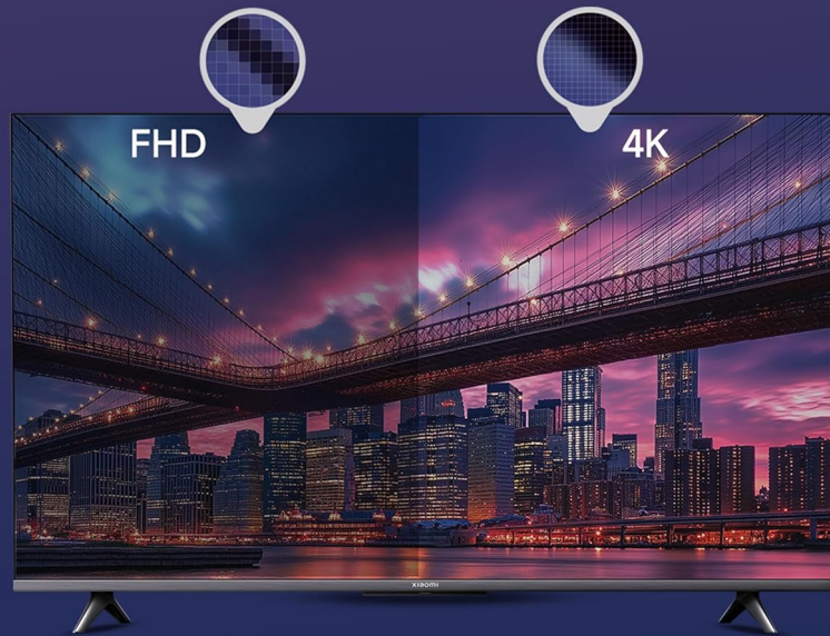
Image 3.5: Comparison image demonstrating the crystal-clear clarity of 4K resolution versus Full HD on the Xiaomi TV.