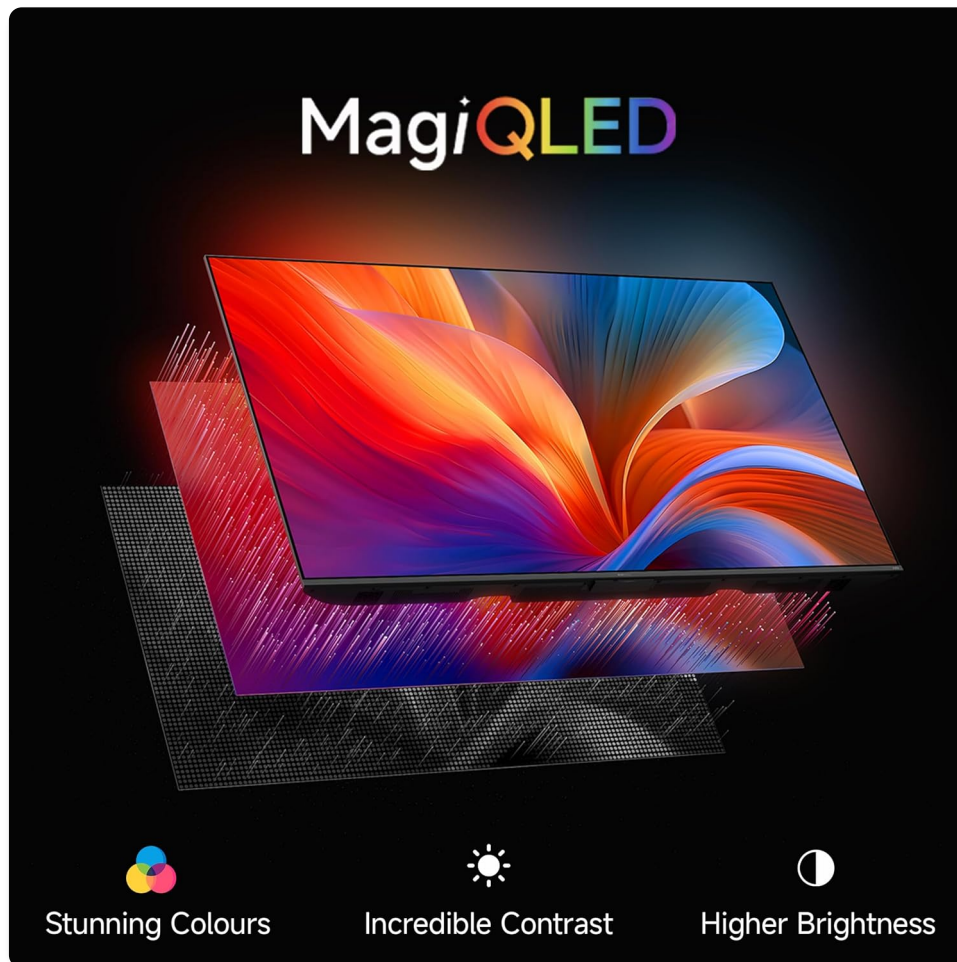
Image 3.4: Visual representation of MagiQLED technology, illustrating stunning colors, incredible contrast, and higher brightness.