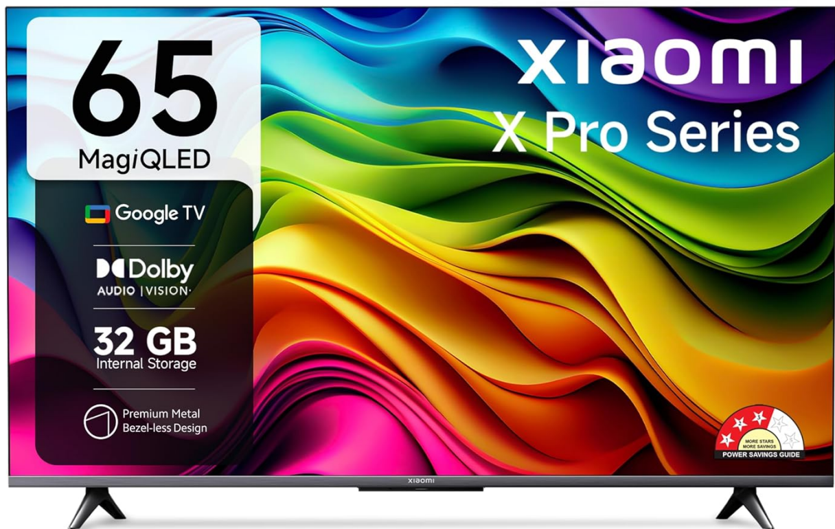
Image 1.1: Front view of the MI Xiaomi X Pro QLED Series Smart Google TV, highlighting its 65-inch screen, Google TV interface, Dolby Audio/Vision, and 32GB internal storage.