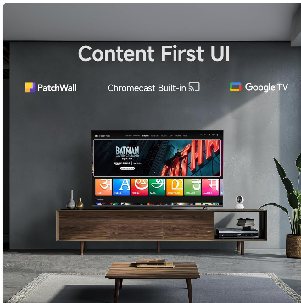
Image 3.2: Screenshot of the Xiaomi TV's Content First UI, showcasing various streaming apps and content categories.