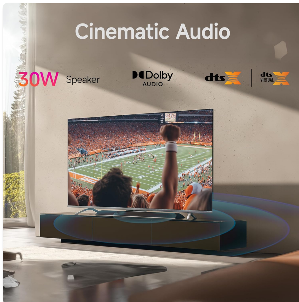
Image 3.6: Scene depicting the cinematic audio experience with the Xiaomi TV, highlighting the 30W speakers and Dolby Audio/DTS support.