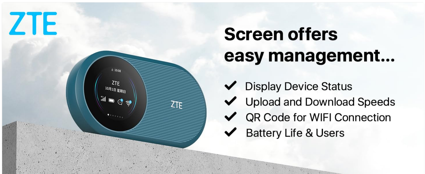
Image: The ZTE U10S Pro's screen showing various icons and information, such as signal strength, battery level, and connected users, demonstrating its easy management features.