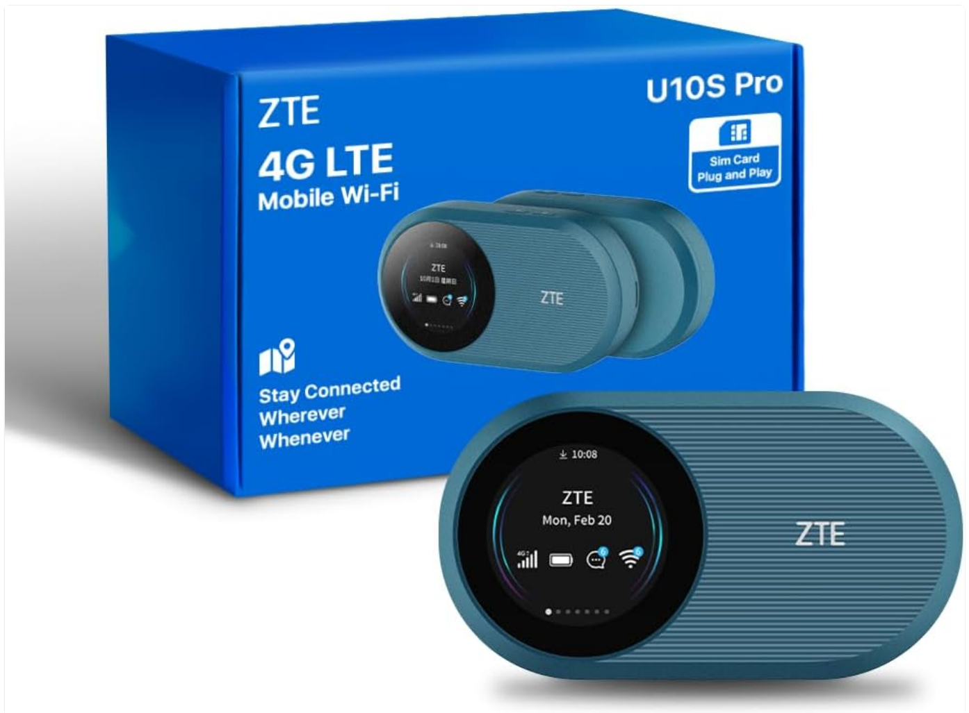
Image: The ZTE U10S Pro device shown alongside its blue retail box, indicating the product and its packaging.