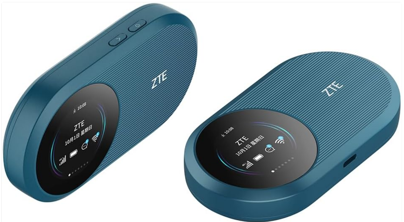
Image: Two different angled views of the ZTE U10S Pro, showcasing its sleek blue design and the circular display screen.

Press and hold the Power button (usually located on the side or top) for a few seconds until the screen illuminates and the device starts up. The device will automatically detect the SIM card and attempt to connect to the 4G/3G network.