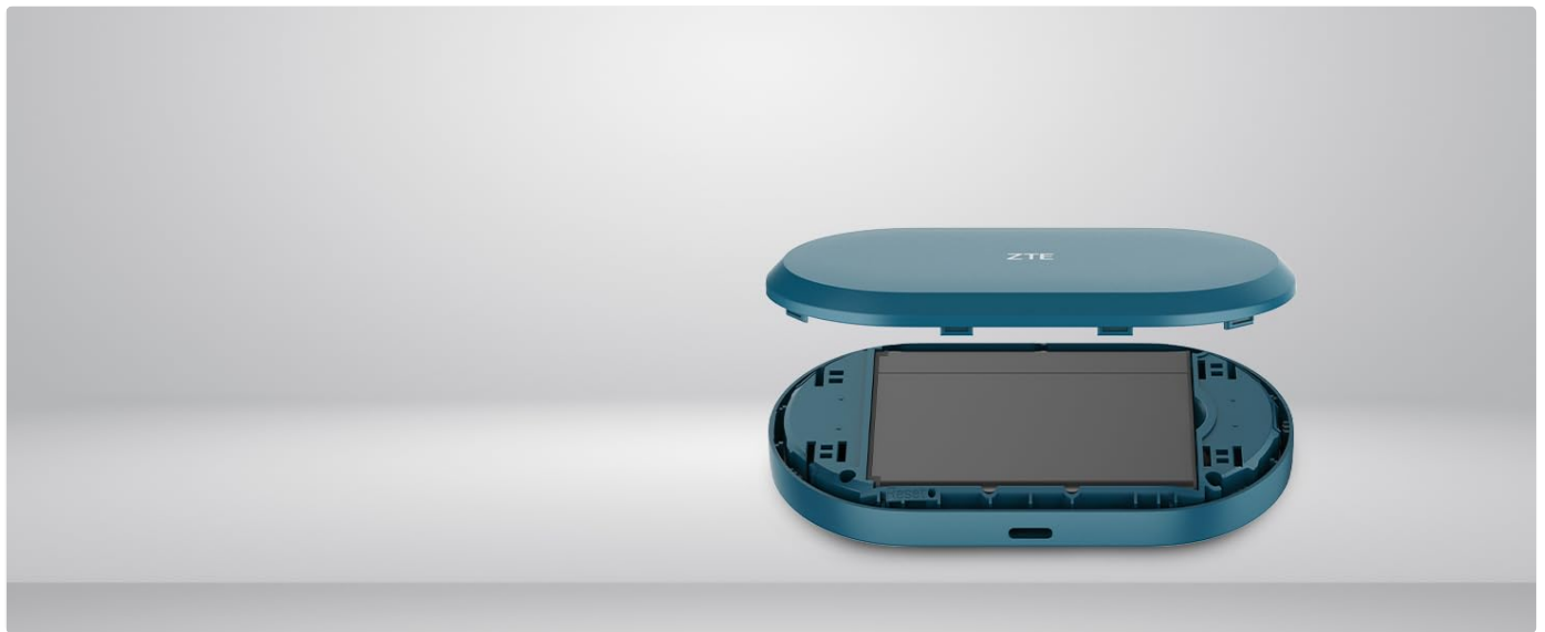
Image: The ZTE U10S Pro device with its back cover open, revealing the internal battery compartment and SIM card slot, illustrating how to install components.