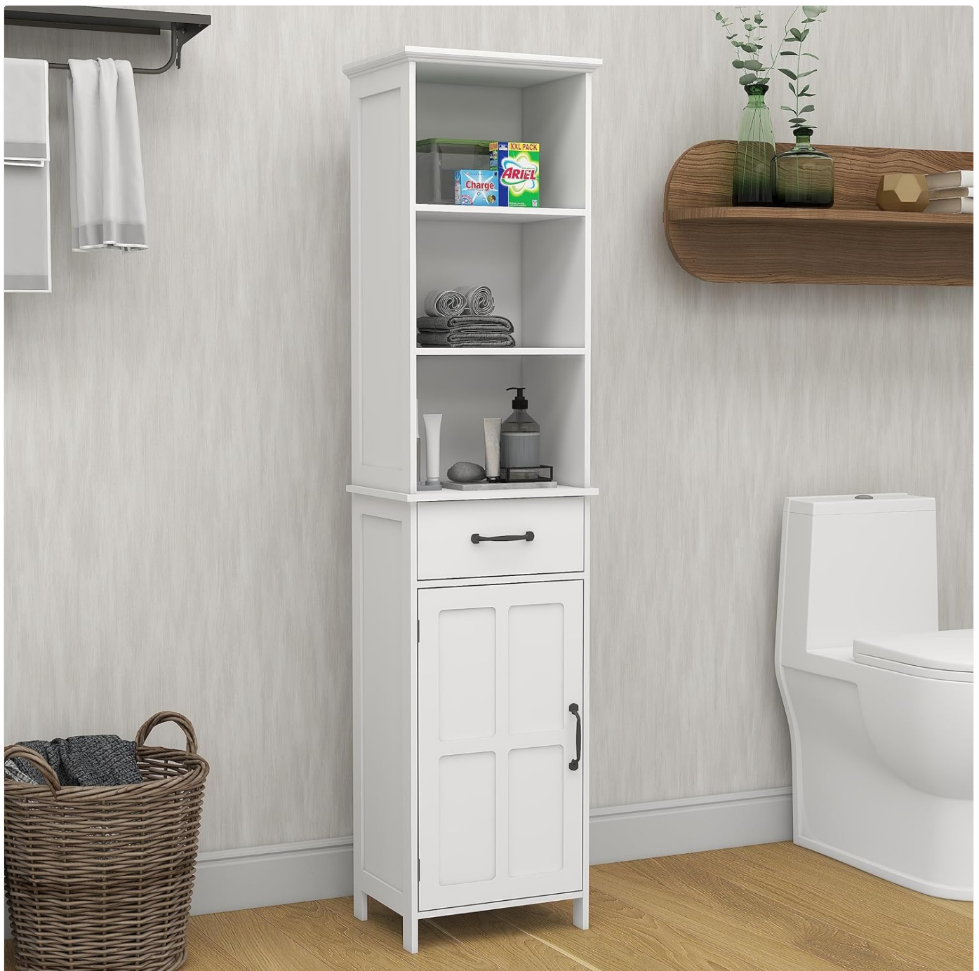
Figure 1: OneBlis Tall Bathroom Storage Cabinet (Model YC-YSG07) in a typical bathroom environment, showcasing its compact design and storage capabilities.