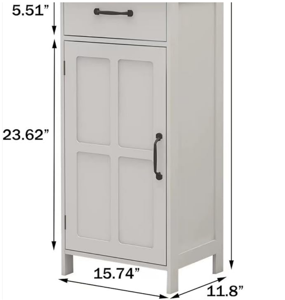
Figure 2: Detailed dimensions of the cabinet, including height, width, and depth of various sections, crucial for planning placement and assembly.