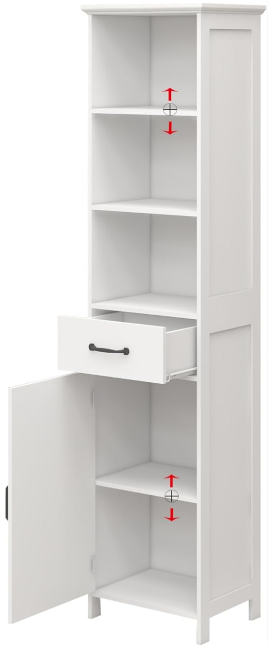
Figure 3: Illustration demonstrating the adjustable partition feature, allowing customization of shelf heights to accommodate items of varying sizes.

It is Suitable for Storing Items of Different Heights to Meet the Storage Needs of Different Scenarios.