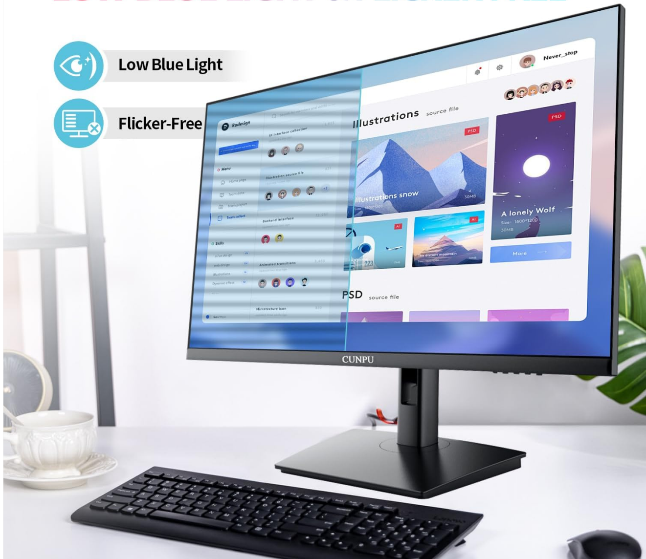
Image: The monitor illustrating its low blue light and flicker-free features designed to reduce eye strain.