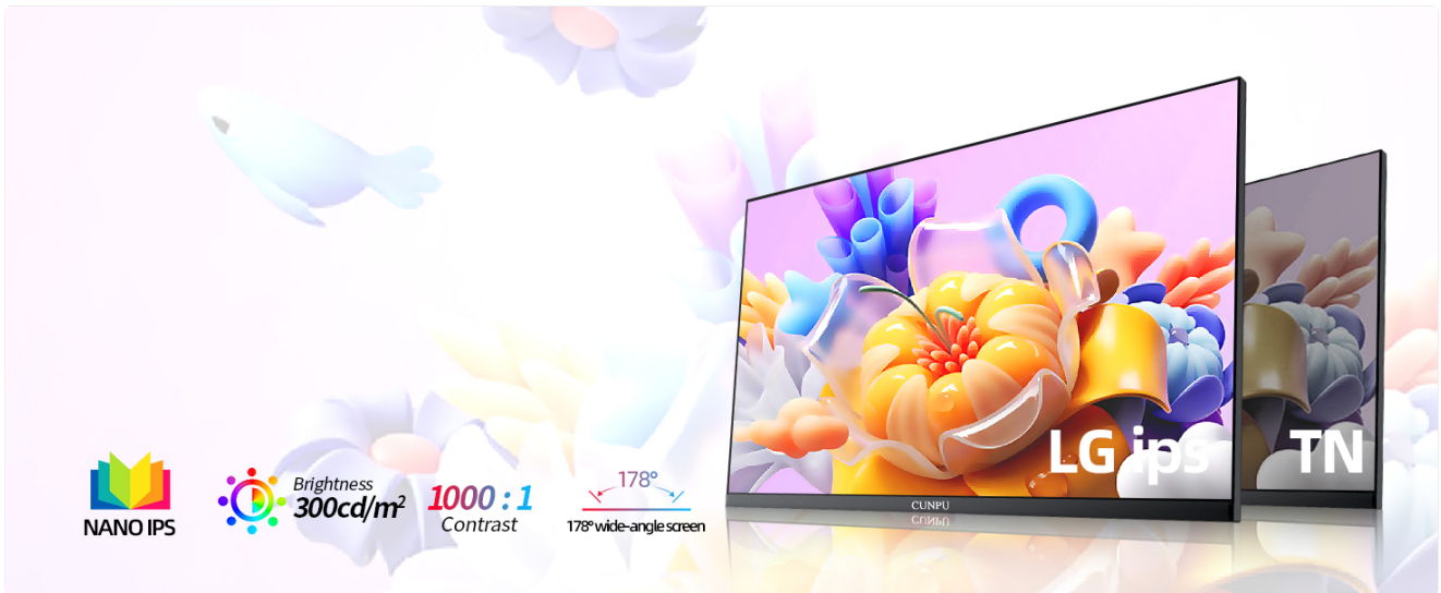
Image: The monitor showcasing its true-to-life color capabilities, highlighting Nano IPS technology, 100% sRGB, 300cd/m 2 brightness, and 8-bit color depth.