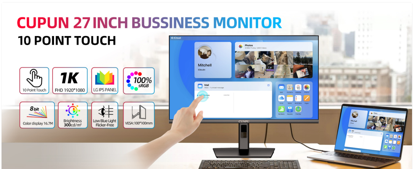
Image: A user demonstrating the smooth 10-point touch experience on the monitor, interacting with a virtual keyboard.

The 10-point capacitive touchscreen allows for intuitive interaction with your content. Use multiple fingers for gestures such as zooming in and out, dragging, and making notes directly on the screen. No additional drivers or stylus are required for Windows systems and Chromebooks.