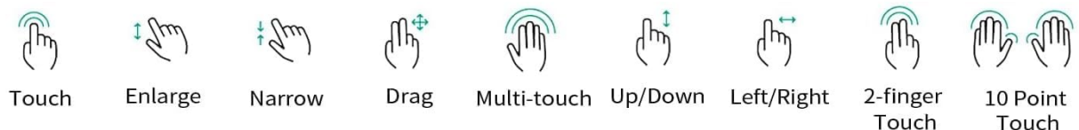
Image: Visual guide to touch gestures and a clear statement on operating system compatibility for the touch function.

The touch function support windows system, Chromebook. The touch function does not supports on Apple devices, gaming devices, and XP system