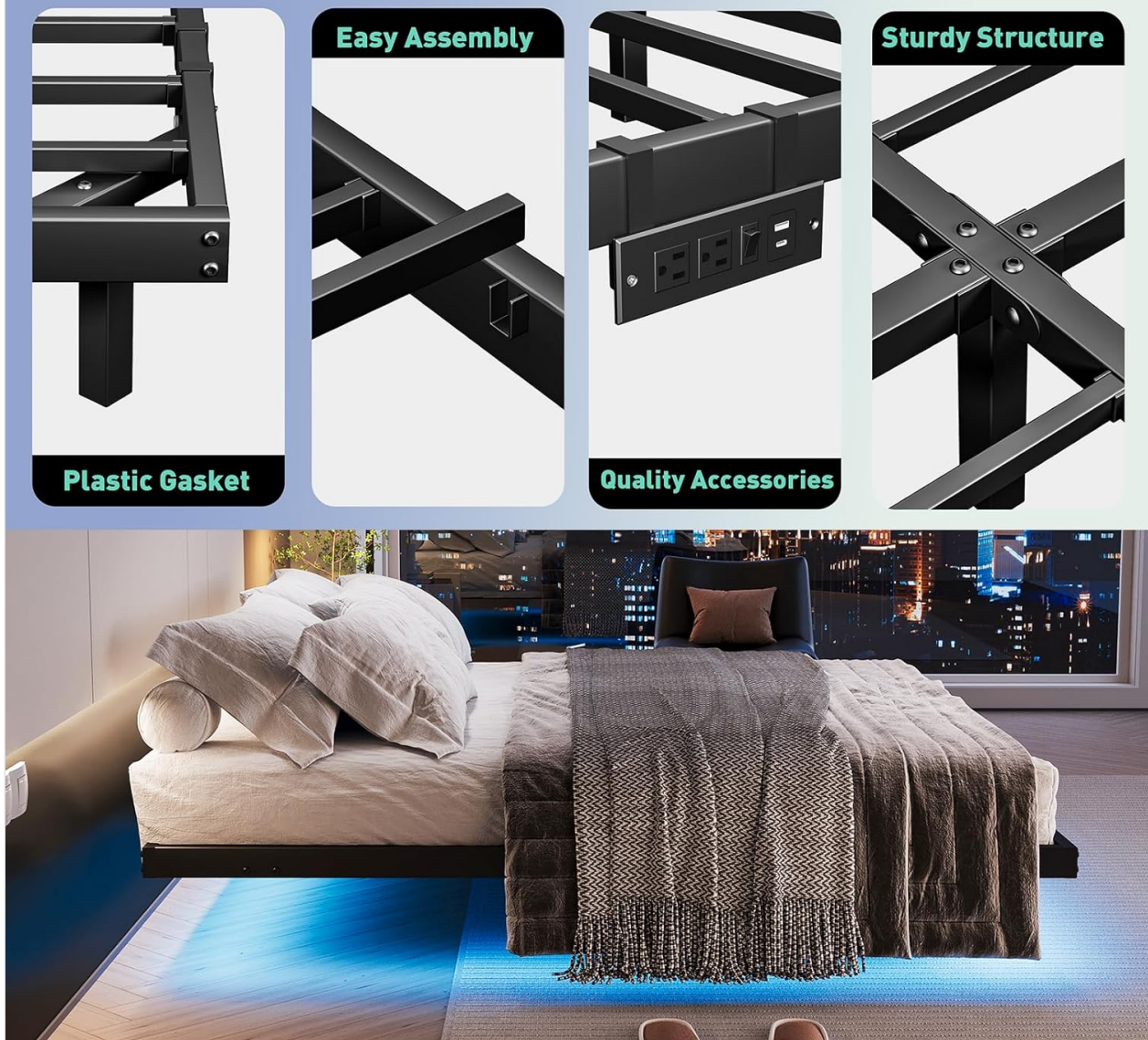
Figure 3.1: Detailed view of bed frame components and features.