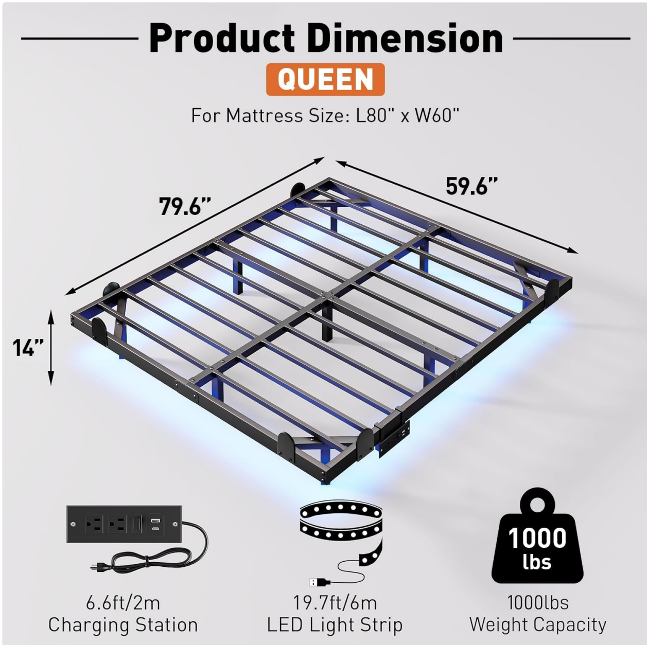
Figure 2.1: Product Dimensions and Features

Overall Dimensions: 79.6"L x 59.6"W x 14"H (for Queen mattress size L80" x W60")