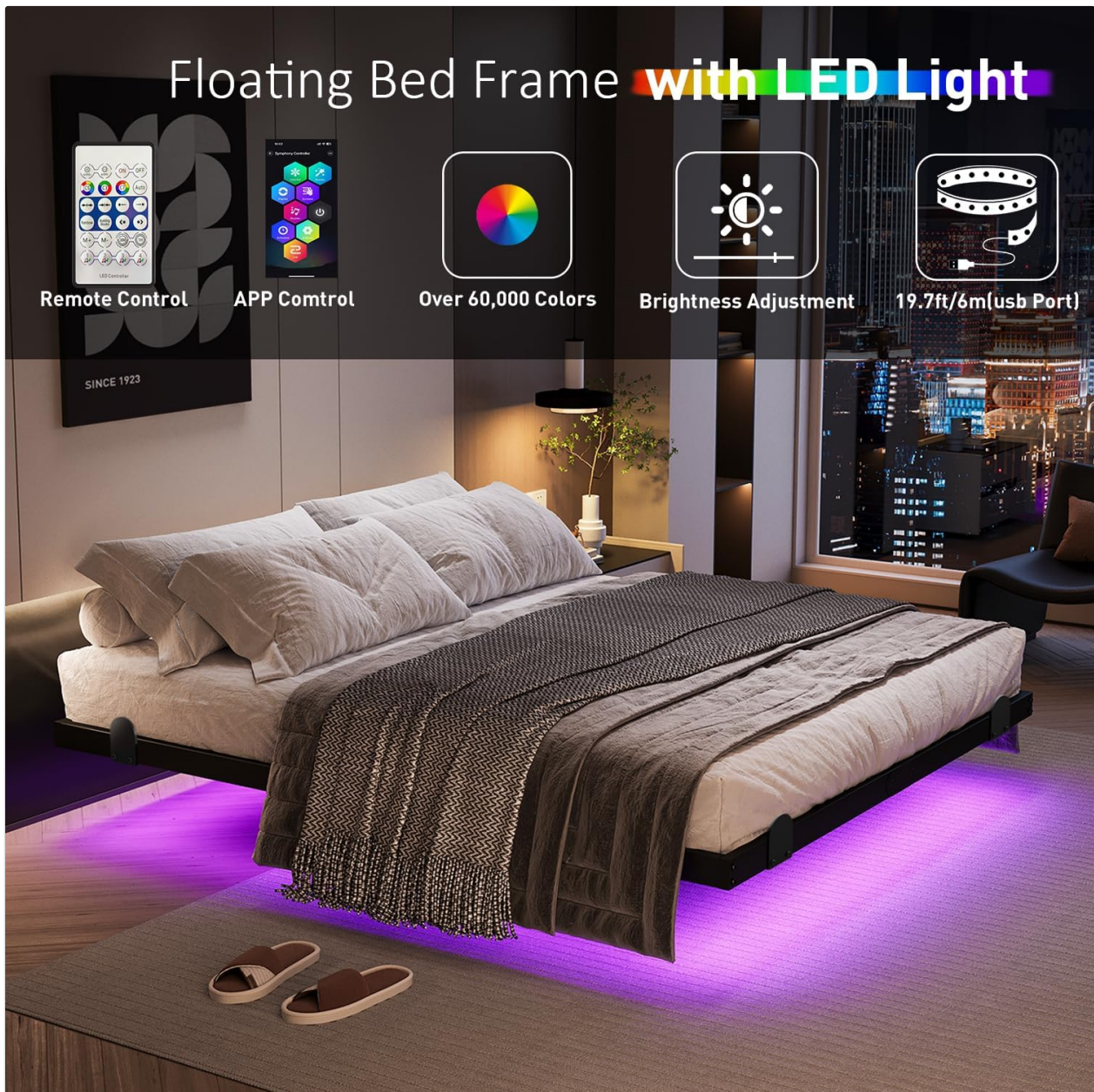
Figure 5.1: LED Light Control Options.