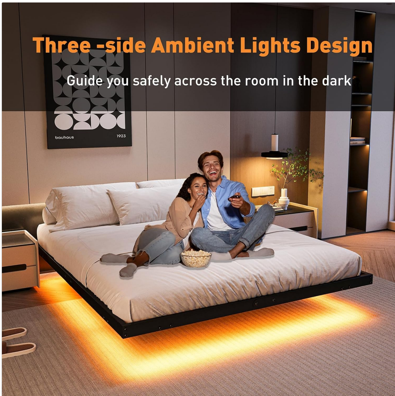
Figure 5.2: Three-side Ambient Lights Design.