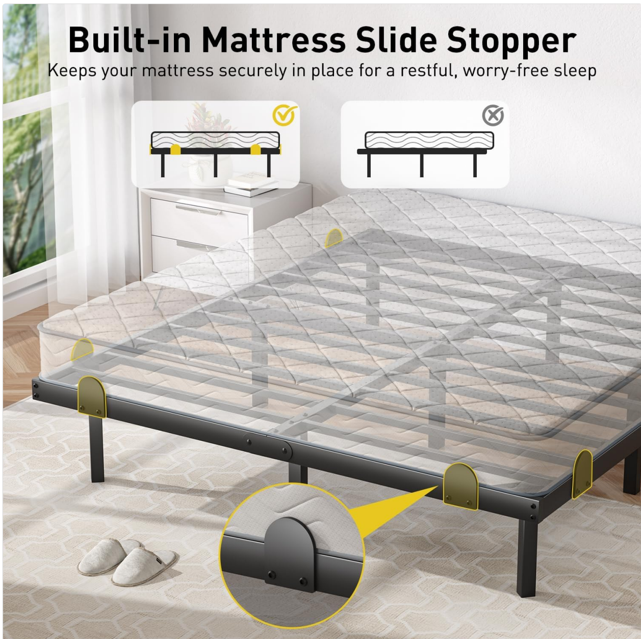
Figure 4.2: Built-in Mattress Slide Stopper for secure mattress placement.

Video 4.1: Official AGXI assembly guide for the Floating Bed Frame with LED Lights and Charging Station. This video demonstrates the step-by-step process of putting together the bed frame, including attaching the headboard, installing support legs, and connecting the electrical components.