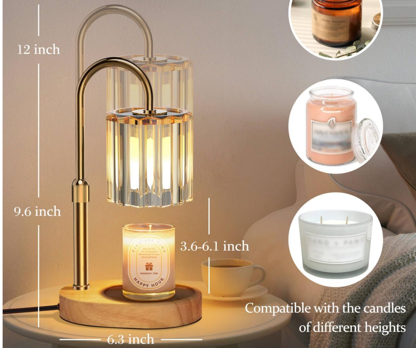
Image: A diagram detailing the adjustable height feature, accommodating candles between 3.6 to 6.1 inches tall.