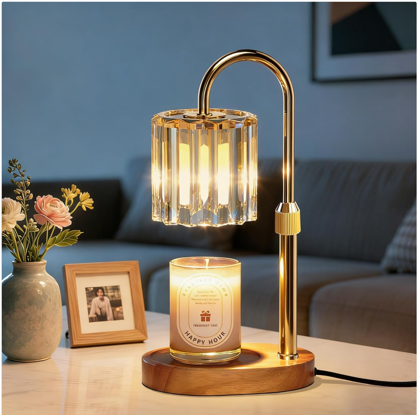
Image: The Lukasa Candle Warmer Lamp in Golden finish, showcasing its elegant design with a candle placed on the wooden base.