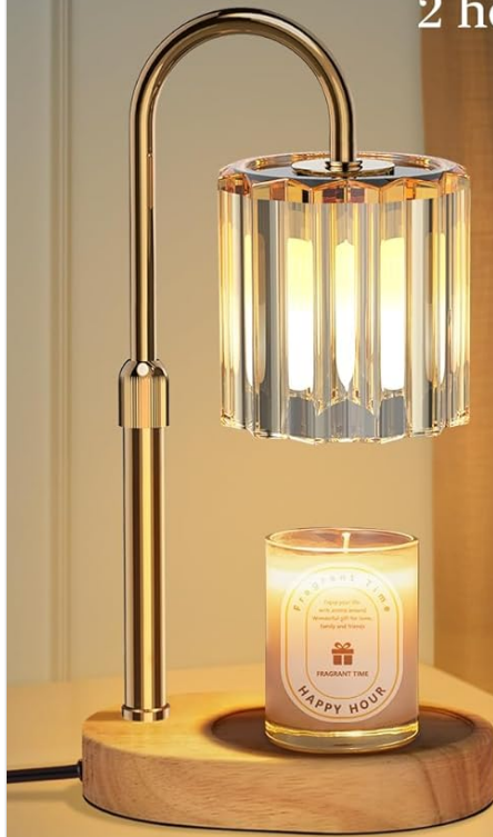
Image: The candle warmer lamp illustrating its convenient timer function with 2, 4, and 8-hour auto-shutoff options.