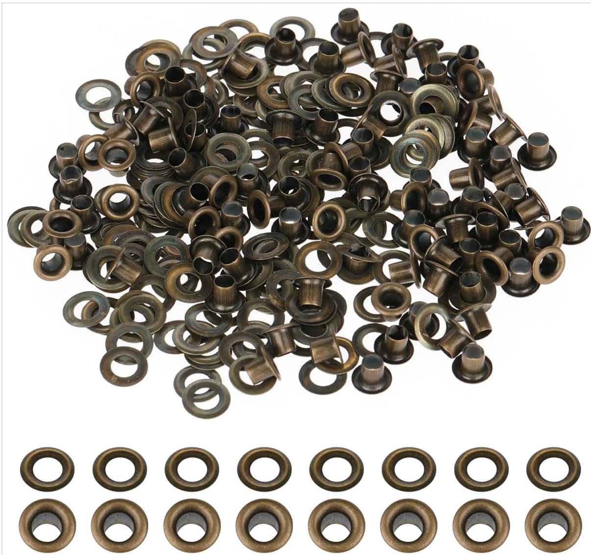
Image: Overview of the Hariendny Tiny Grommets Eyelets kit, showing the individual grommets and washers, and how they fit together.