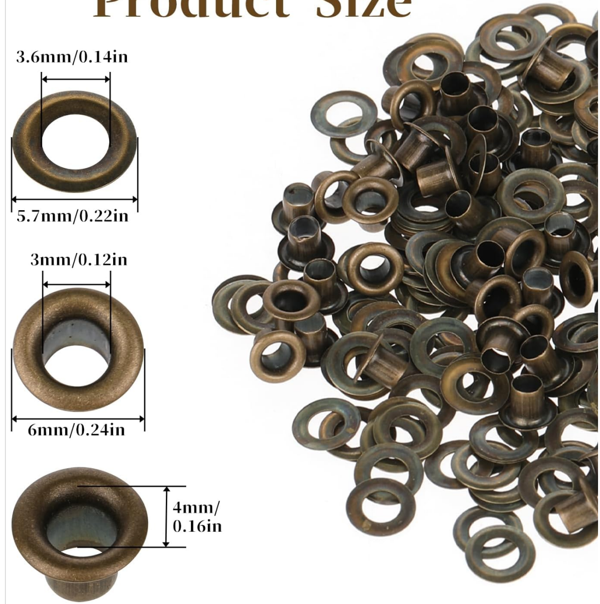
Image: Detailed dimensions of the grommets and washers for accurate project planning.