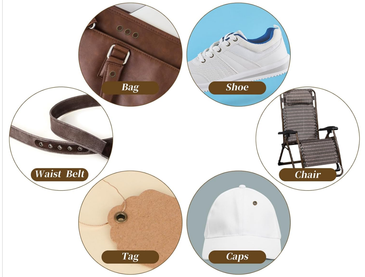
Image: Examples of common applications for the grommet kit, demonstrating its versatility.