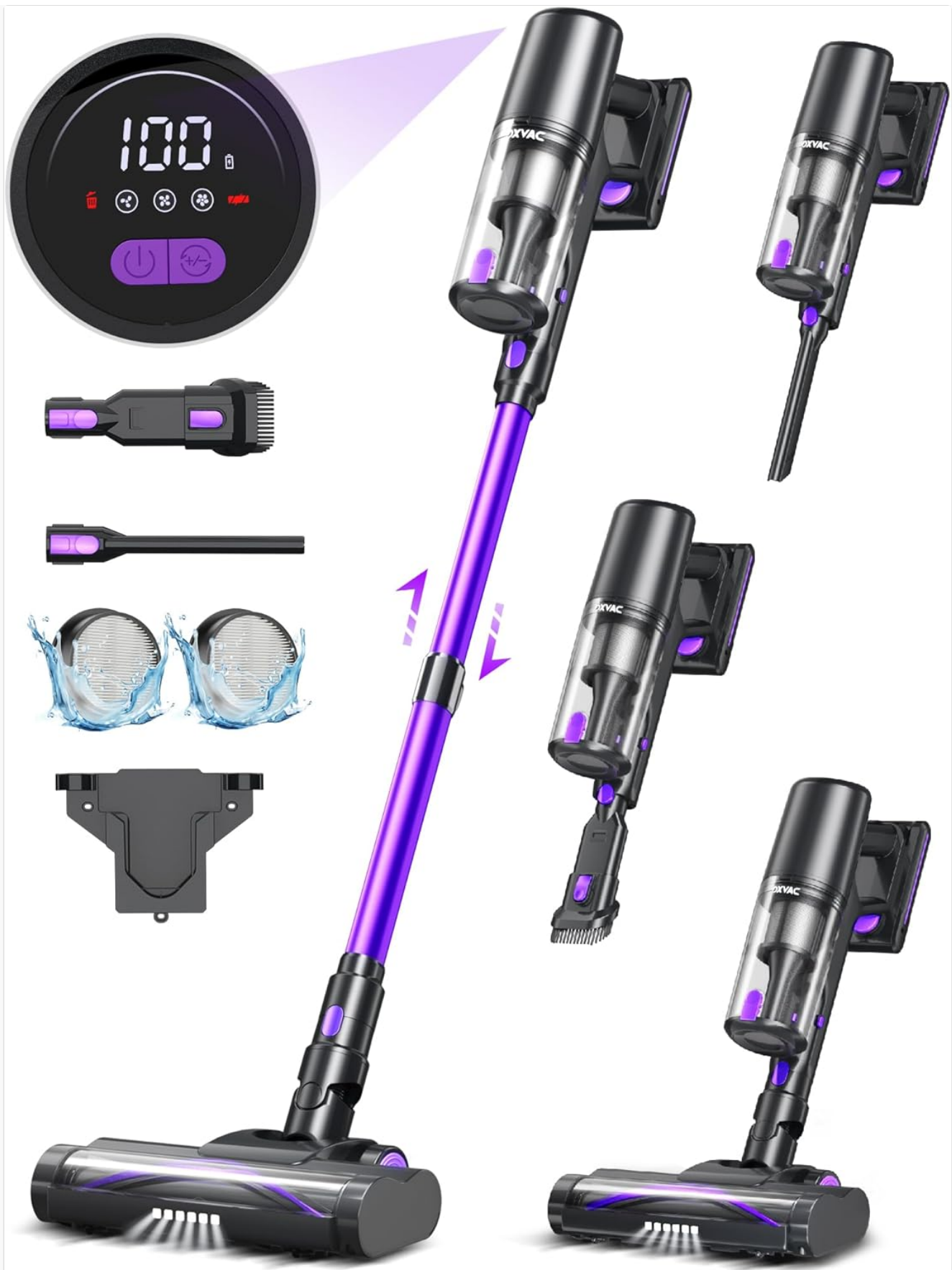
Image: The OXVAC SV008 main unit, extension tube, floor brush, and various accessories, demonstrating different assembly options.