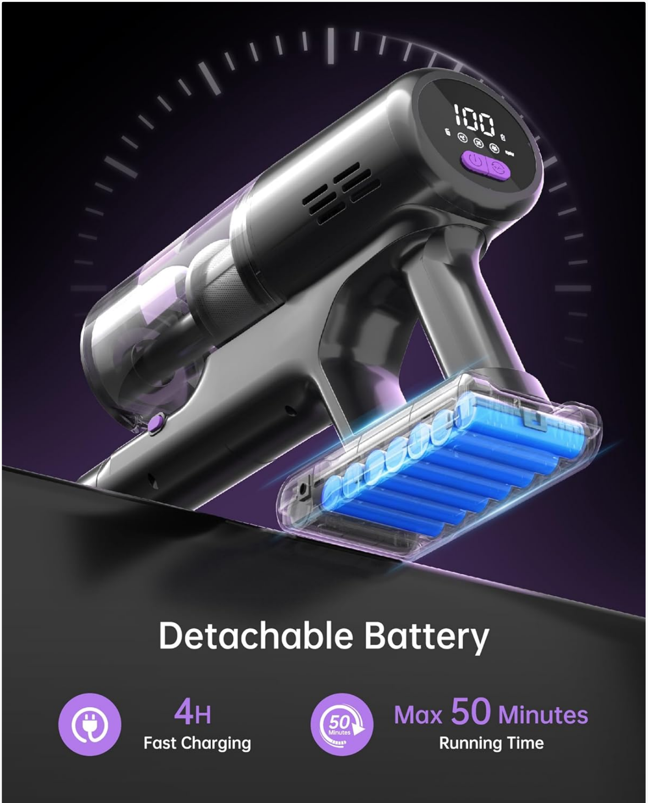
Image: The main vacuum unit with its detachable battery pack clearly visible, illustrating the ease of removal and charging.