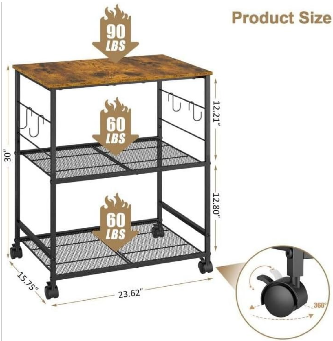
Image: Product dimensions and individual shelf weight capacities. Top shelf: 90 lbs, Middle shelf: 60 lbs, Bottom shelf: 60 lbs. Overall dimensions: 23.62" W x 15.75" D x 30" H.