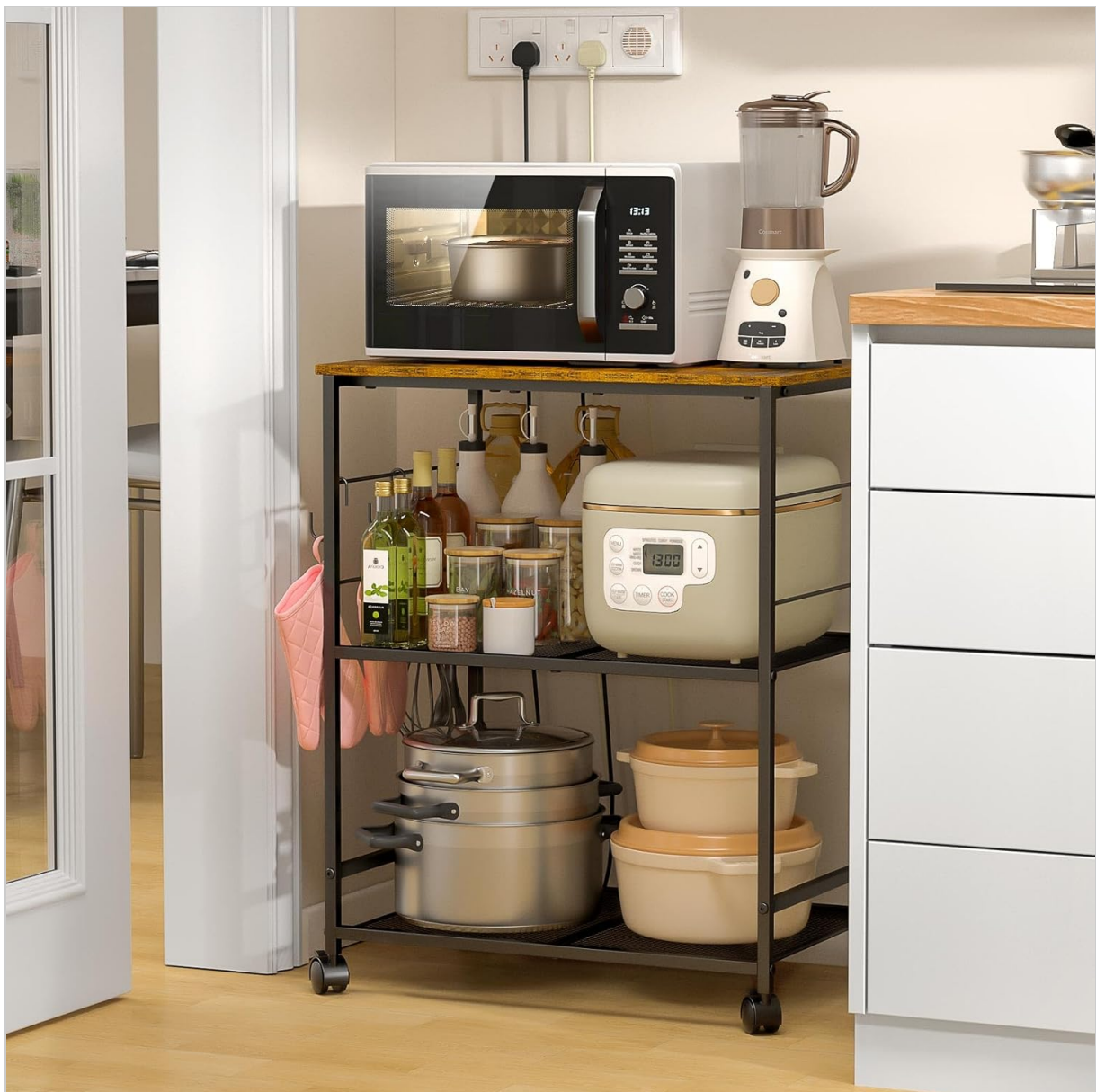
Image: An assembled ThreeHio Rolling Kitchen Microwave Cart, showcasing its structure and capacity for kitchen appliances and storage.