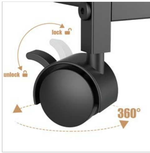
Image: Detail of the 360-degree rotating, lockable wheel, illustrating its function for mobility and stability.