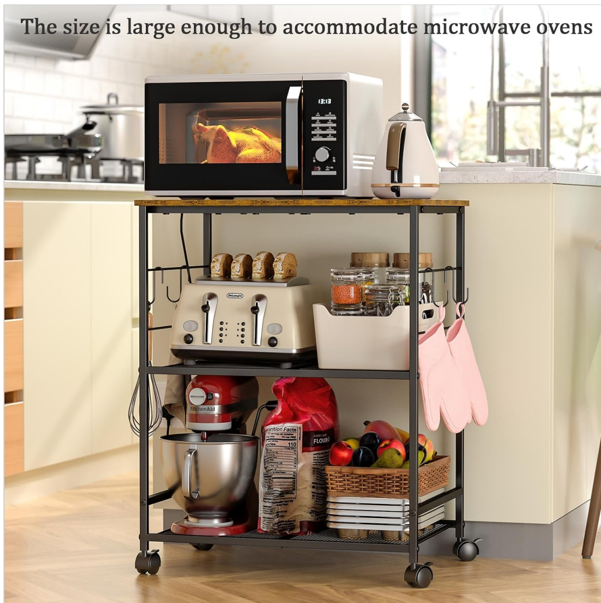
Image: The cart functioning as a microwave stand and additional storage in a kitchen environment.

The size is large enough to accommodate microwave ovens