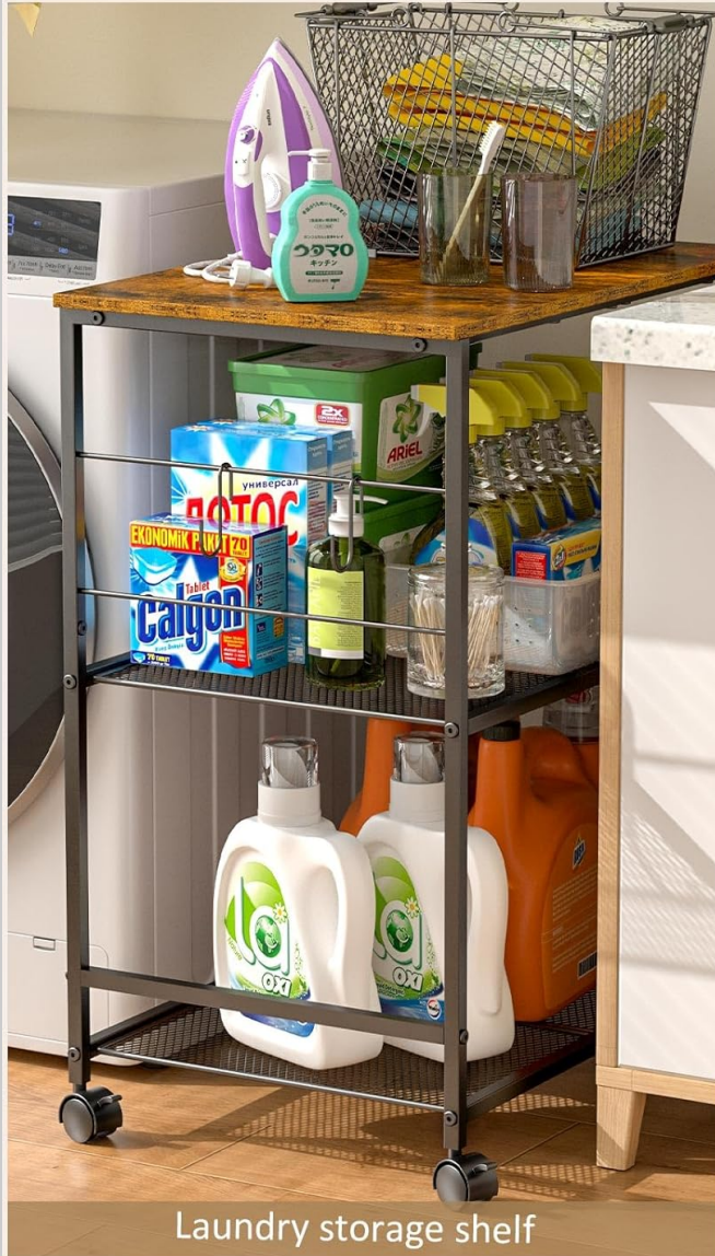
Laundry storage shelf