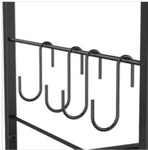
Image: Close-up view of the S-shaped hooks, designed for hanging small utensils or accessories.