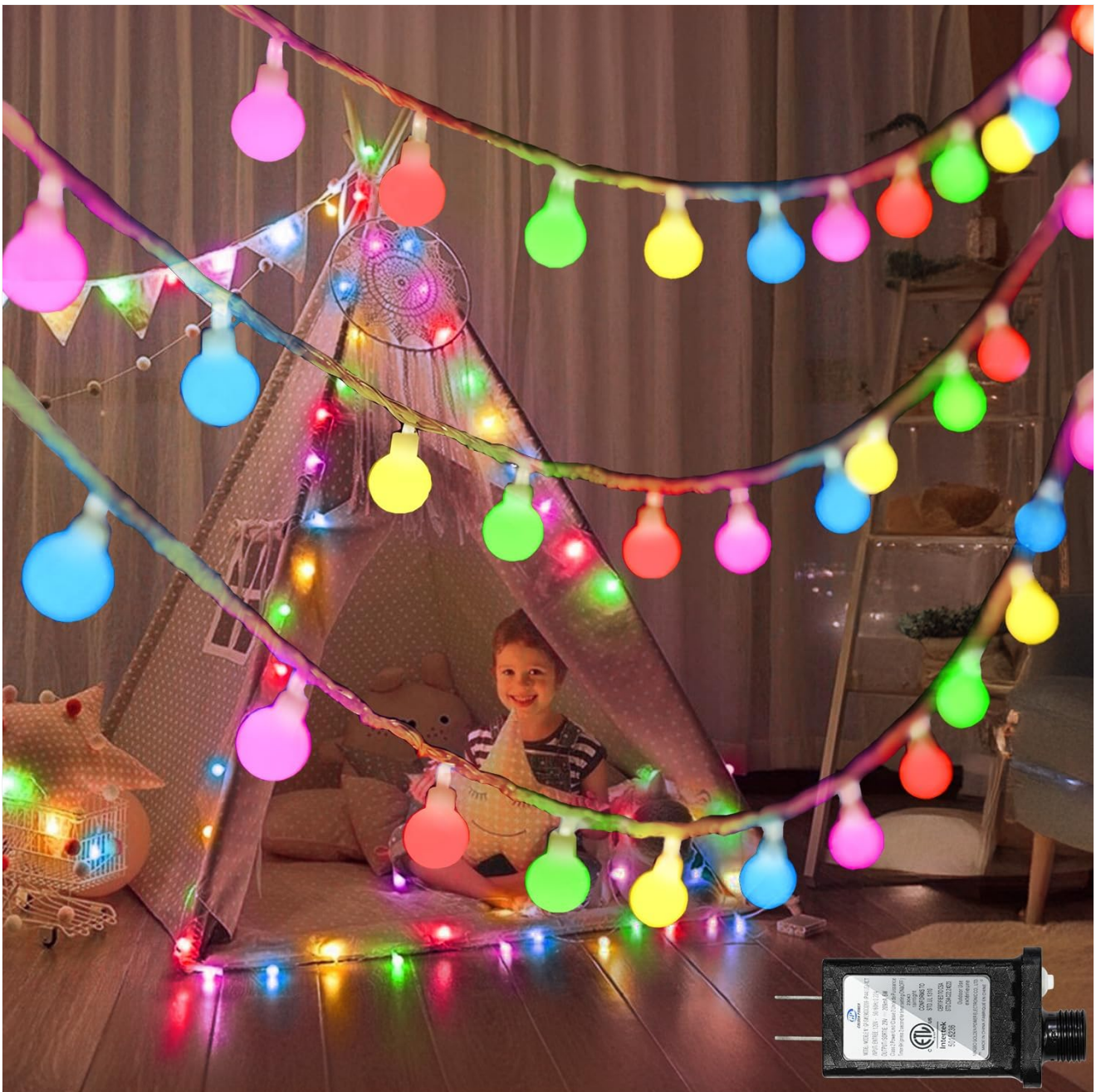
Image 1: The WUXIYANG 360 LED String Lights featuring multicolor globe bulbs, creating a festive atmosphere around a child's play tent.