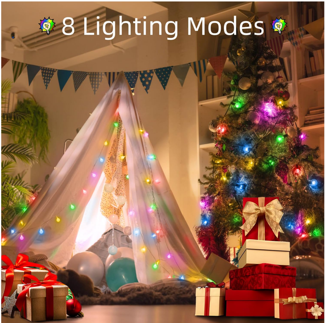
Image 3: The WUXYIYANG 360 LED String Lights showcasing their 8 distinct lighting modes, suitable for diverse decorative needs.