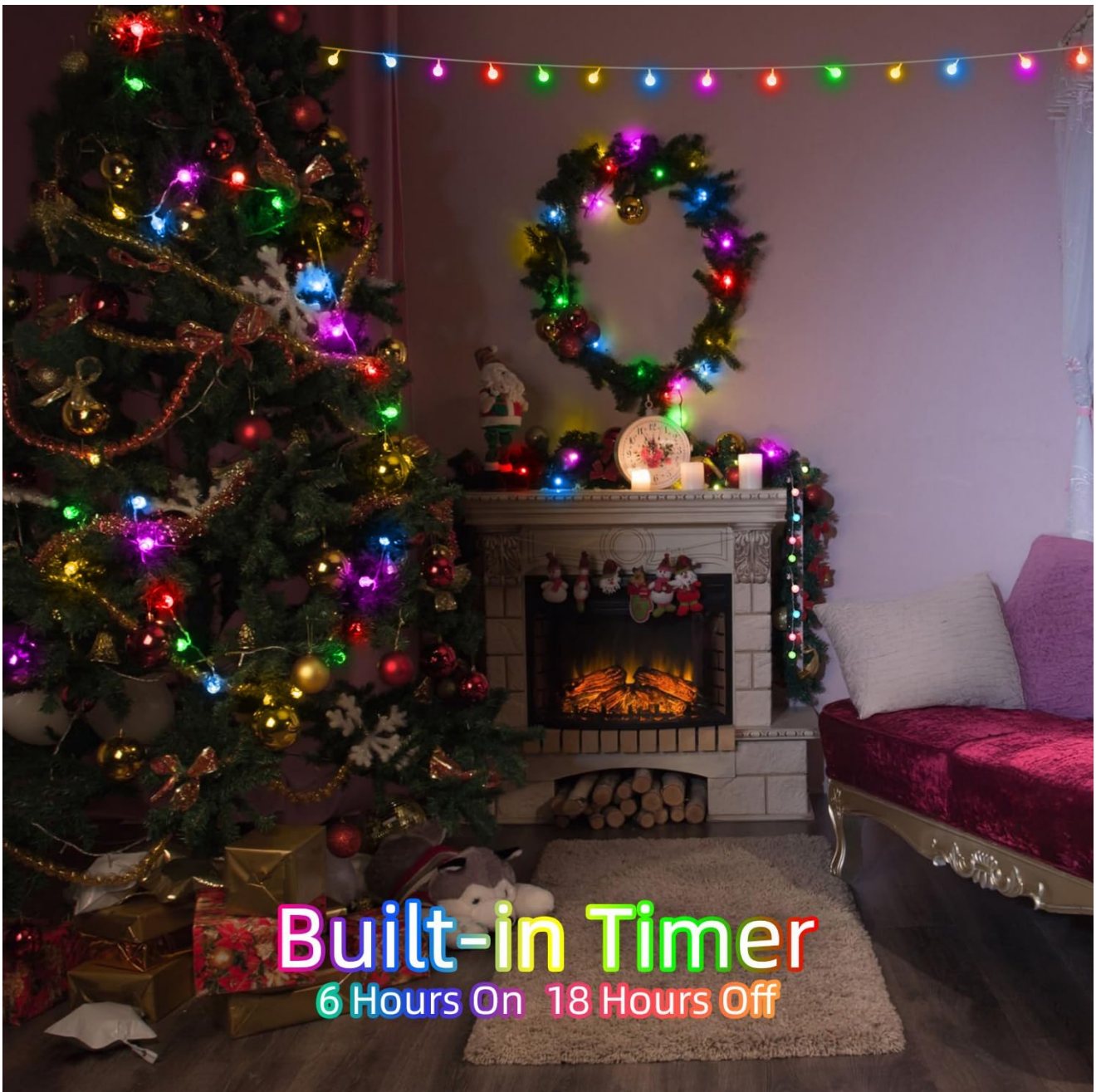
Image 4: The built-in timer function of the WUXYIYANG 360 LED String Lights, demonstrating a 6-hour on and 18-hour off cycle for energy efficiency.