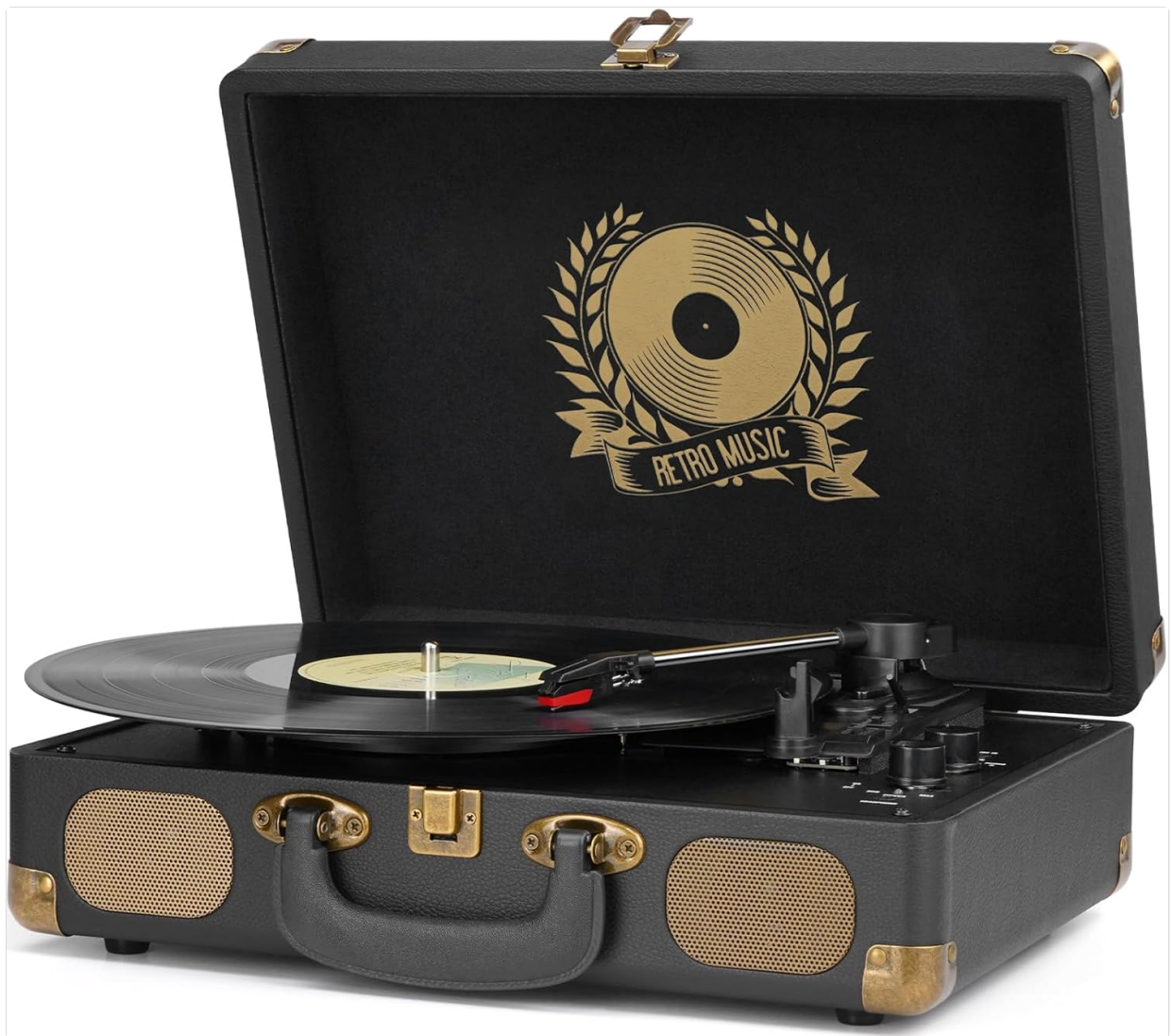
A view of the Mersoco M415-BLACK portable record player in its open position, highlighting the turntable platter, tonearm with stylus, and the integrated stereo speakers on the front.