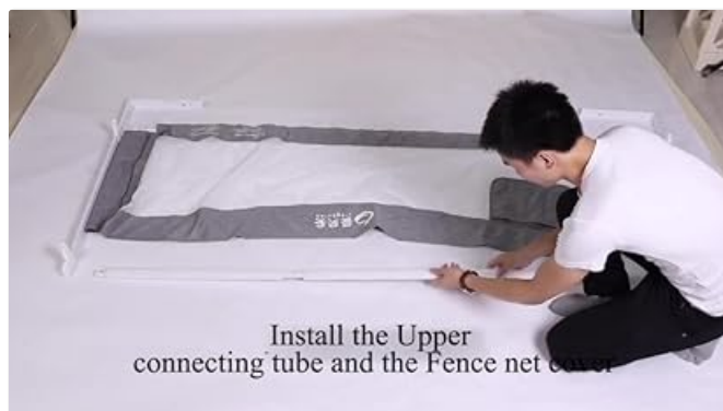
Image: Attaching the upper connecting tube and fitting the fence net cover, as seen in the installation video.