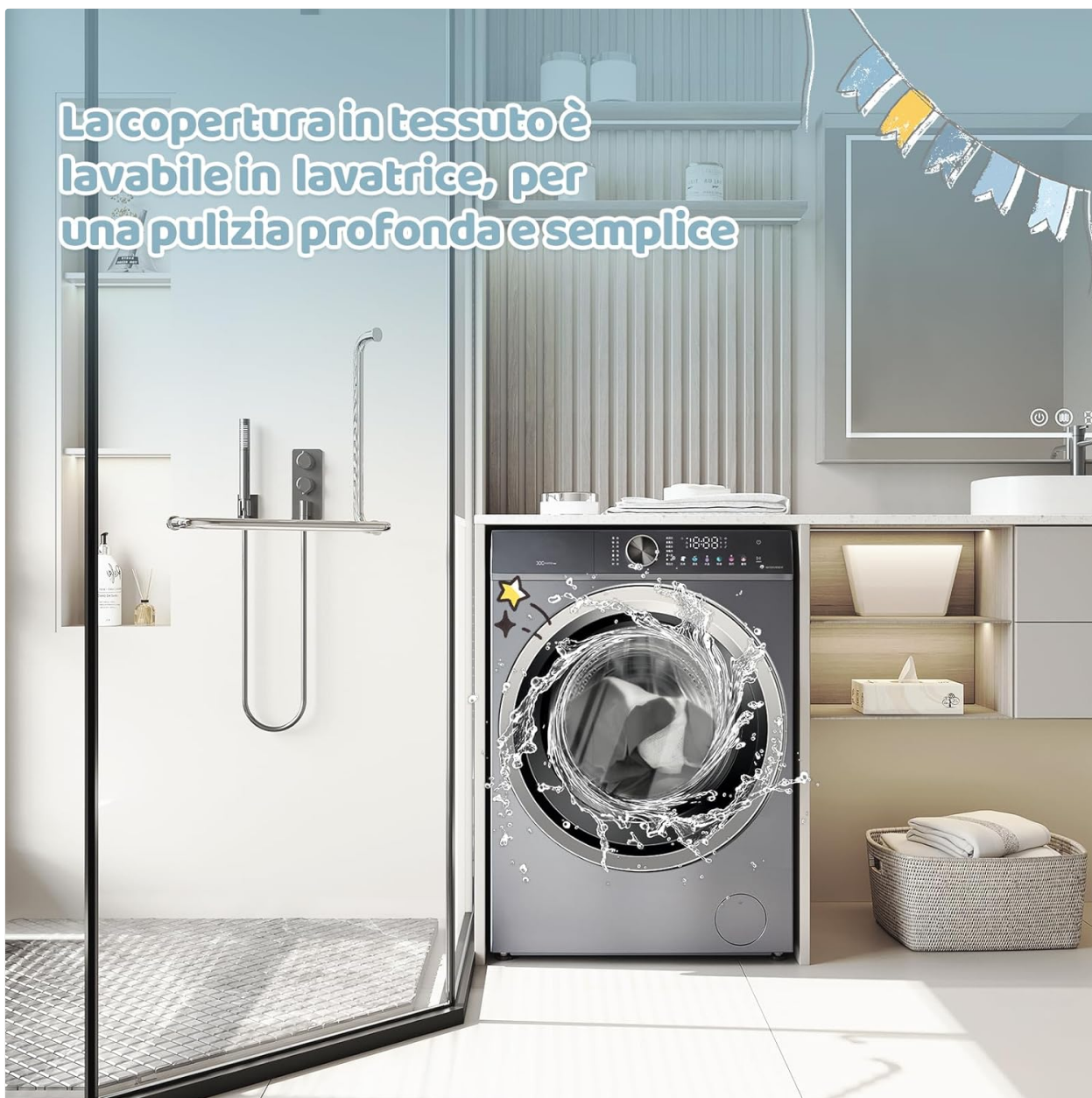
Image: The bed rail's fabric cover being machine washed for easy cleaning.

La copertura in tessuto è lavabile in lavatrice, per una pulizia profonda e semplice