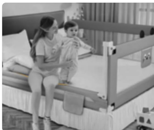
Image: The bed rail in a lowered position, allowing easy access to the bed.