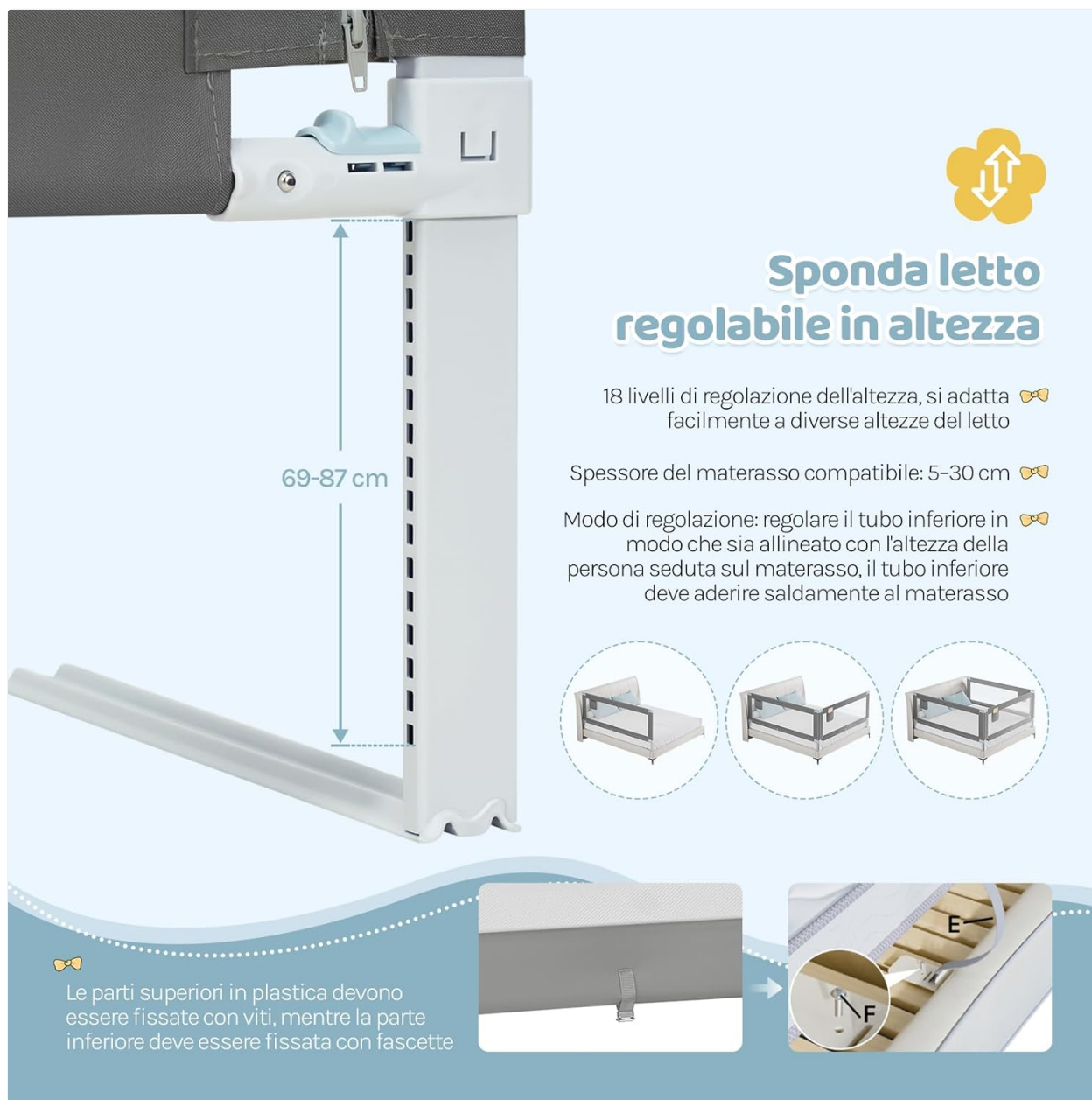
Image: Detailed view of the height adjustment mechanism, showing the range of 69-87 cm and mattress compatibility.