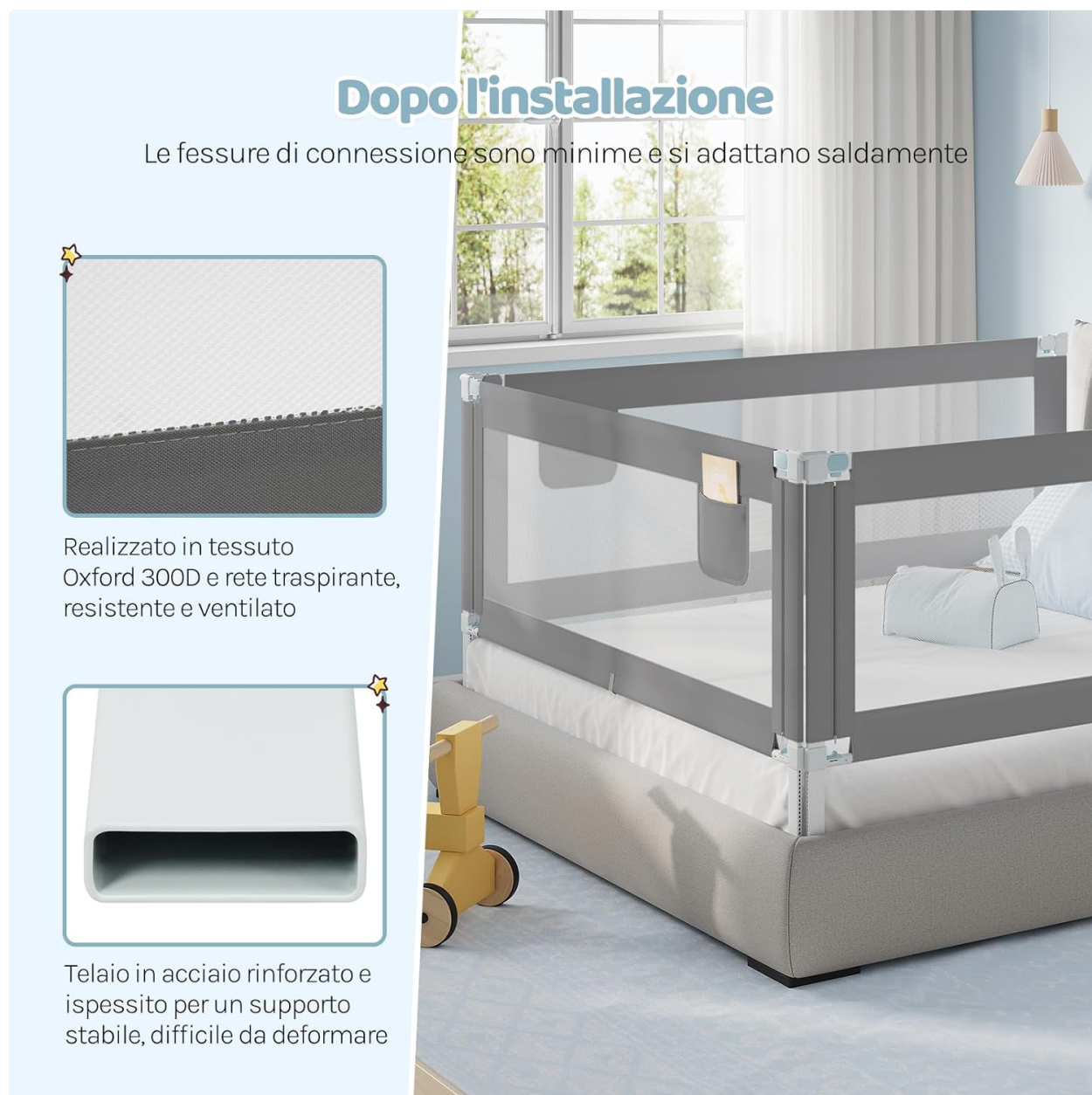
Image: The bed rail securely installed between the mattress and bed frame, showing minimal connection gaps and material details.