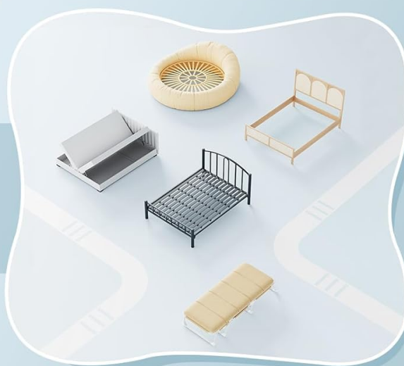
Image: Visual guide to compatible (solid wood slatted beds) and incompatible bed types.

Letti senza doghe, con doghe in metallo o materasso a molle