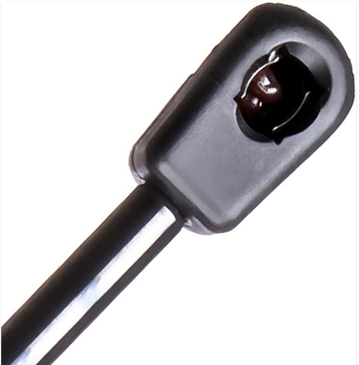
Image: Close-up view of the end of a lift support, showing the metal clip that secures it to a ball stud.

5. Repeat for Other Side: Once the first new support is securely installed, repeat steps 3 and 4 for the other side.