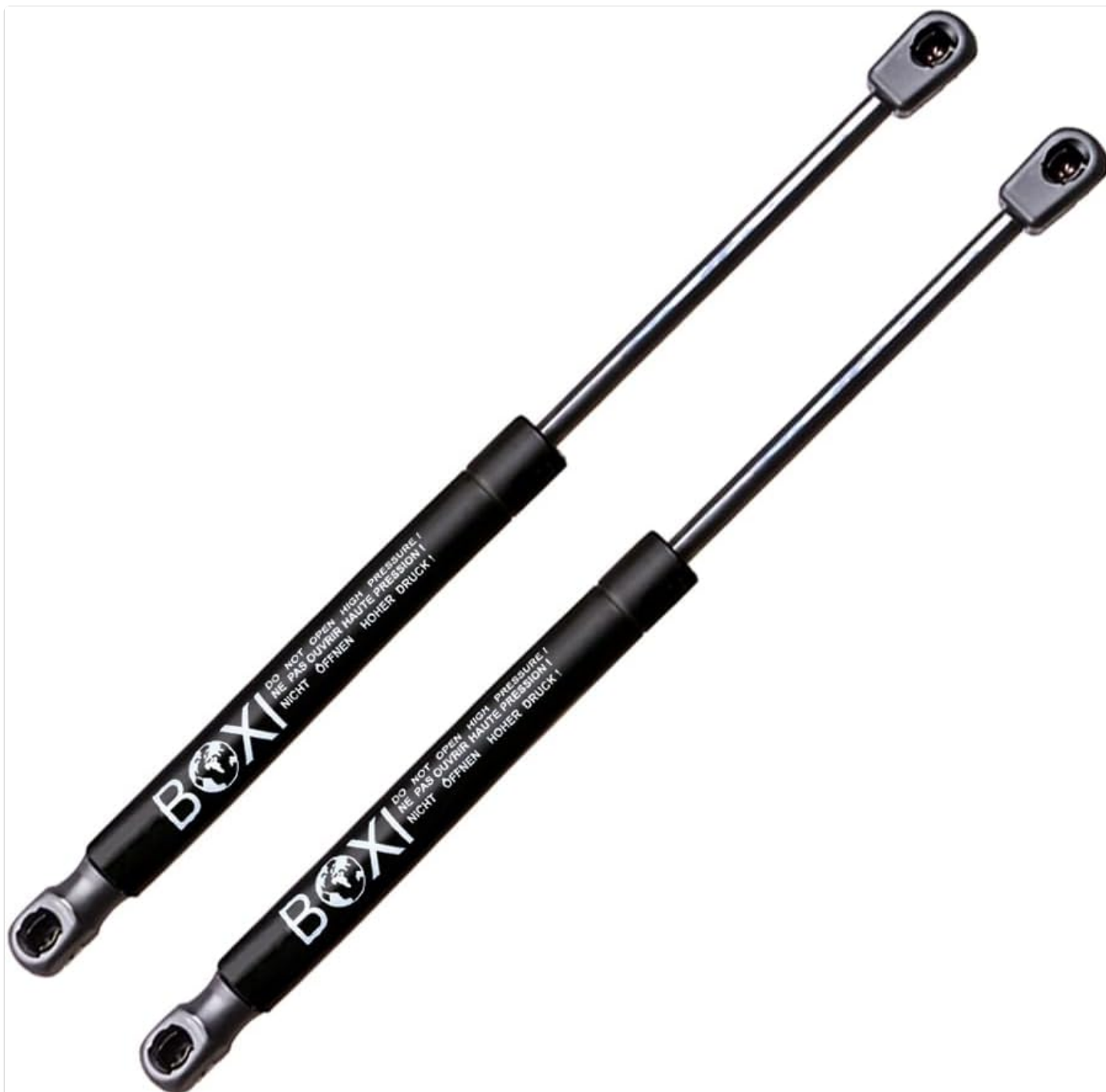
Image: A pair of BOXI front hood lift supports, black cylinders with silver rods and eyelet fittings at each end.