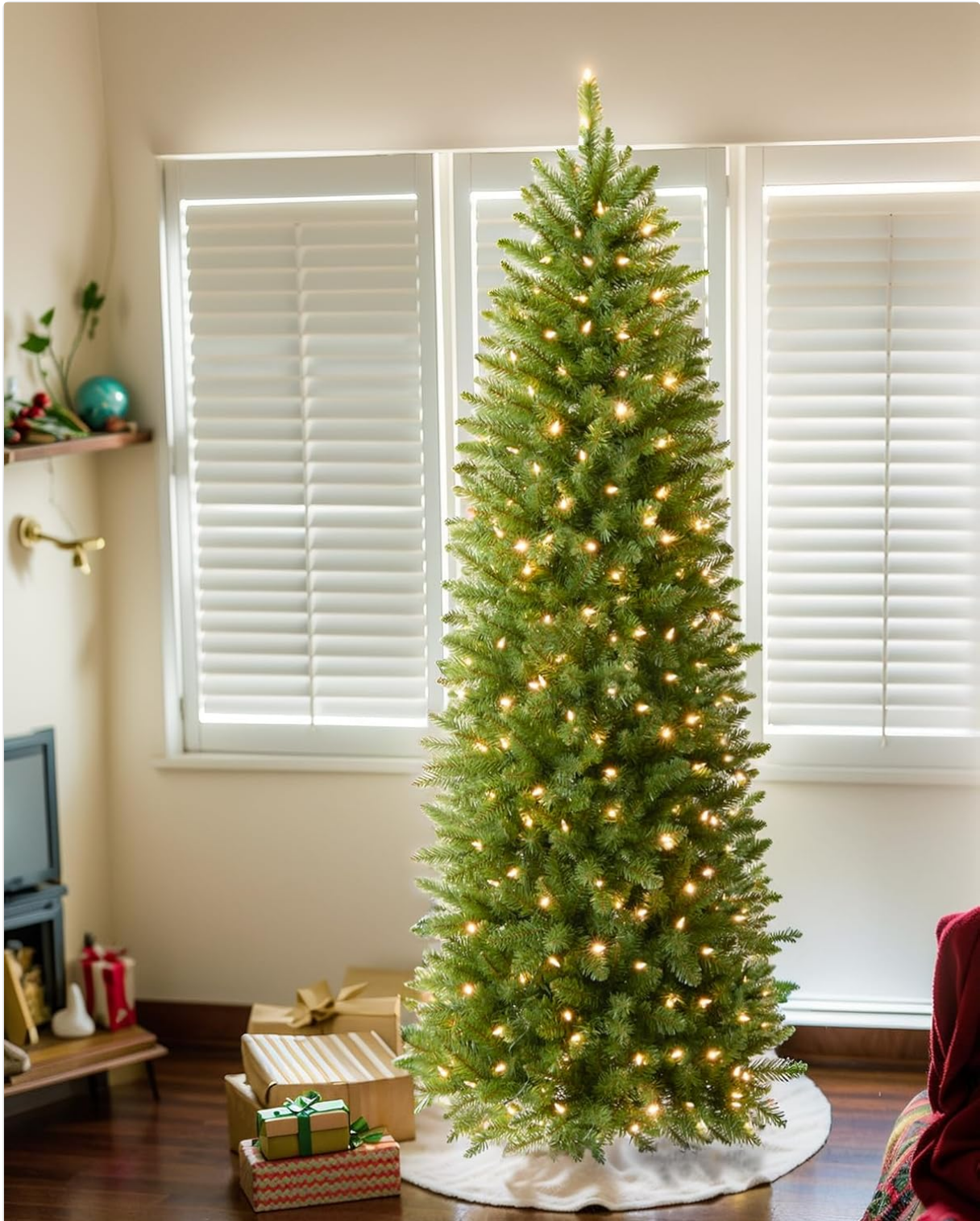
Figure 3: The tree displaying its warm white light setting, providing a classic holiday ambiance.