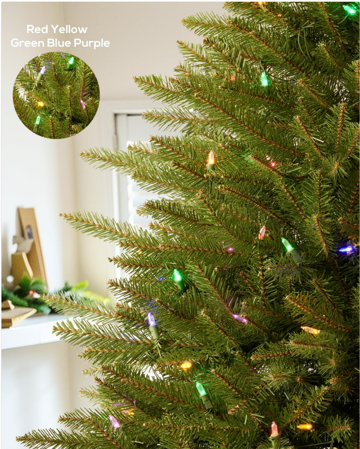
Figure 4: Detail of the tree's multi-color LED lights, showcasing the vibrant array of hues available.