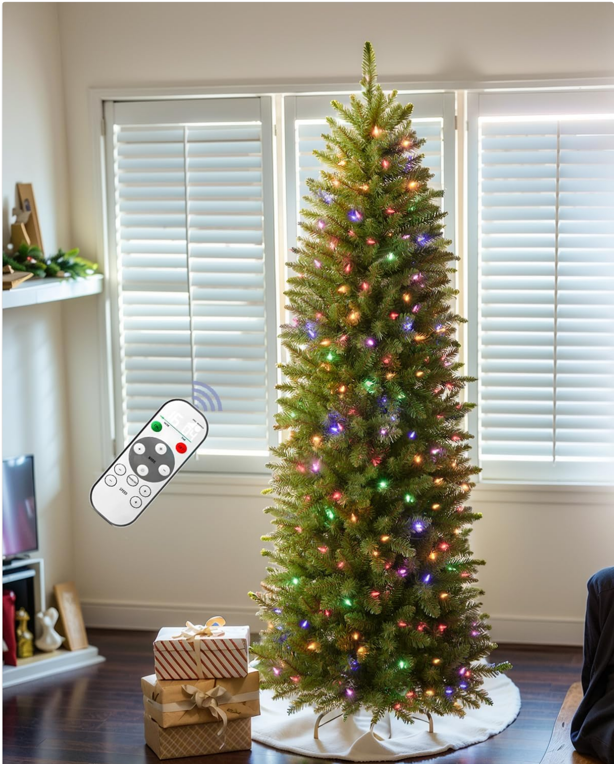
Figure 1: Fully assembled 6-foot pre-lit pencil Christmas tree with multi-color lights. The tree features a slim profile and comes with a remote control for light adjustments.