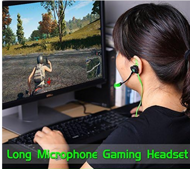
Figure 6: User wearing the G30 earphones during a gaming session.

The G30 earphones feature a side-style guide hole design for enhanced dual deep bass effect, providing immersive sound. The noise-cancelling microphone ensures clear communication by reducing background noise.