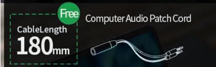
Figure 3: Cable length and included adapters for versatile connectivity.