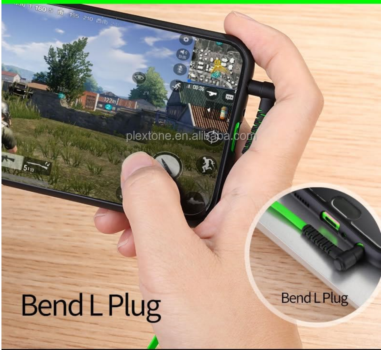
Figure 4: L-shaped 3.5mm plug for mobile device connection.