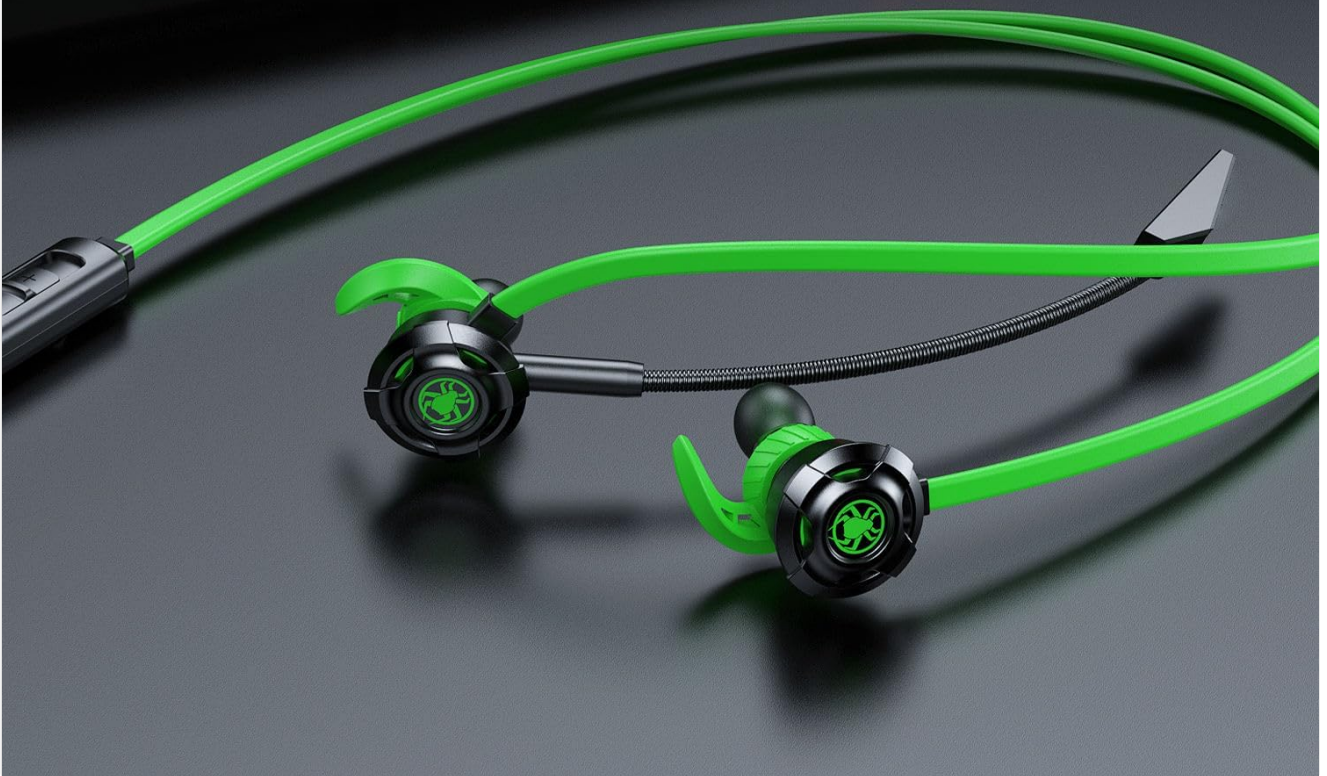
Figure 1: Earphone design with ear hooks and ear tips for comfortable wear.

Long wheeat is pluggable, portable and convenient