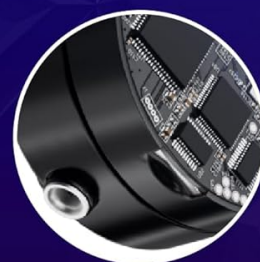
SD CARD SLOT

Image: Close-up view highlighting key internal and external features of the fan, such as processing units, LED lights, and mounting points.