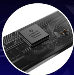
FAST DUAL CORE PROCESSING

BUILT WITH PRECISION USING ONLY THE HIGHEST QUALITY MATERIALS