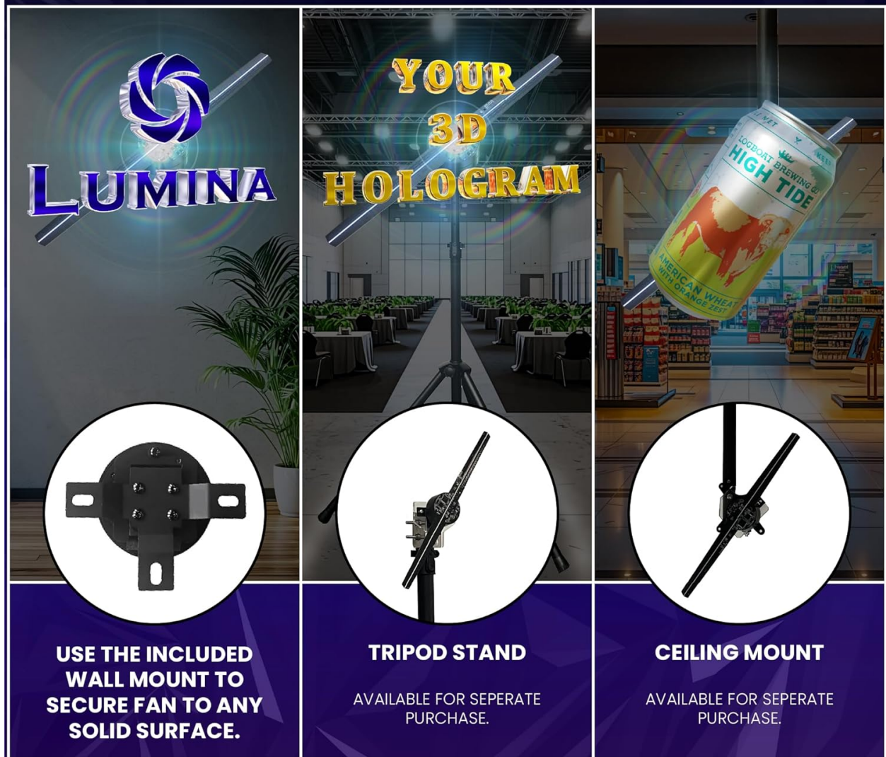
Image: Visual examples of various content types displayed on the holographic fan, such as company logos, product showcases, text messages, and standard 2D videos.

SUPER QUICK AND EASY INSTALLATION WITH INCLUDED COMPACT MOUNT