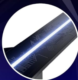
PREMIUM BRIGHT LED LIGHTS