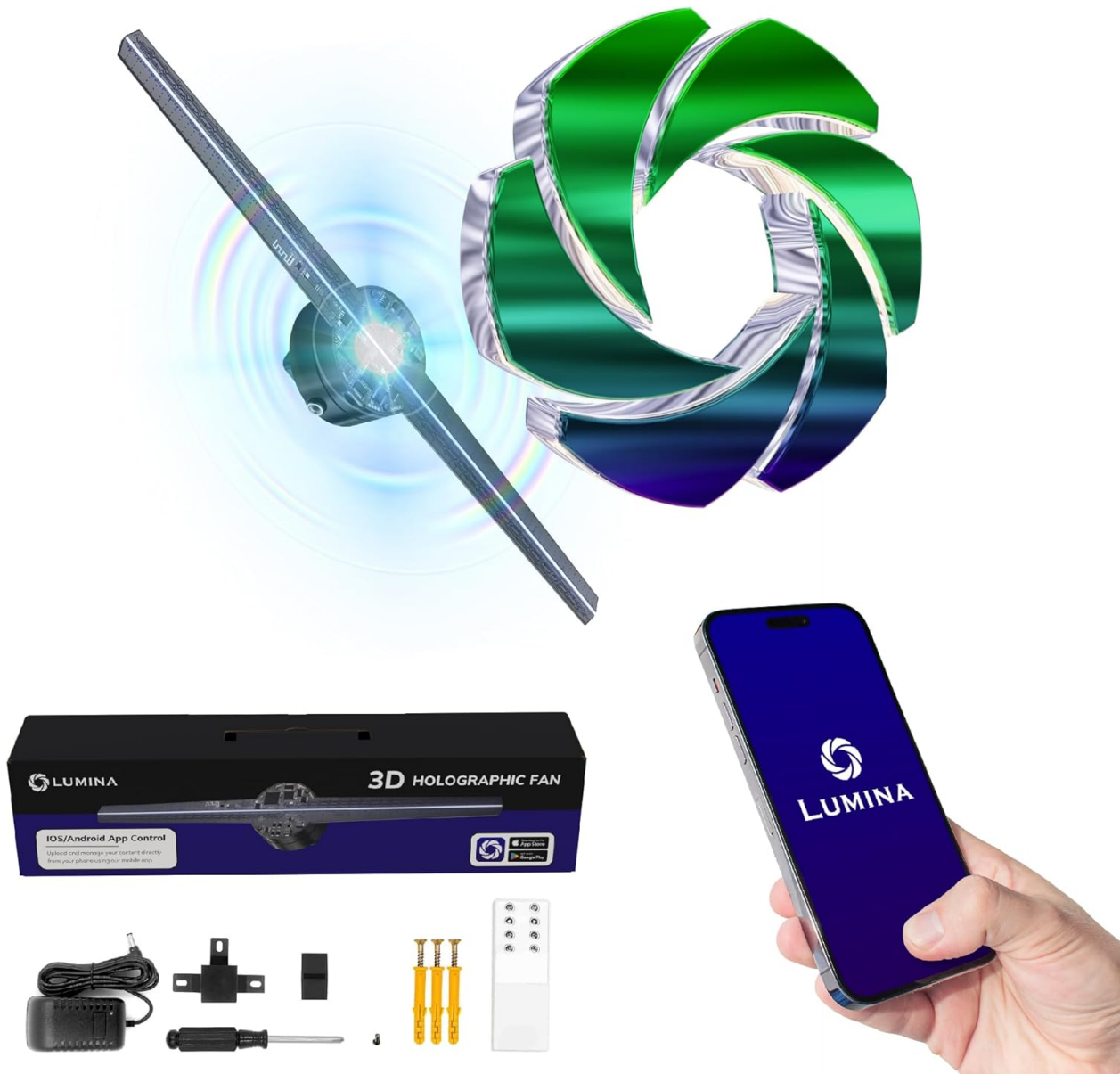
Image: The LUMINA 17" 3D Holographic Fan with its packaging, remote control, power adapter, and wall mount accessories.