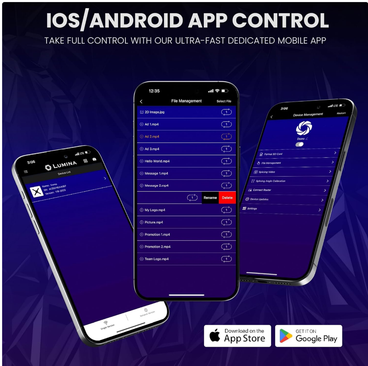
Image: Screenshots demonstrating the user interface of the LUMINA mobile app for device control and content management.

Alternatively, content can be uploaded from a computer using the included SD card and USB drive.