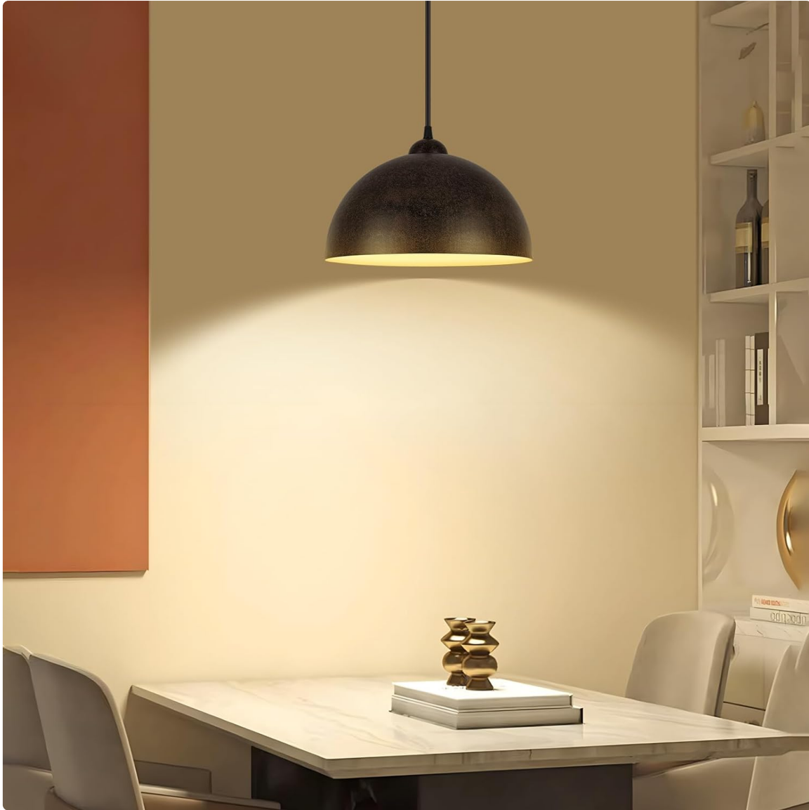
Image: The pendant light beautifully integrated into a modern kitchen, demonstrating a typical installation scenario.