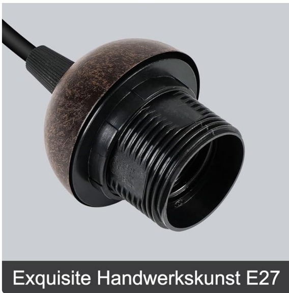
Exquisite Handwerkskunst E27