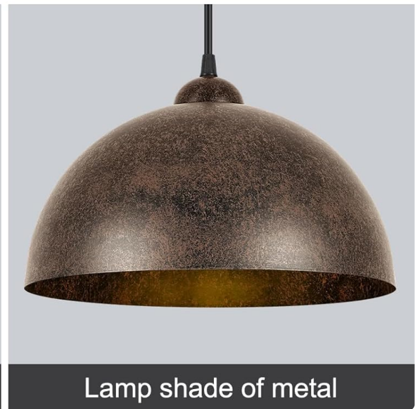
Lamp shade of metal

Image: A pair of pendant lights illuminating a dining area, showing how multiple units can be used together.