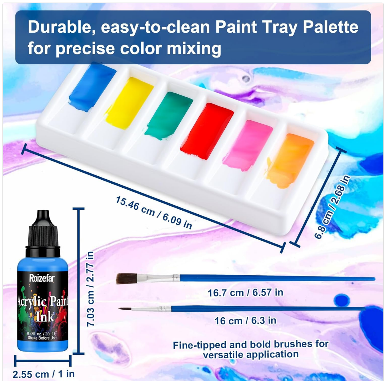
Figure 5.1: The included mixing palette and brushes, ready for use with the acrylic paint inks.

4. Prepare Brushes: Have your brushes ready. The set includes two brushes suitable for various applications.