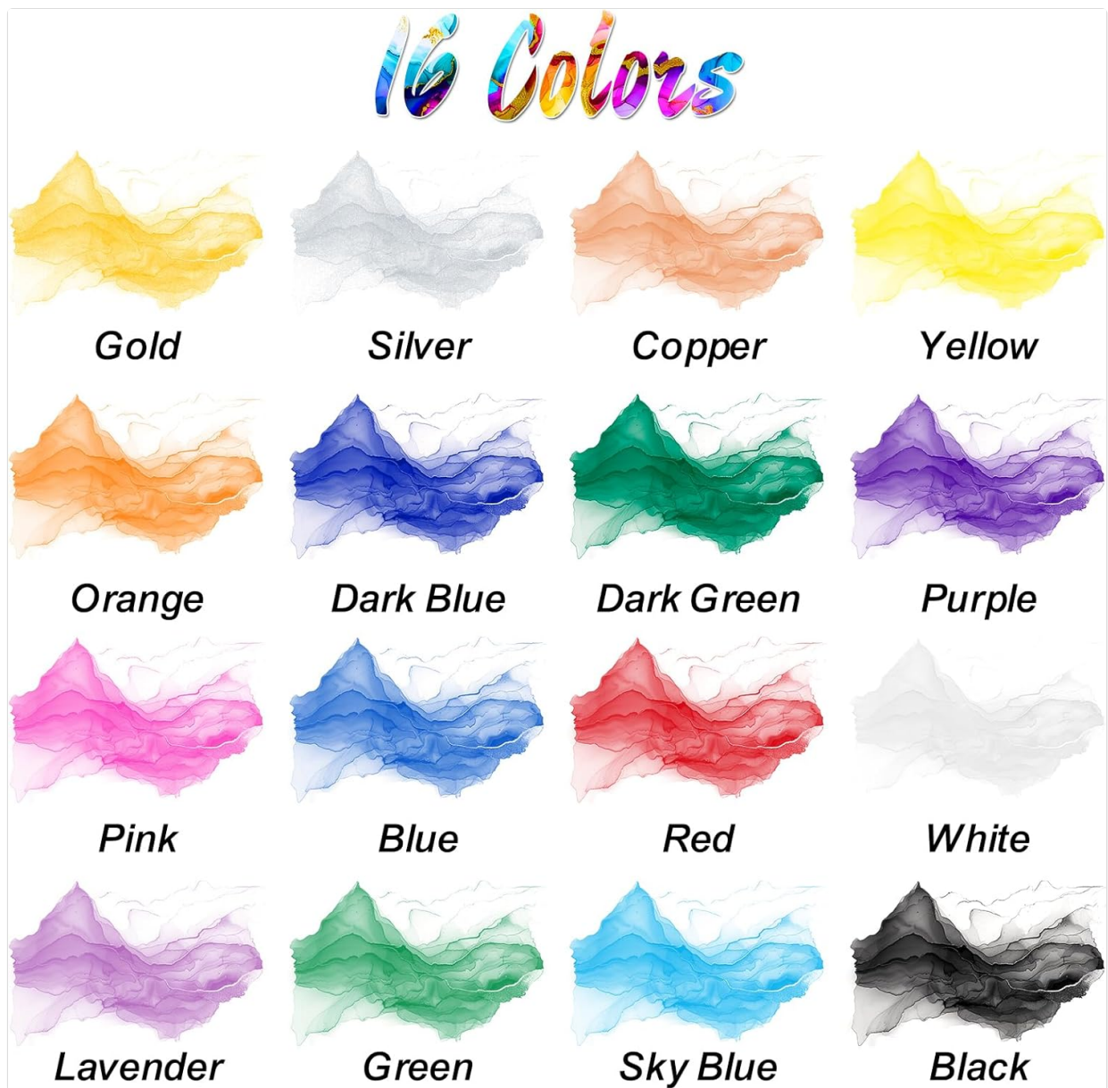
Figure 3.1: Swatches demonstrating the vibrant and diverse color range of the 16 acrylic paint inks.