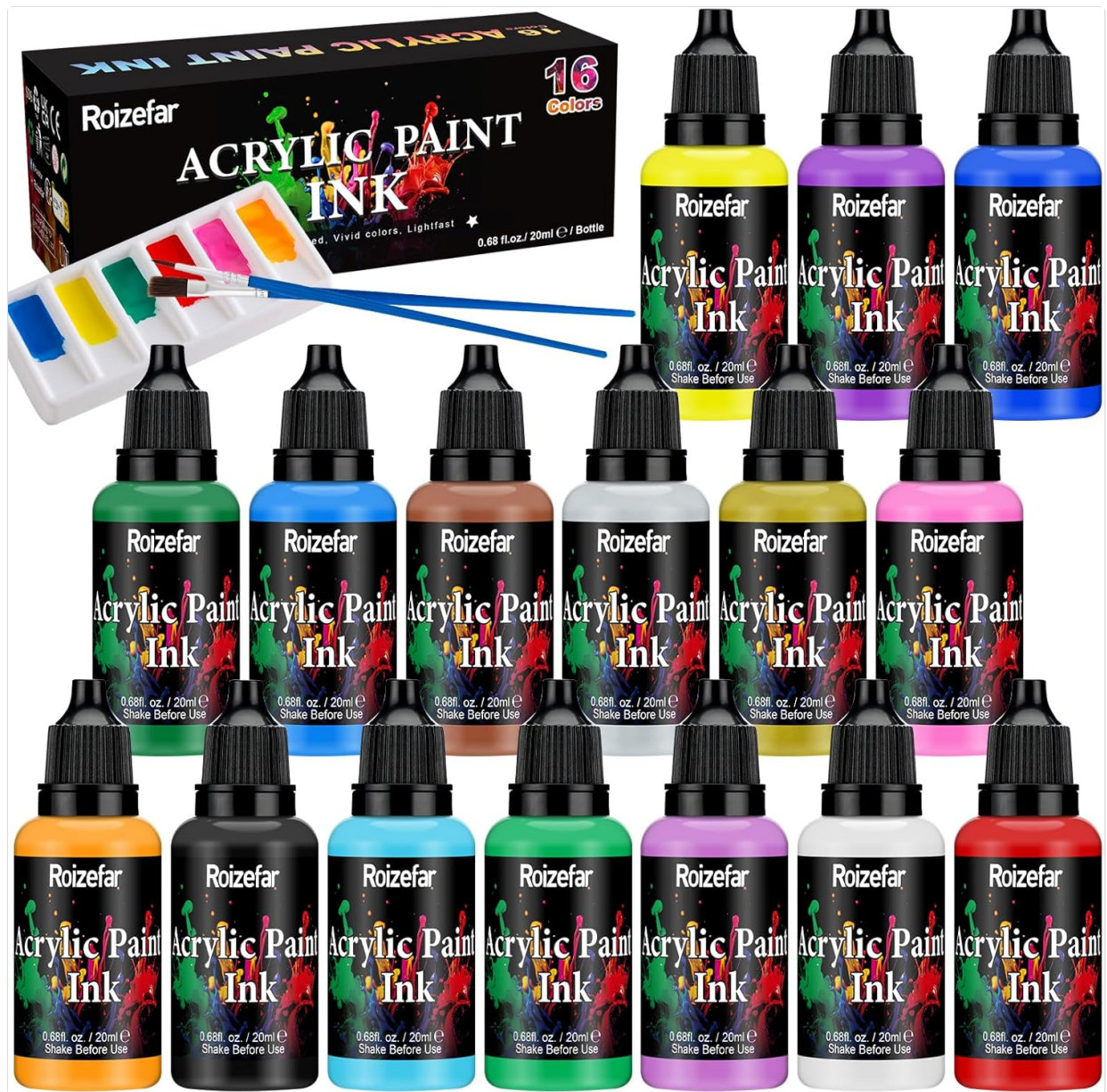
Figure 2.1: Complete Roizefar Acrylic Paint Ink Set, including 16 ink bottles, two brushes, and a mixing palette.