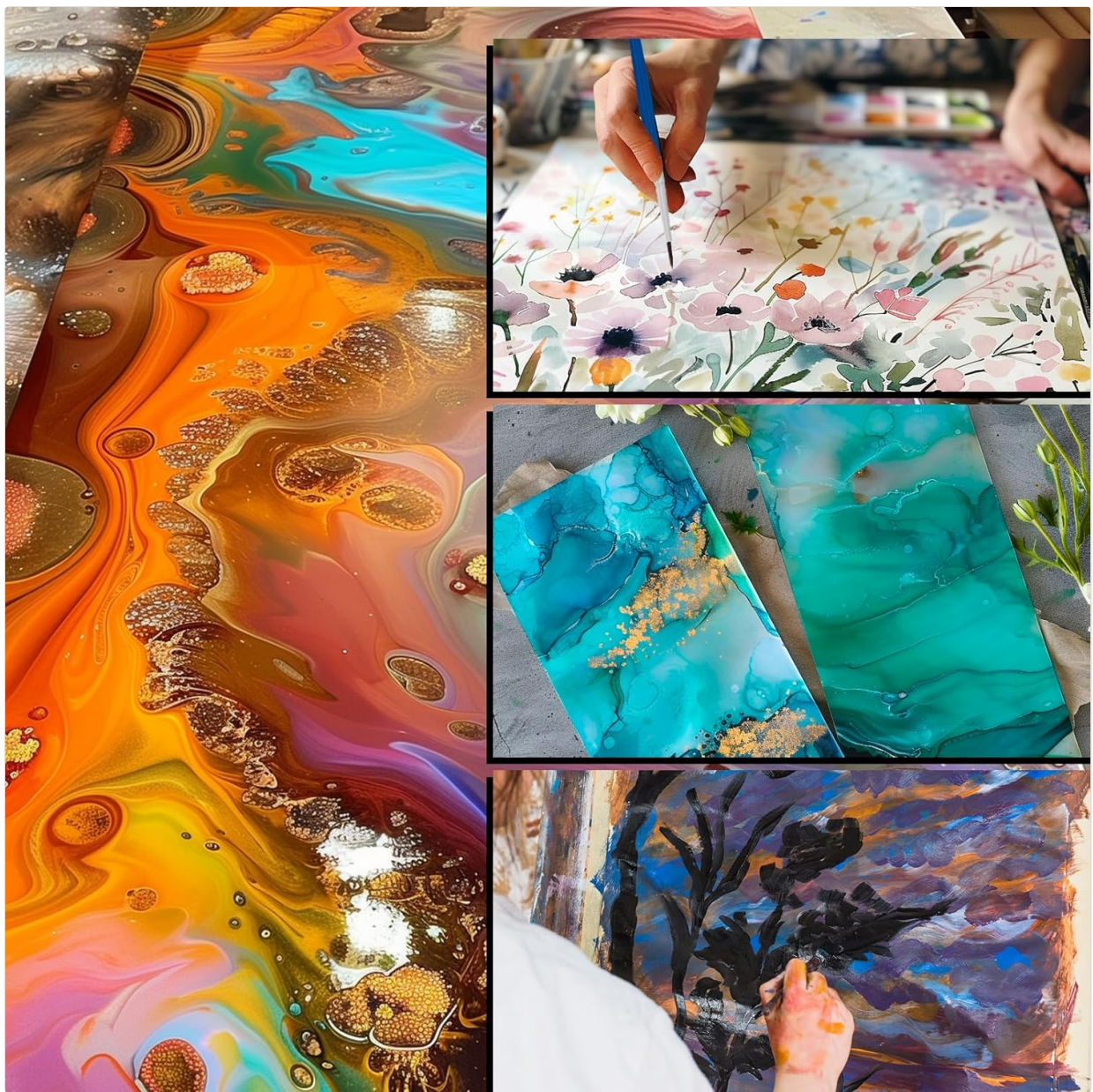
Figure 3.2: Examples of mixed media art, illustrating the versatility of the acrylic paint inks in different artistic techniques.