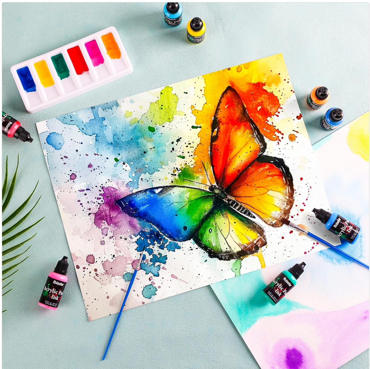
Figure 6.1: Example of a detailed artwork created with the acrylic paint inks, showcasing their blending capabilities and vibrant finish.