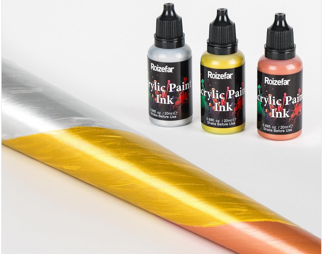
Figure 6.2: Metallic inks demonstrating their ability to add a striking, reflective finish to art pieces.

Features gold, silver, and bronze metallic paints for captivating effects