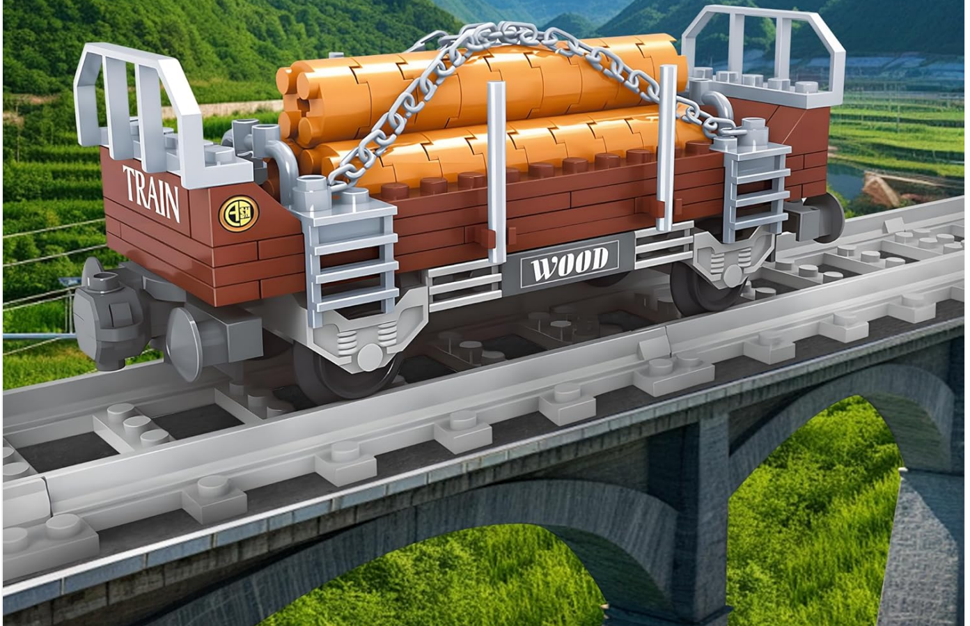
Image 4.2: The assembled freight car on its tracks, highlighting its compatibility with other building block systems.