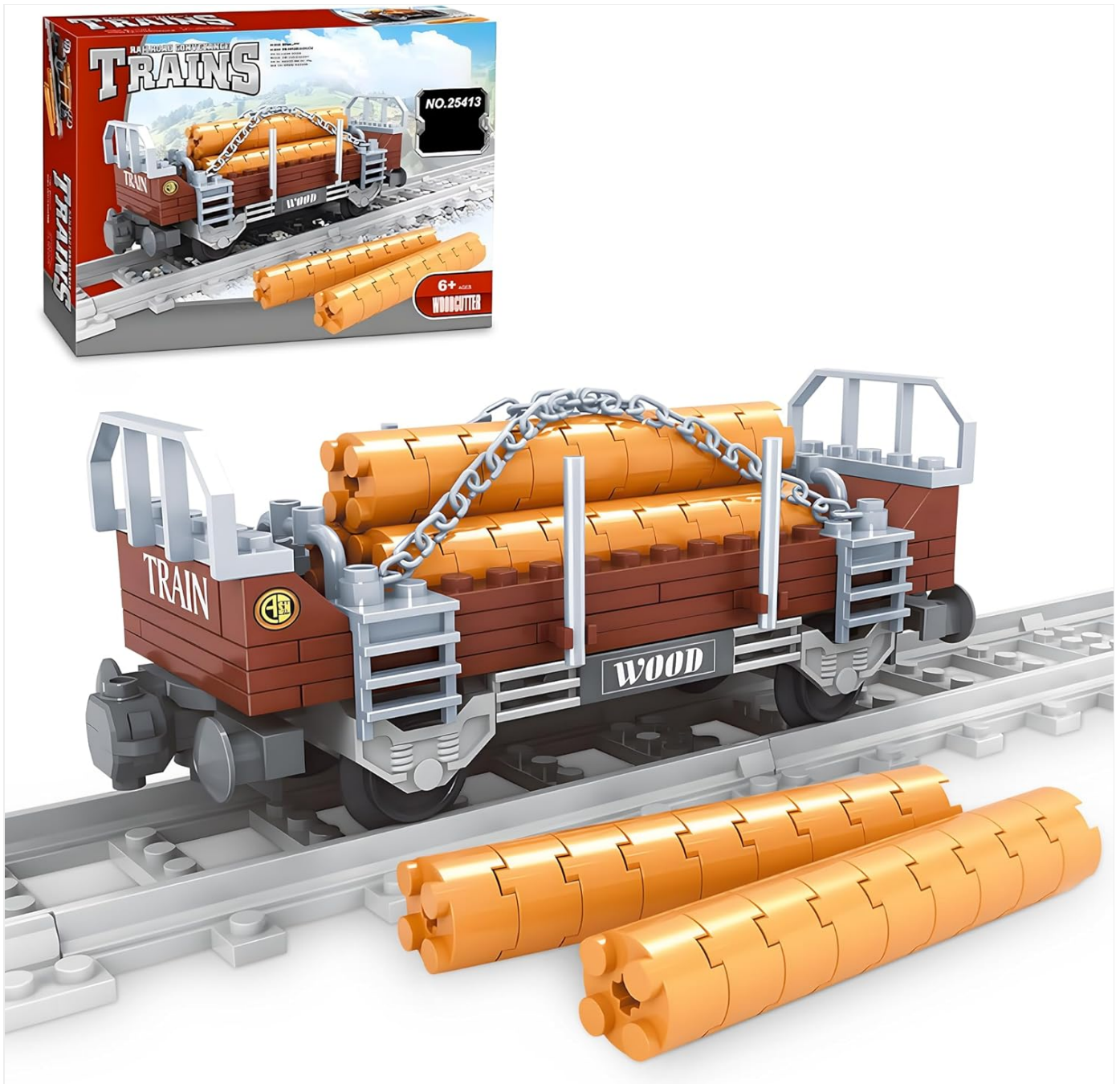
Image 1.1: The Finger Rock Wooden Train Freight Car Building Toy Set, showing the assembled model and its packaging.