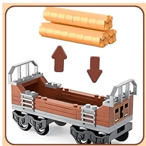
Image 5.2: Illustrates the process of removing the simulated wooden logs from the train car.