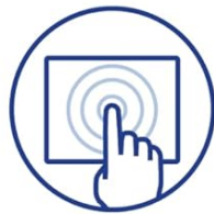
Large 4.3" Color Touchscreen