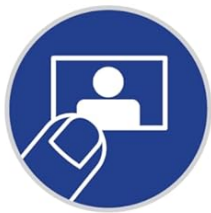
Fast, Borderless HD Photos