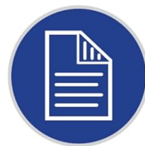
Auto 2-Sided Printing