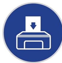
Rear Feed for Specialty Paper