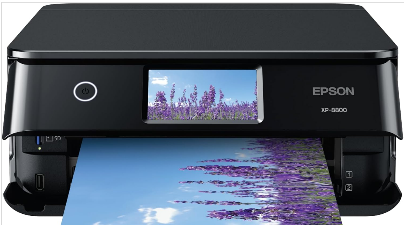
Image: Front view of the Epson Expression Photo XP-8800 Wireless Printer with a photo of lavender fields being printed.

The Epson Expression Photo XP-8800 is a versatile all-in-one wireless printer designed for high-quality photo and document printing, scanning, and copying. It features a 6-color Claria Photo HD ink system for vibrant, professional-quality borderless prints up to 8.5" x 11". Its compact design and intuitive 4.3" color touchscreen make it suitable for various home and creative projects. This manual provides essential information for setting up, operating, maintaining, and troubleshooting your printer.