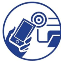
Epson Smart Panel® app 1 for Printer Operation, Monitoring & Wireless Setup Through Your Mobile Device