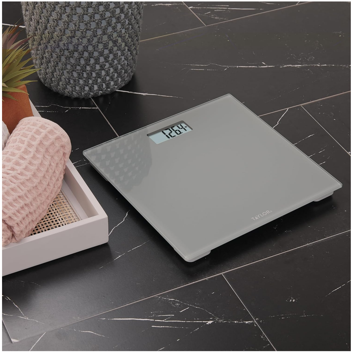
Image: The scale in a typical bathroom setting, ready for use.