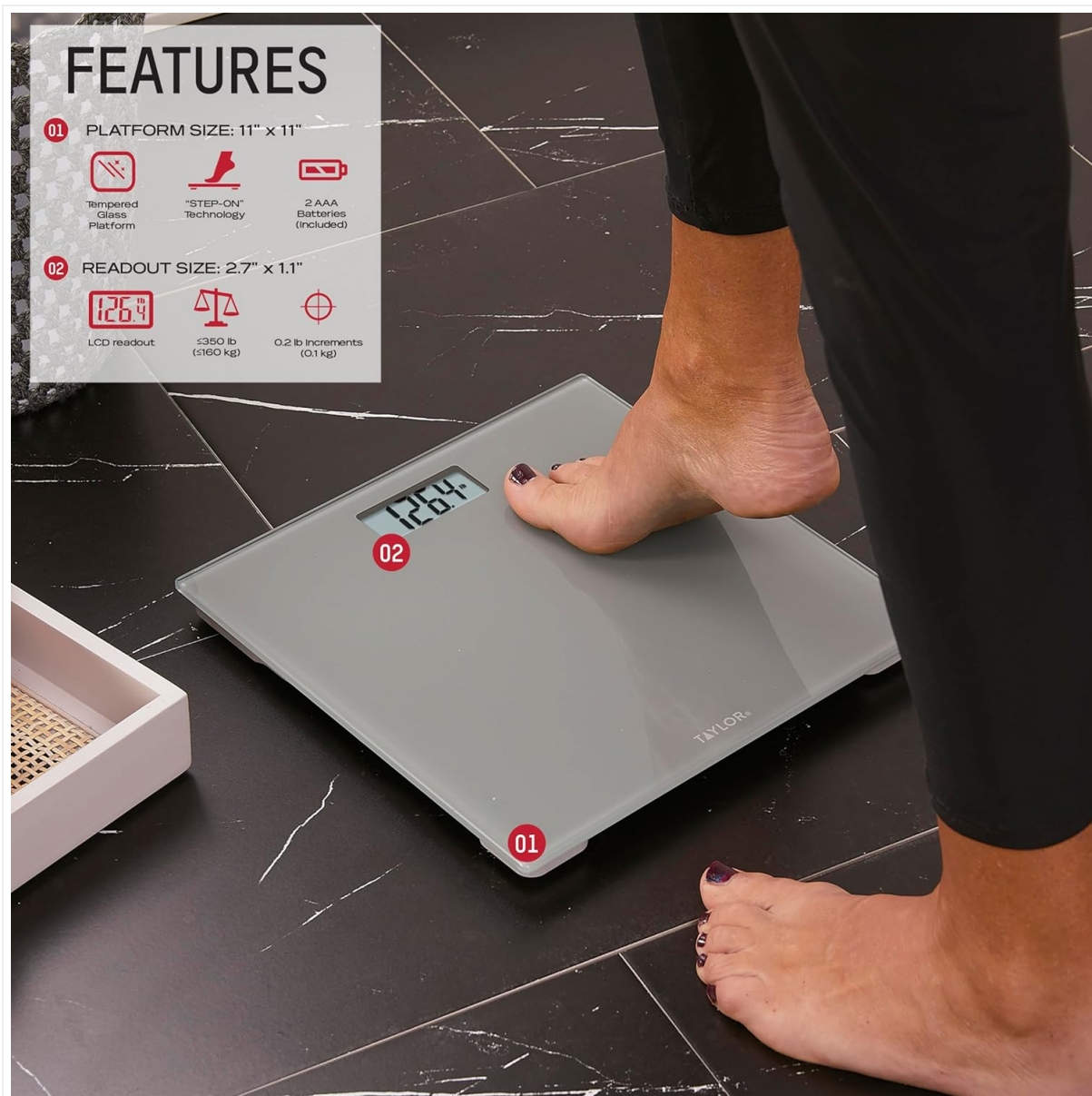
Image: The Taylor Digital Bathroom Scale in use, displaying a weight reading on its digital screen.