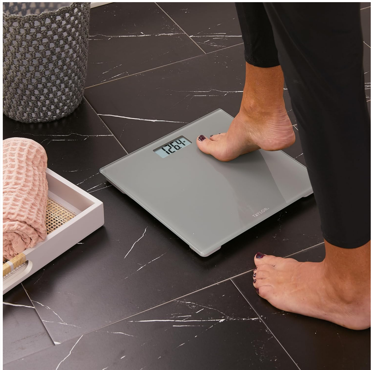
Image: A person stepping onto the scale to take a weight measurement.