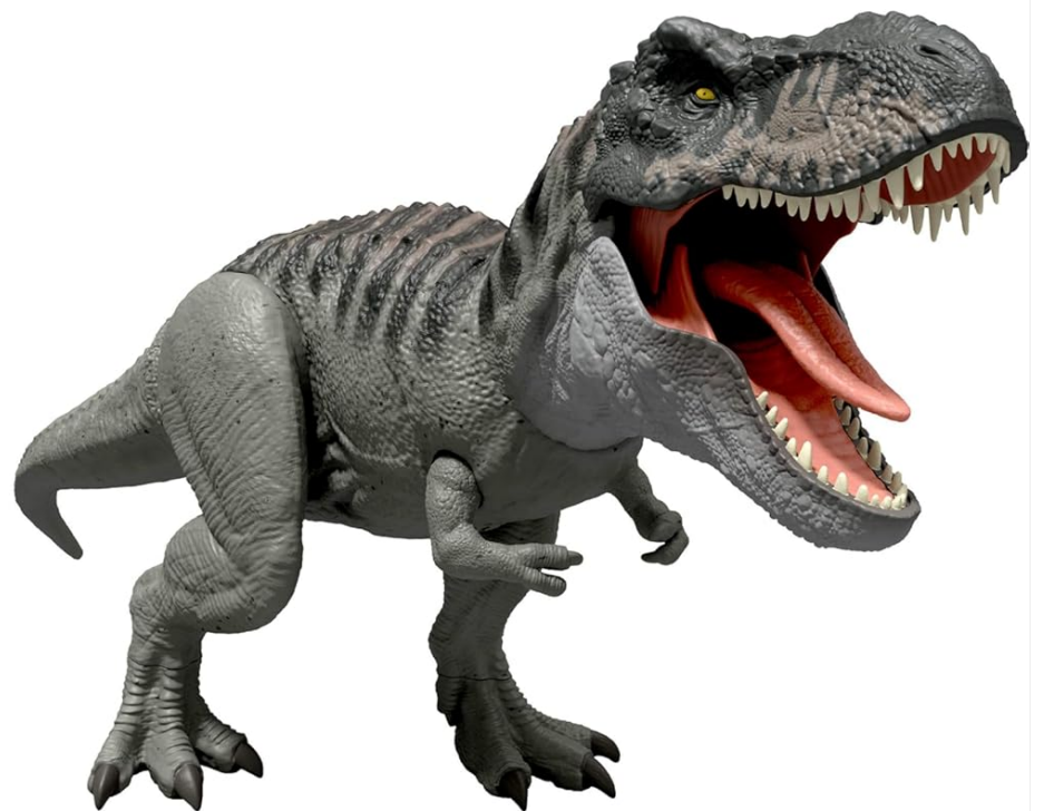
Figure in its original packaging.