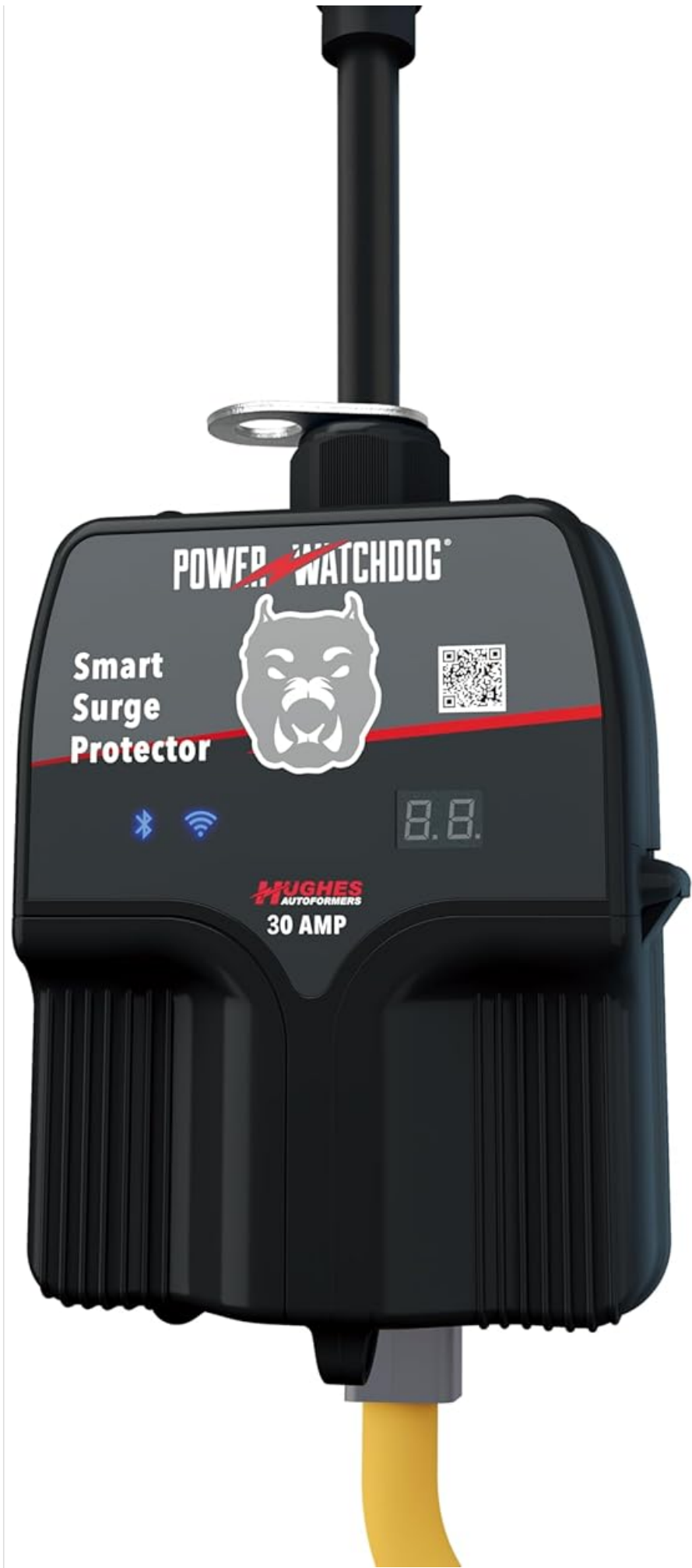
Image: The Power Watchdog PWD30W Smart RV Portable Surge Protector with its protective cover closed, ready for use.