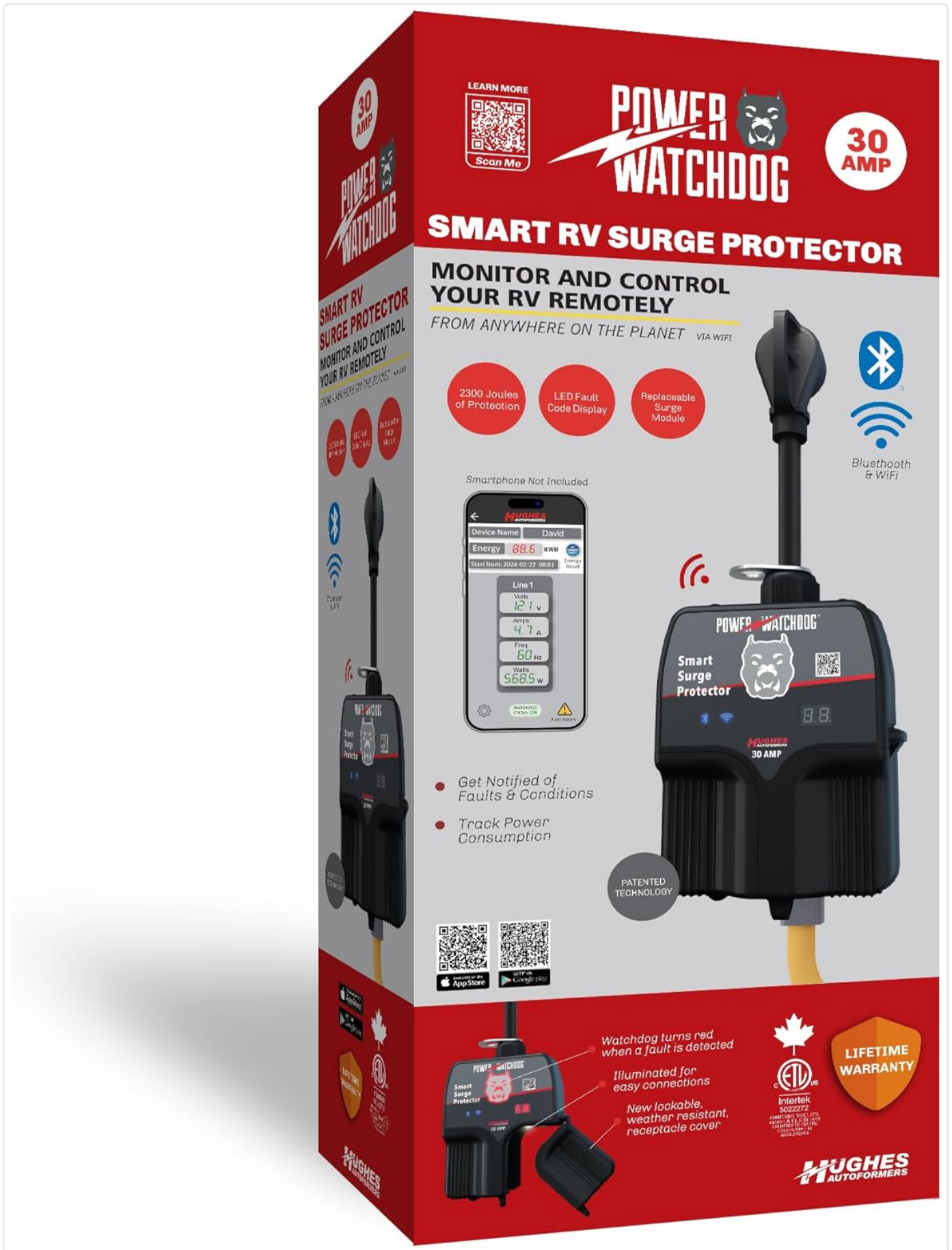
Image: Product packaging highlighting the mobile app interface for monitoring and control.