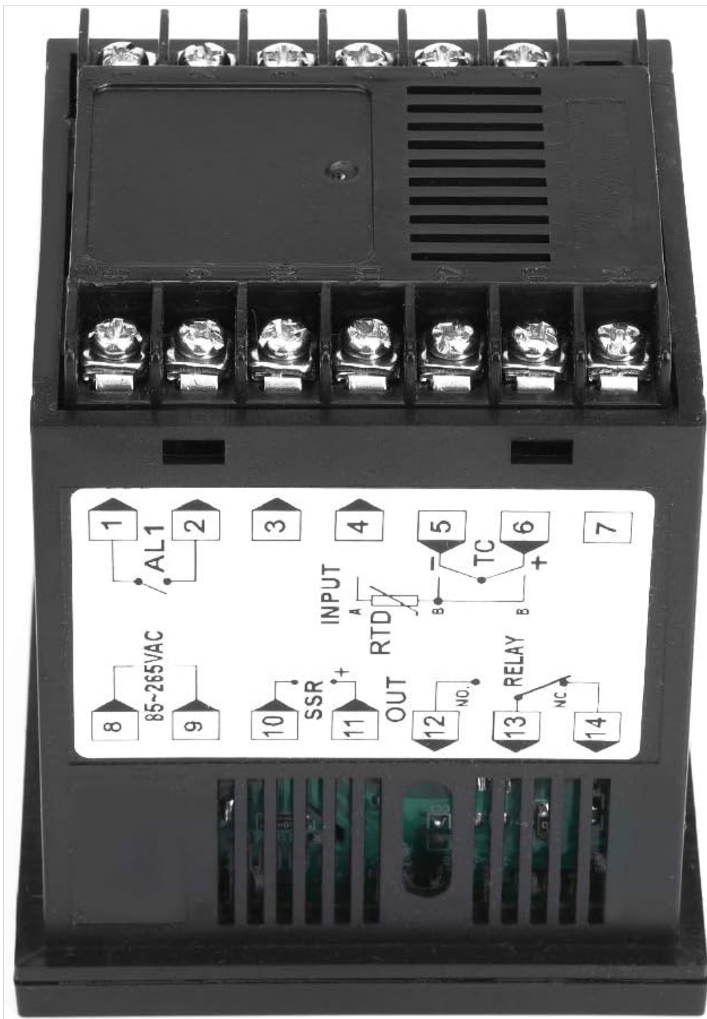
Figure 4.2: Wiring Terminal Diagram

This image provides a top-down view of the MC701 controller's terminal block, illustrating the wiring connections. It shows terminals for 85-265VAC power input (8, 9), AL1 (Alarm 1) output (1, 2), SSR output (10, 11), RTD/TC input (3, 4, 5, 6, 7), and Relay output (12, 13, 14).