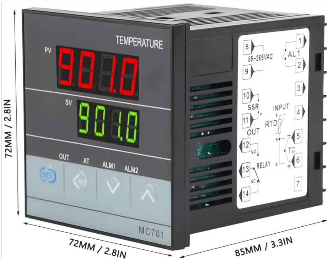
Figure 4.3: Product Dimensions

This image shows a side view of the MC701 controller with its physical dimensions indicated. The front panel measures 72mm x 72mm (2.8in x 2.8in), and the depth of the unit is 85mm (3.3in).